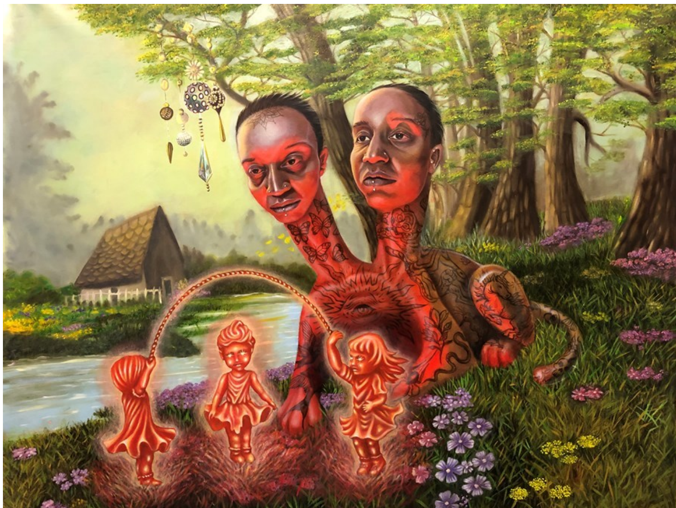
Tslil Tsemet "Jumping Rope" 2022, Oil on canvas, 109 x 140 cm, 43 x 55 in