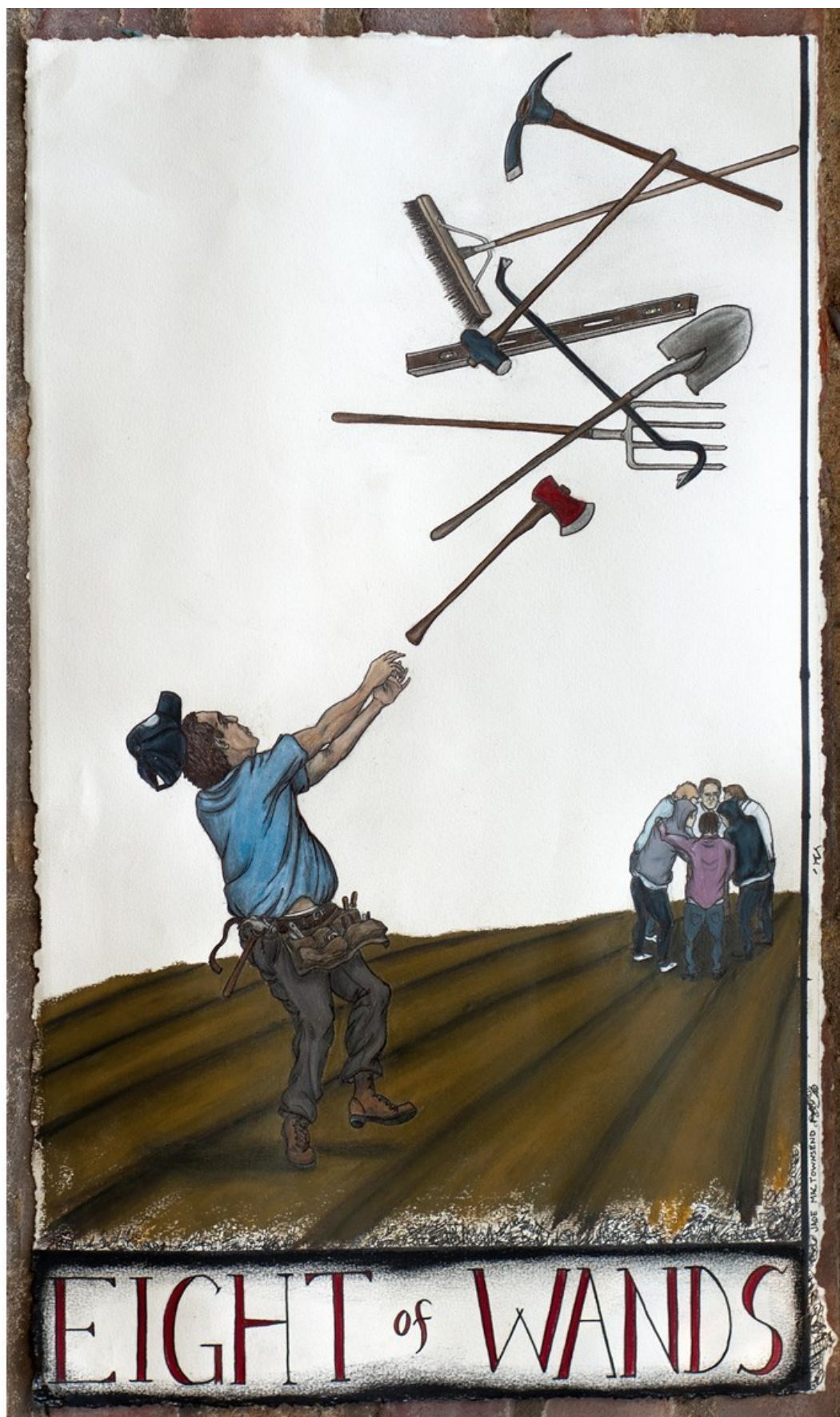
Jade Townsend, Eight of Wands, 2014, Graphite, prisma color, oil and ink on paper 61 x 33 cm , 24 x 13 in