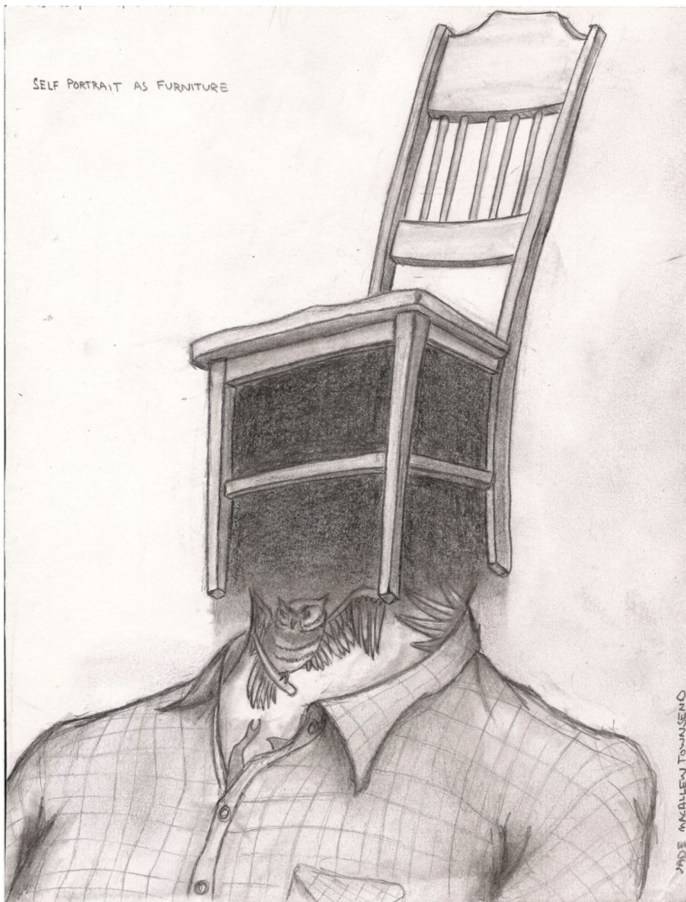
Jade Townsend, Self Portrait as Furniture, 2014, Graphite on paper 28 x 22 cm, 11 x 8.7 in