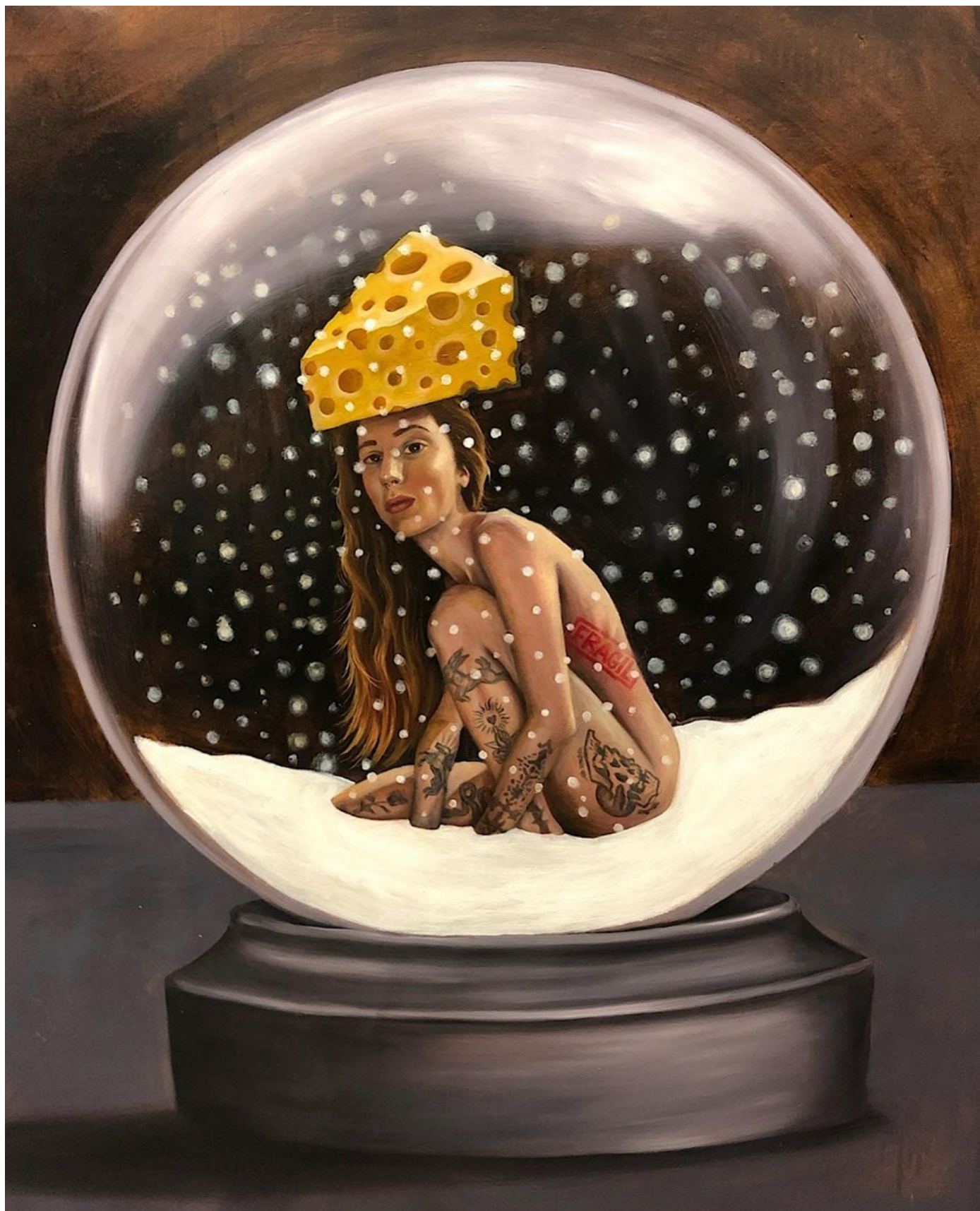
Tsilil Tsemet "Cheesy self portrait" 2021, Oil on canvas, 107 x 86,5 cm, 42 x 34 in