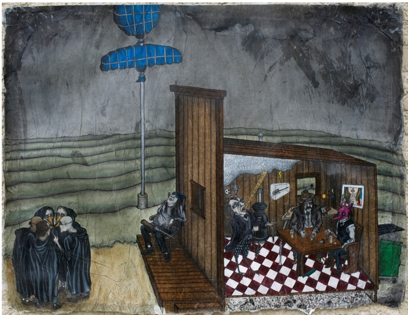
Jade Townsend, The Offering of Ears To Freewill and Fate , 2016, Graphite, prisma color, pastel, oil, and ink on paper 69 x 91 cm, 27 x 36 in