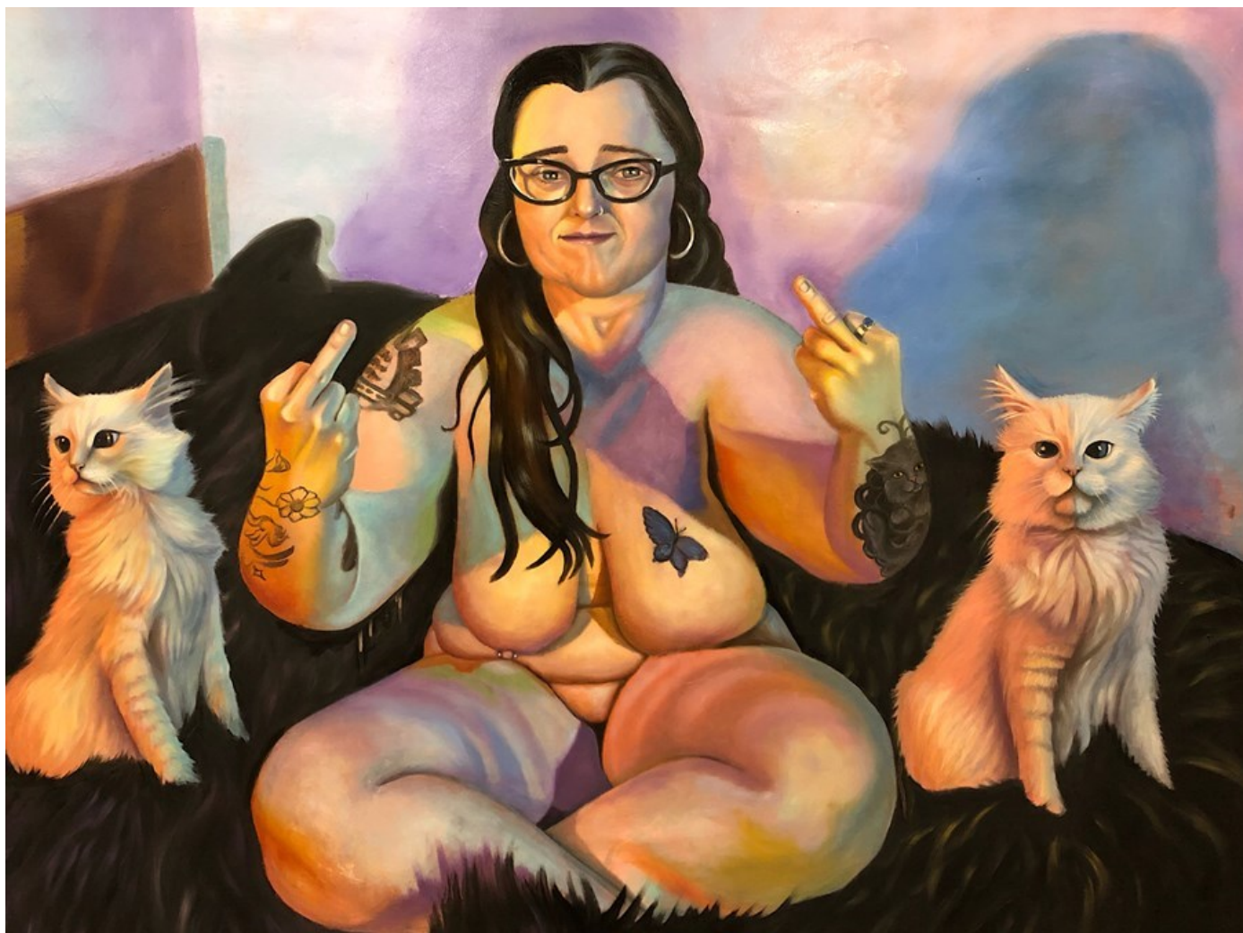
Tsilil Tsemet "Spinster" 2020, Oil on canvas, 94 x 132 cm, 37 x 52 in