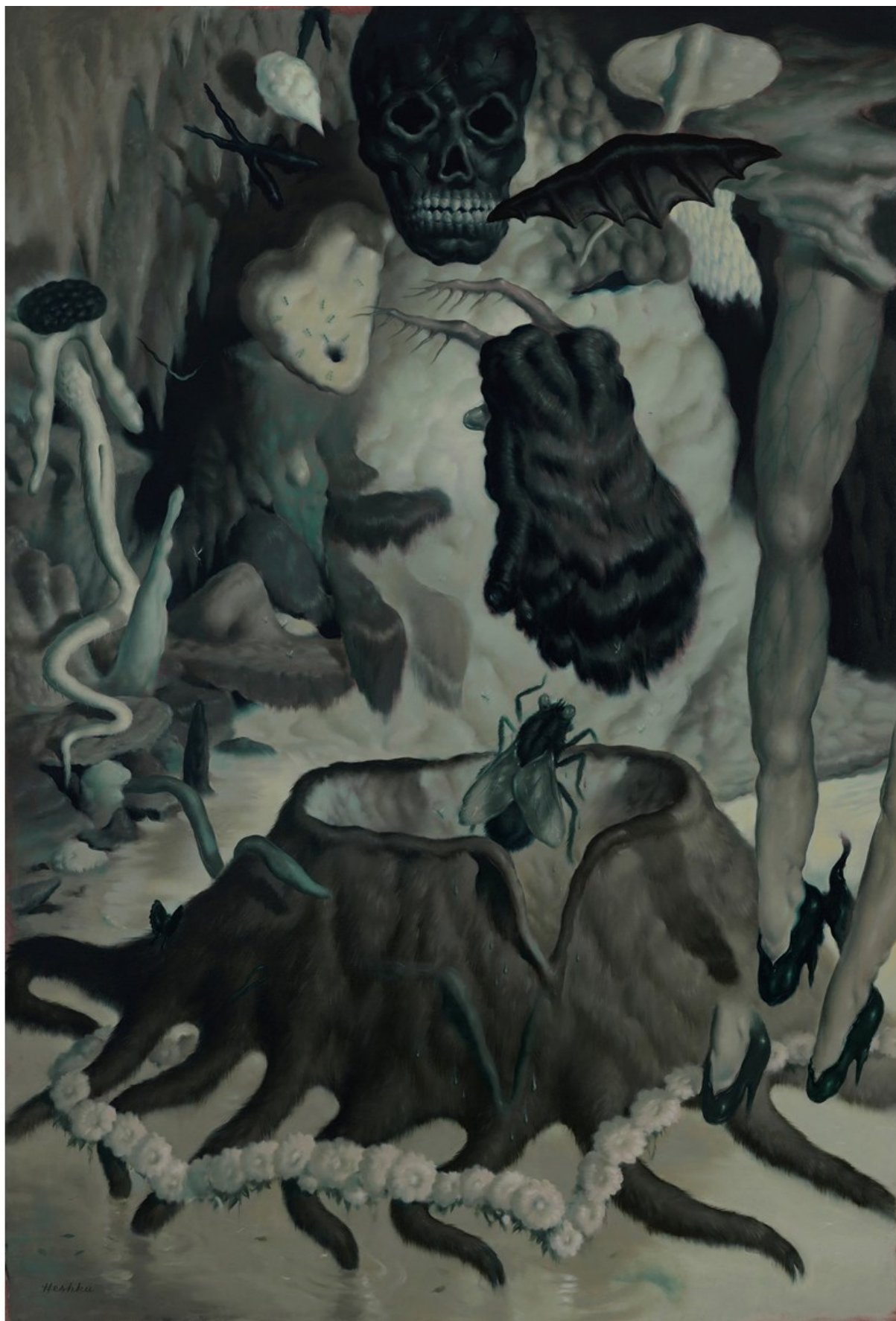
Ryan Heshka, "Our Chasm" 2020., oil on canvas, 142 x 97 cm, 56 x 38 in