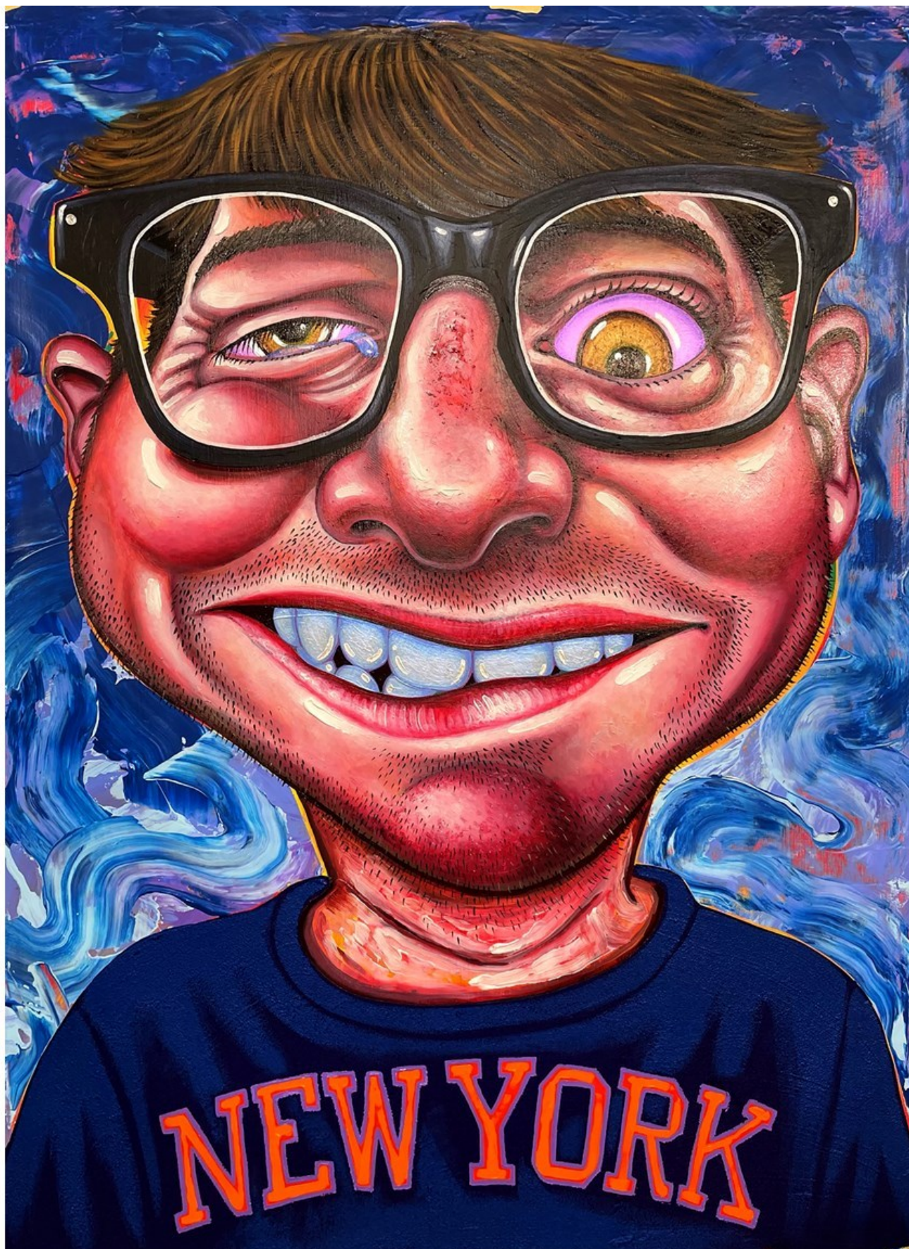
Tom Sanford "Portrait of the Artist at the End of 2023", 2023 Acrylic on canvas, 122 x 91,5 cm, 48 x 36 in