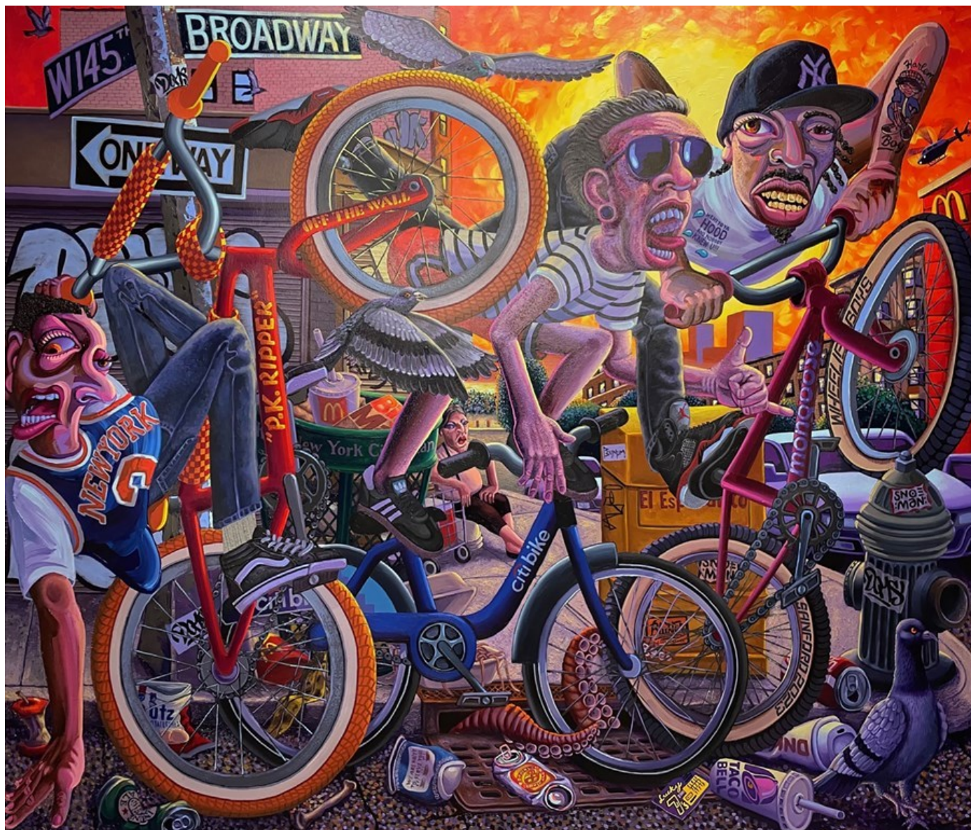
Tom Sanford "Wheelie Boys Ride Out" 2023, Acrylic on canvas, 57,5 x 183 cm, 62 x 72 in