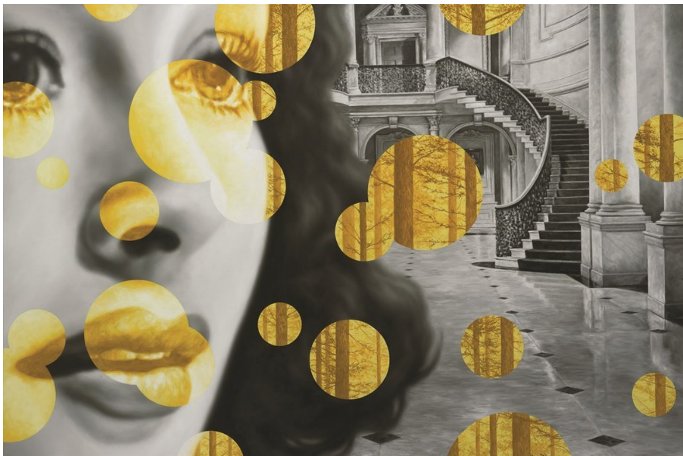
Eric White "Foyer", Giclee print - Edition of 50, 50 x 71 cm, 19,7 x 28 in