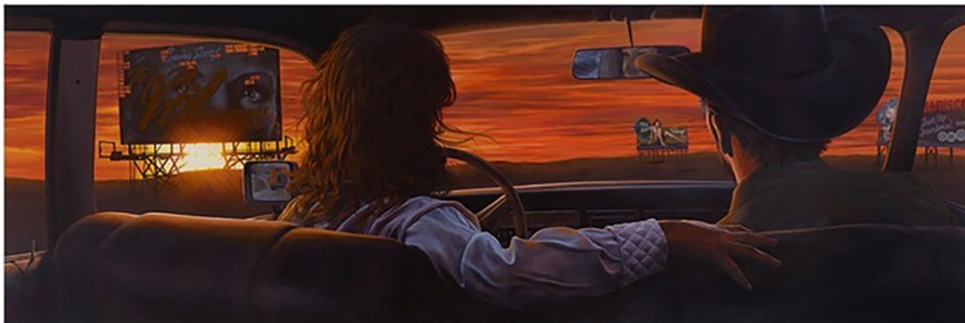
Eric White "Down In Front (Coming Soon)" 2019, Pigment inkjet print 305gm Hotpress paper - Edition of 20, 25,5 x 76 cm, 10 x 30 in