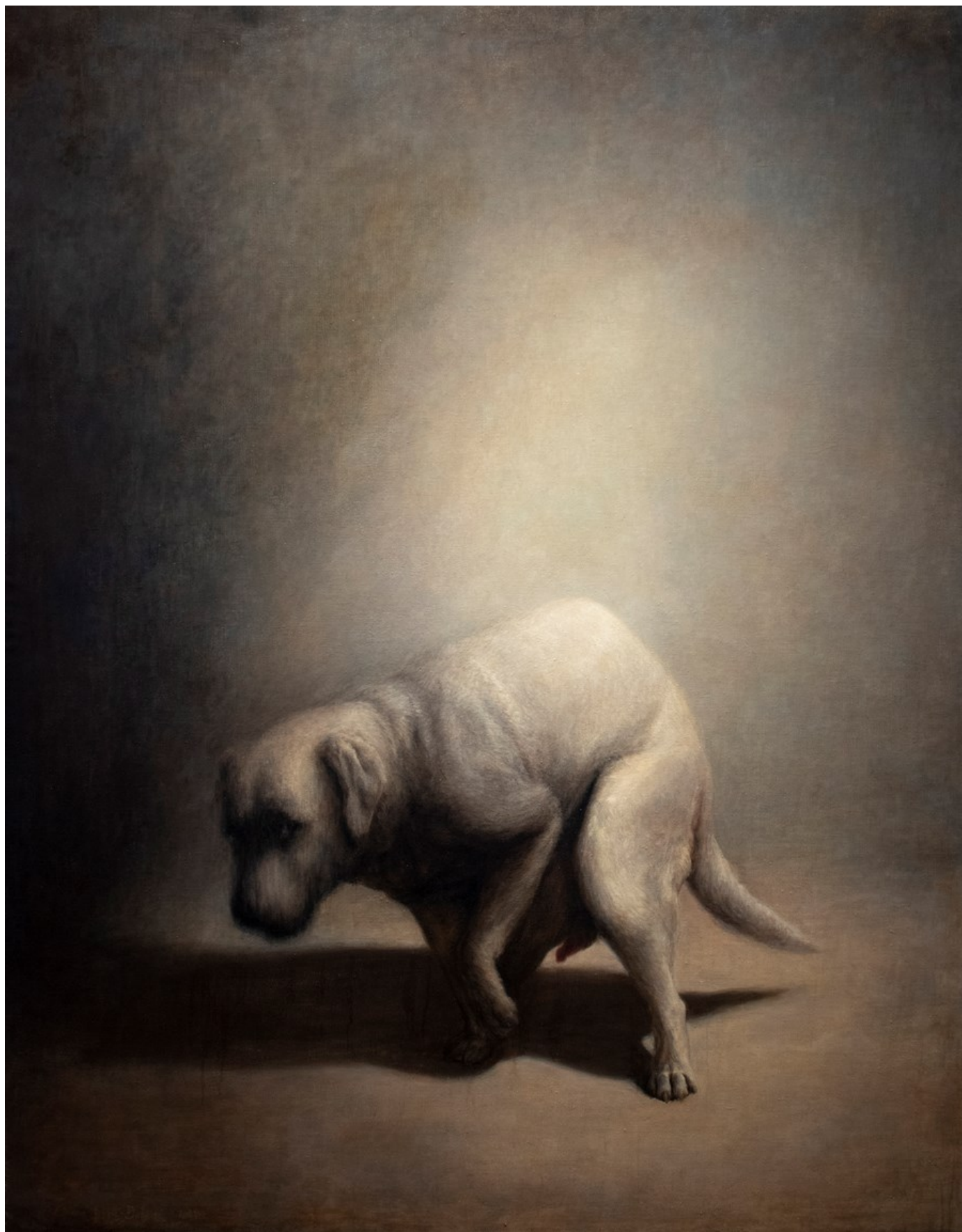
Rene Grgic-Dakovic "Nothing but Air" 2023, Oil on linen, 175 x 137 cm, 69 x 54 in