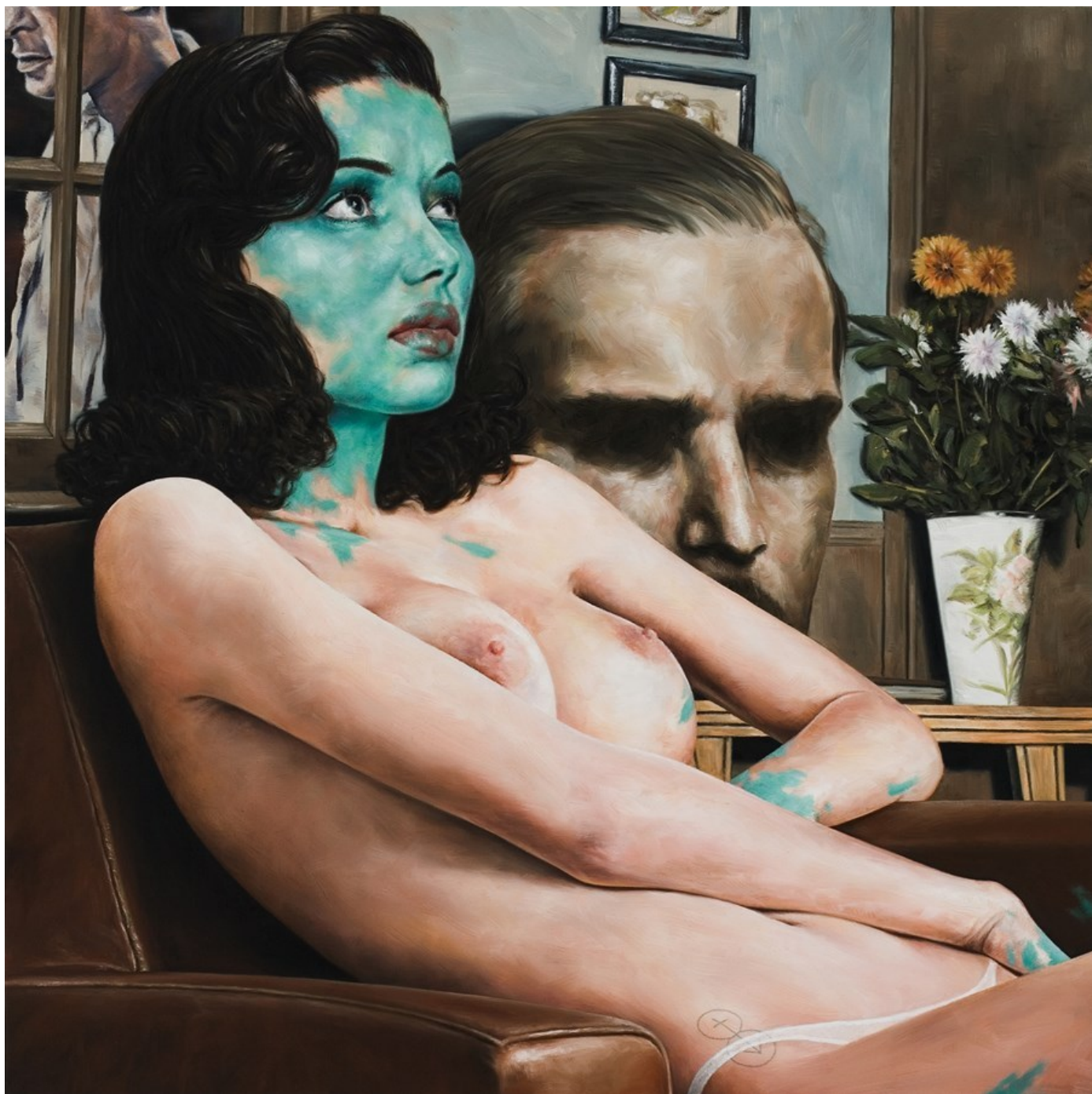
Eric White "No Neutral Thoughts", Archival 100% rag paper, signed and numbered giclée - Edition of 50, 46 x 46 cm, 18,1 x 18,1 in