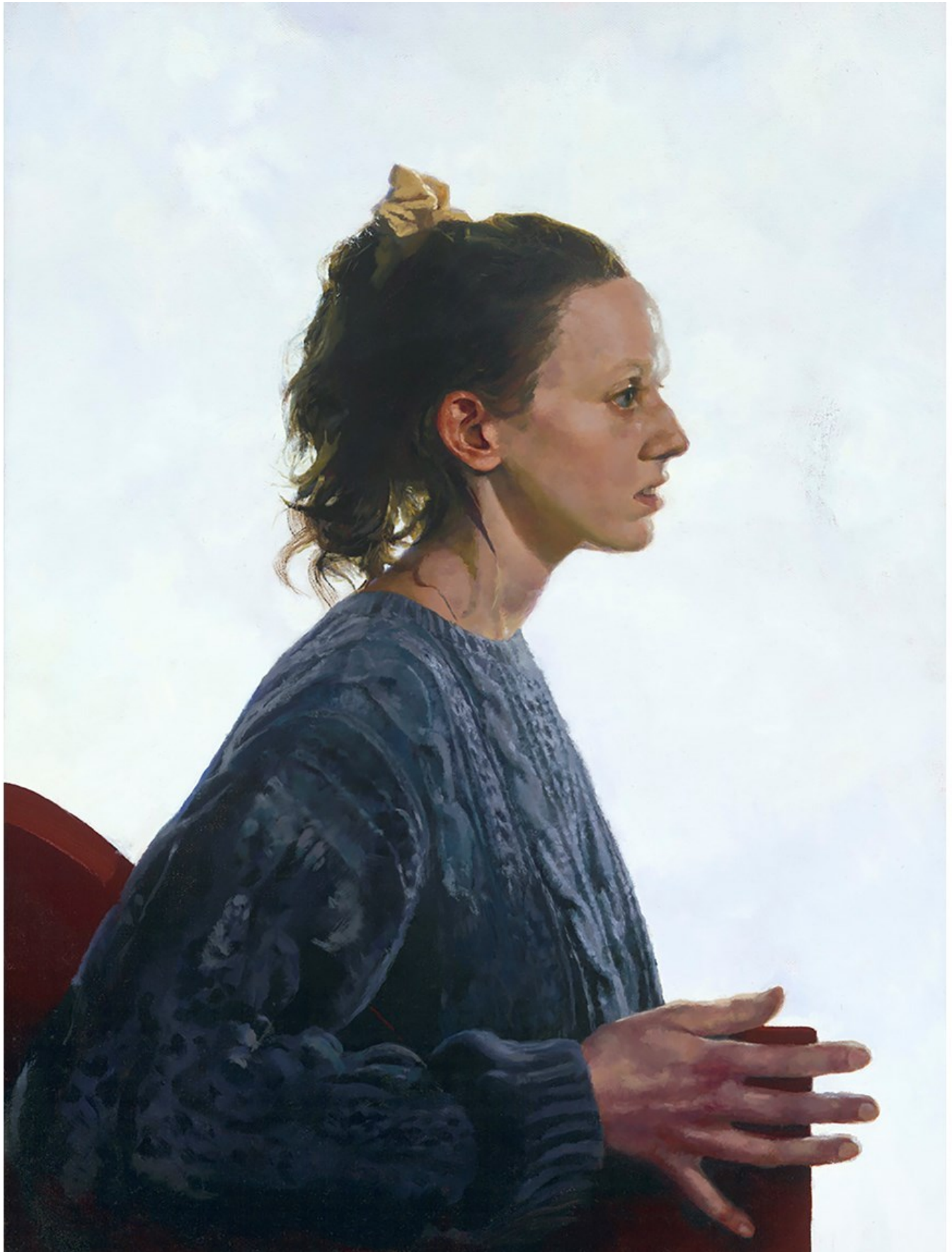
"Opt Out" 2022, Oil on canvas, 51 x 40,5 cm, 20 x 16 in

GALLERY POULSEN CONTEMPORARY FINE ARTS - COPENHAGEN