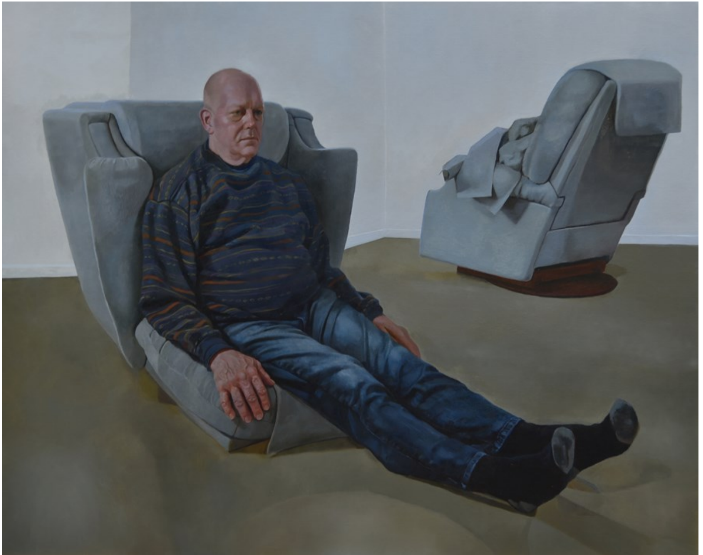
"Laughing at the Right Time" 2023, Oil on canvas, 122 x 152,5 cm, 40 x 60 in

GALLERY POULSEN CONTEMPORARY FINE ARTS - COPENHAGEN