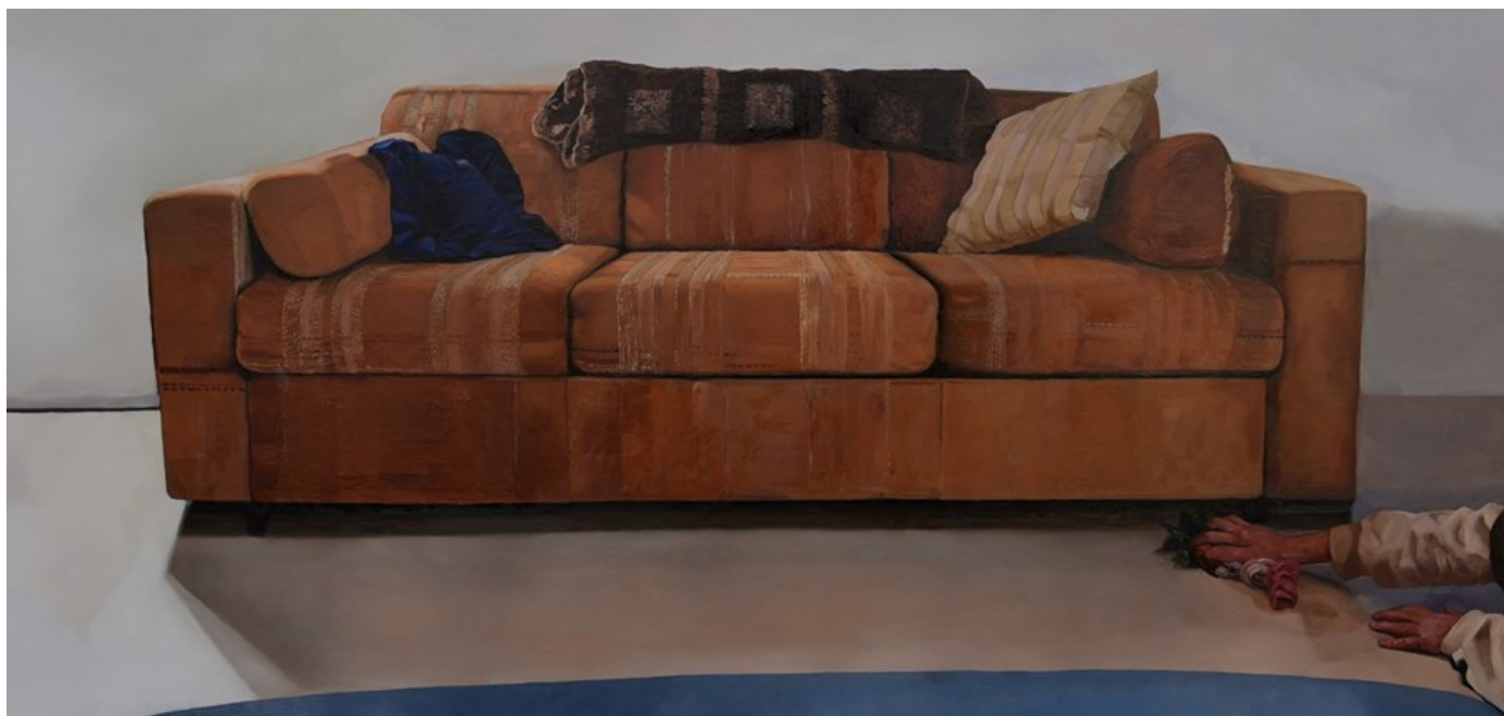
Bored When it's Over, 2019, oil on canvas, 70 x 122 cm, 24 x 48 in

GALLERY POULSEN CONTEMPORARY FINE ARTS - COPENHAGEN