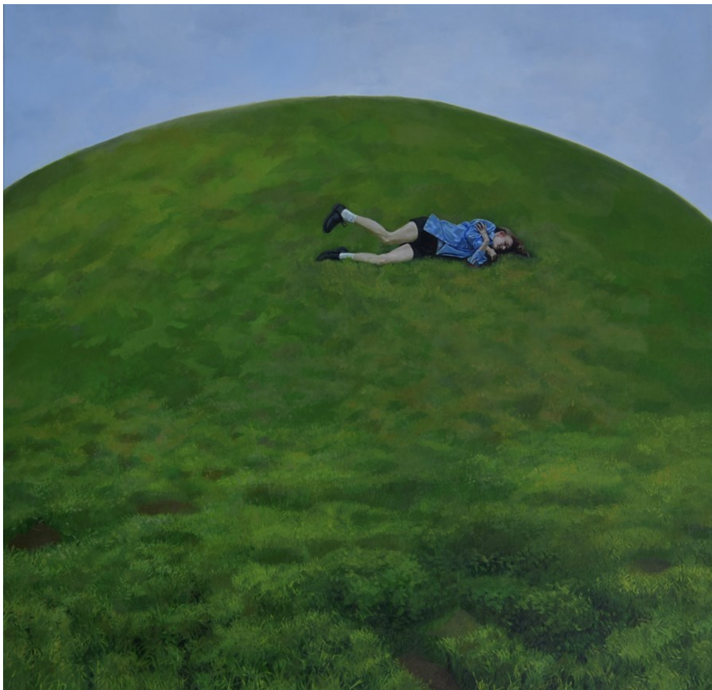
"Rolling Down a Hill" 2022, Oil on canvas, 76 x 76 cm, 30 x 30 in

GALLERY POULSEN CONTEMPORARY FINE ARTS - COPENHAGEN