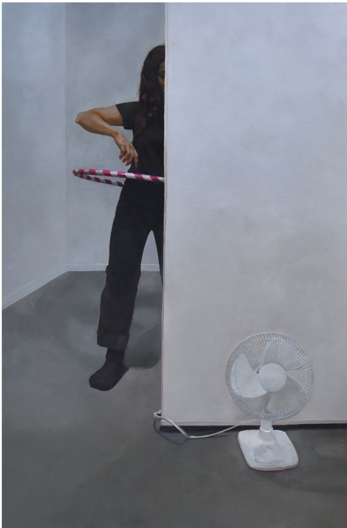
"Stop Now and It Was All for Nothing" 2023, Oil on canvas, 152,5 x 101,5 cm, 60 x 40 in

GALLERY POULSEN CONTEMPORARY FINE ARTS - COPENHAGEN