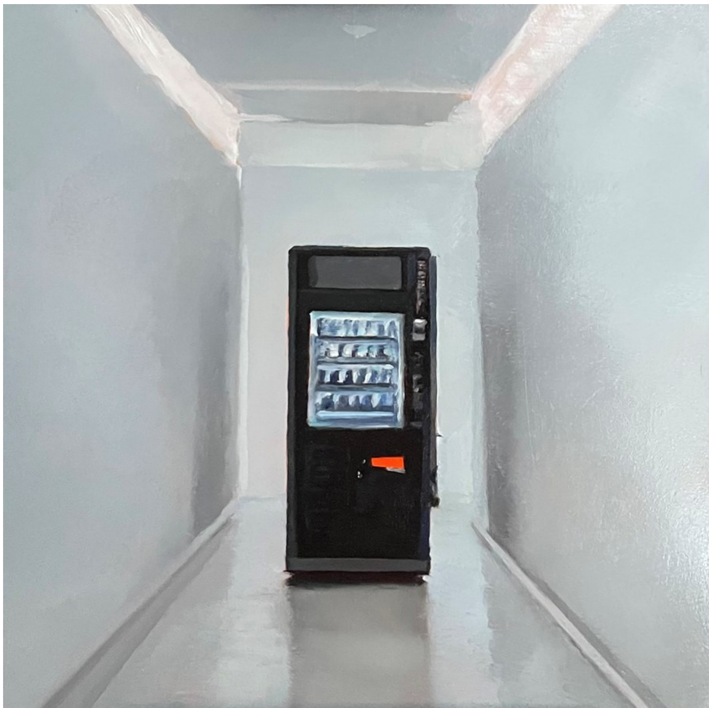
"Dark Vending Machine" 2023, Oil on panel, 25,5 x 25,5 cm, 10 x 10 in

GALLERY POULSEN CONTEMPORARY FINE ARTS - COPENHAGEN