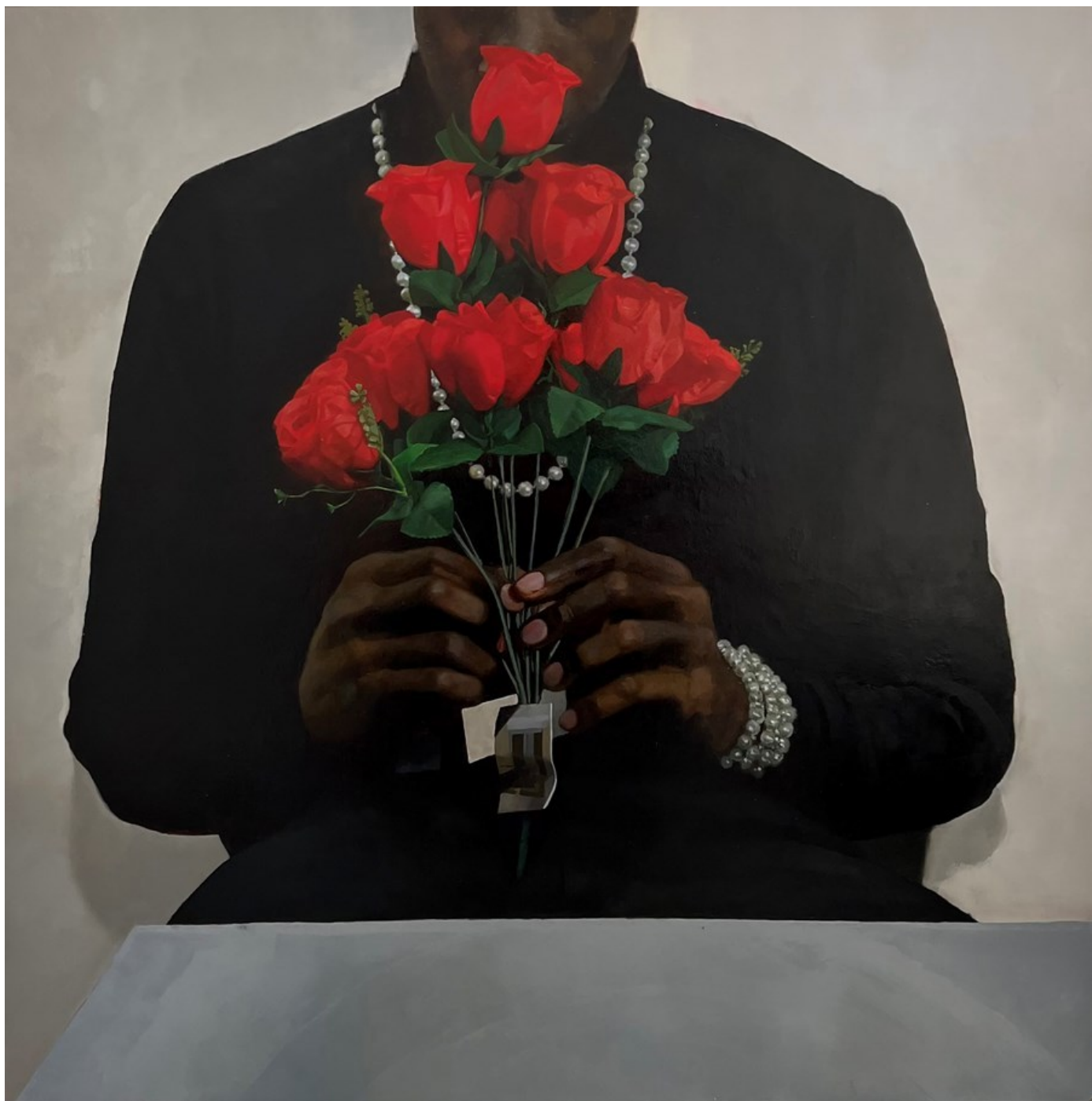
"More Real" 2022, Oil on panel, 91 x 91 cm, 36 x 36 in

GALLERY POULSEN CONTEMPORARY FINE ARTS - COPENHAGEN