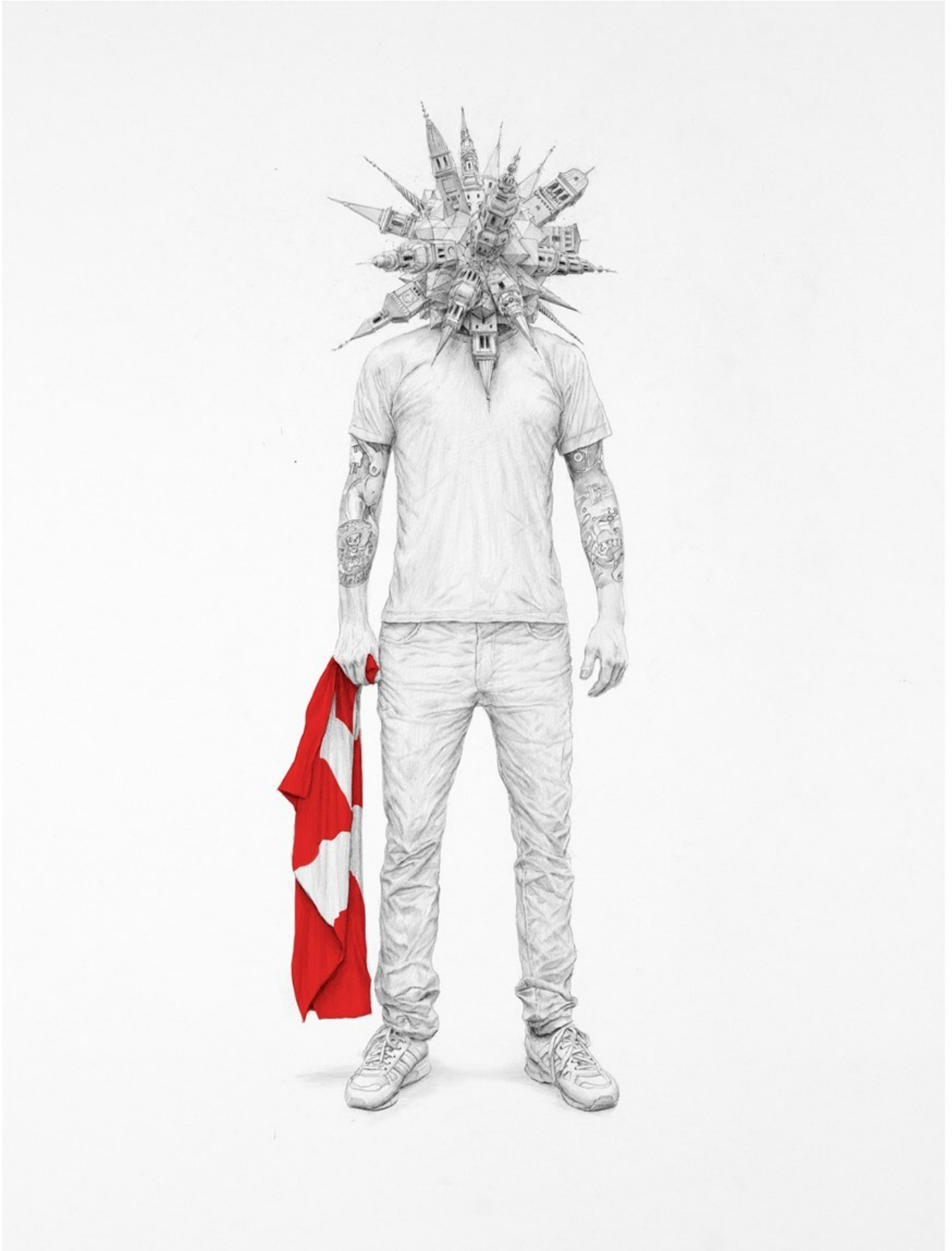
"Untitled Dansker 1" 2014, Silkscreen print two color on Coventry Rag paper., edition of 36 + 4 AP, 61 x 46 cm, 24 x 18 in

GALLERY POULSEN CONTEMPORARY FINE ARTS - COPENHAGEN