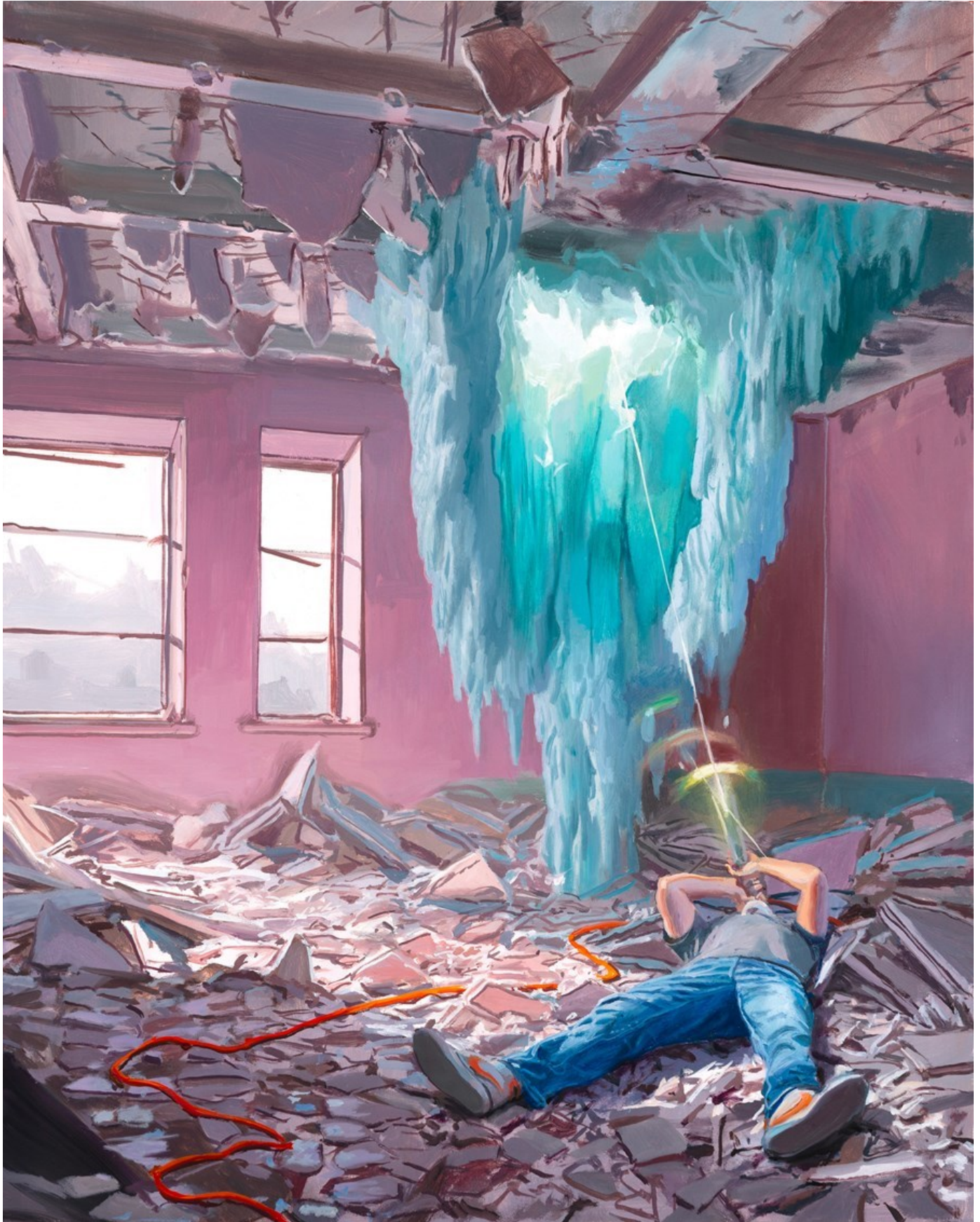
"In Utero" 2025, Oil on linen, 36 x 28 cm, 14 x 11 in

GALLERY POULSEN CONTEMPORARY FINE ARTS - COPENHAGEN