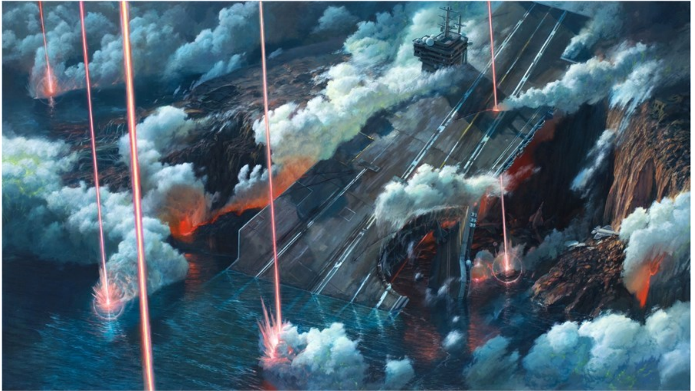
"Meridians" 2008, Oil on canvas, 121 x 213 cm, 48 x 84 in

GALLERY POULSEN CONTEMPORARY FINE ARTS - COPENHAGEN