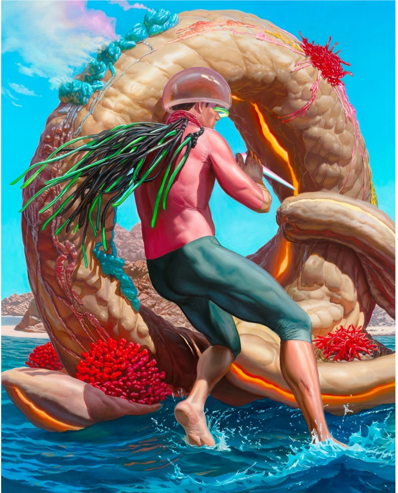
"Acclimation Capacity" 2023, Oil on linen - 152,5 x 122 cm, 60 x 48 in, $30,000 (+ 5% Danish art tax)

GALLERY POULSEN CONTEMPORARY FINE ARTS - COPENHAGEN