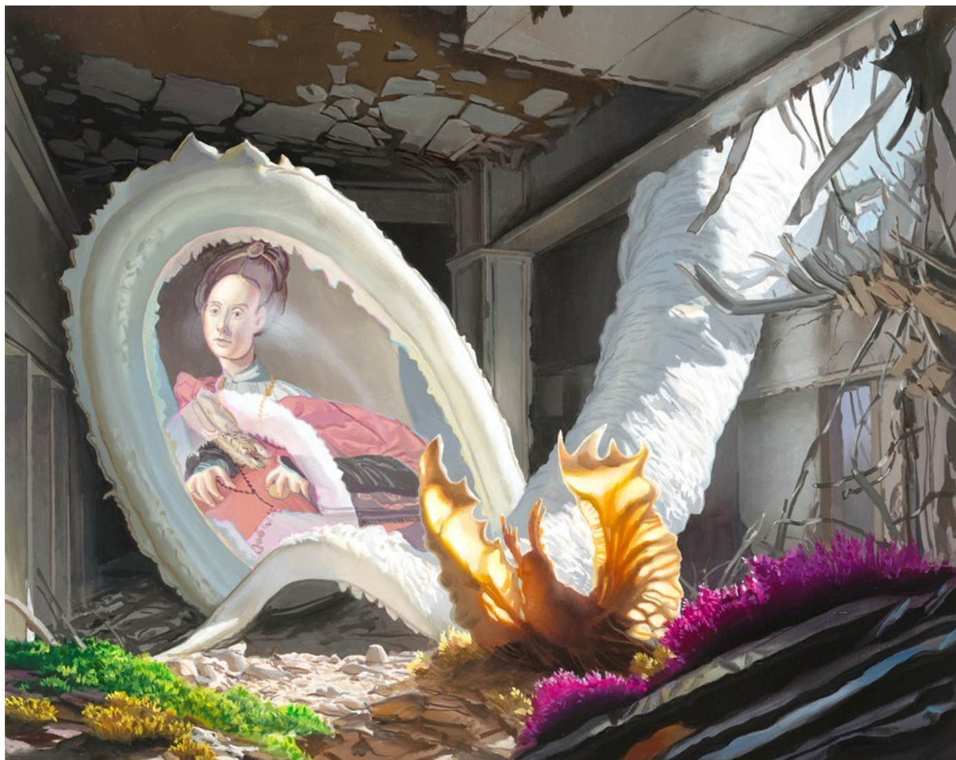
Jean-Pierre Roy "We've made it with our condition" 2024, Oil on panel, 41 x 51 cm, 16 x 20 in

GALLERY POULSEN CONTEMPORARY FINE ARTS - COPENHAGEN