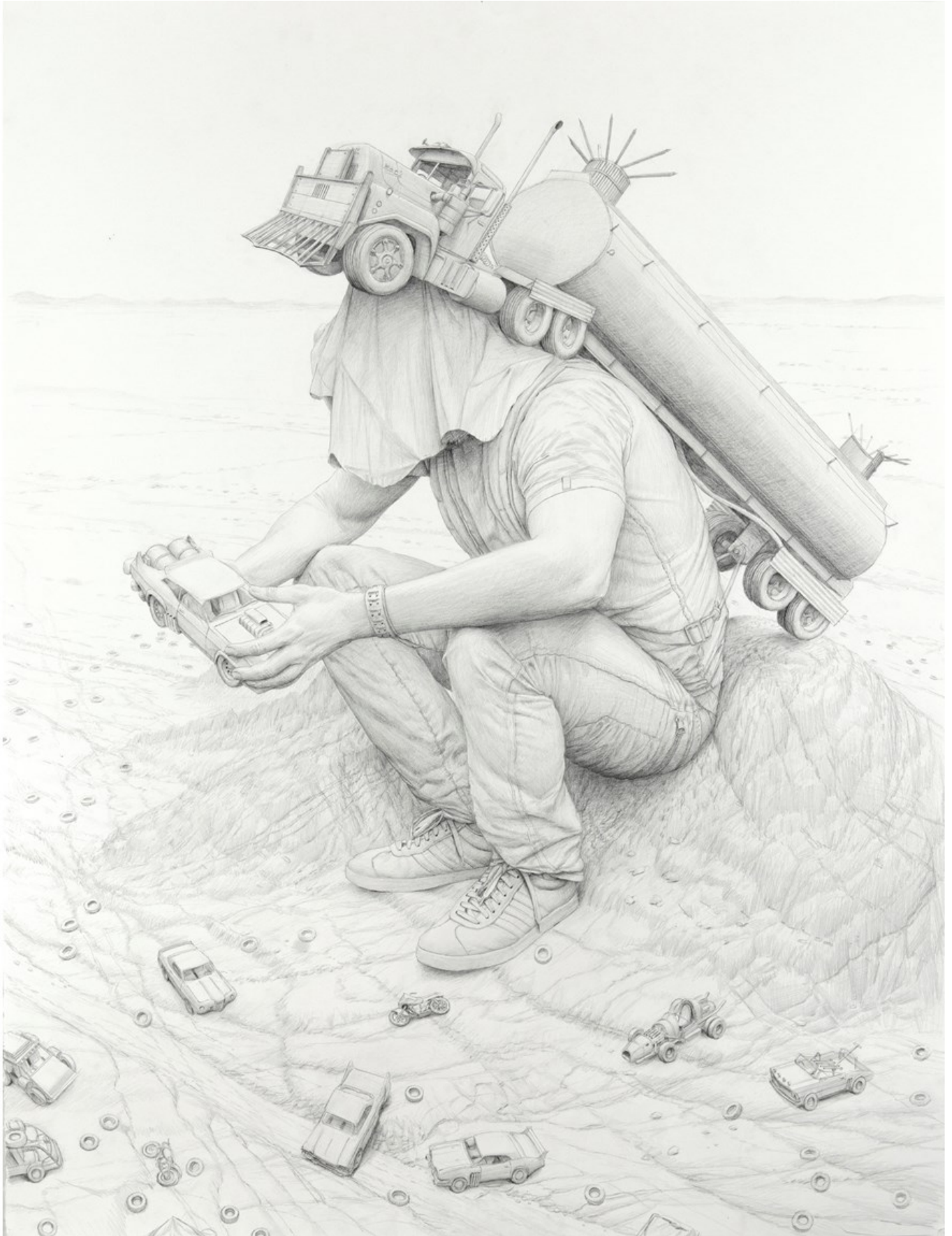
"Here, in this blighted place" 2015, Photogravure on 300 grm Somerset paper., edition of 15 + 3AP, 38 x 30,5 cm, 12 x 15 in

GALLERY POULSEN CONTEMPORARY FINE ARTS - COPENHAGEN