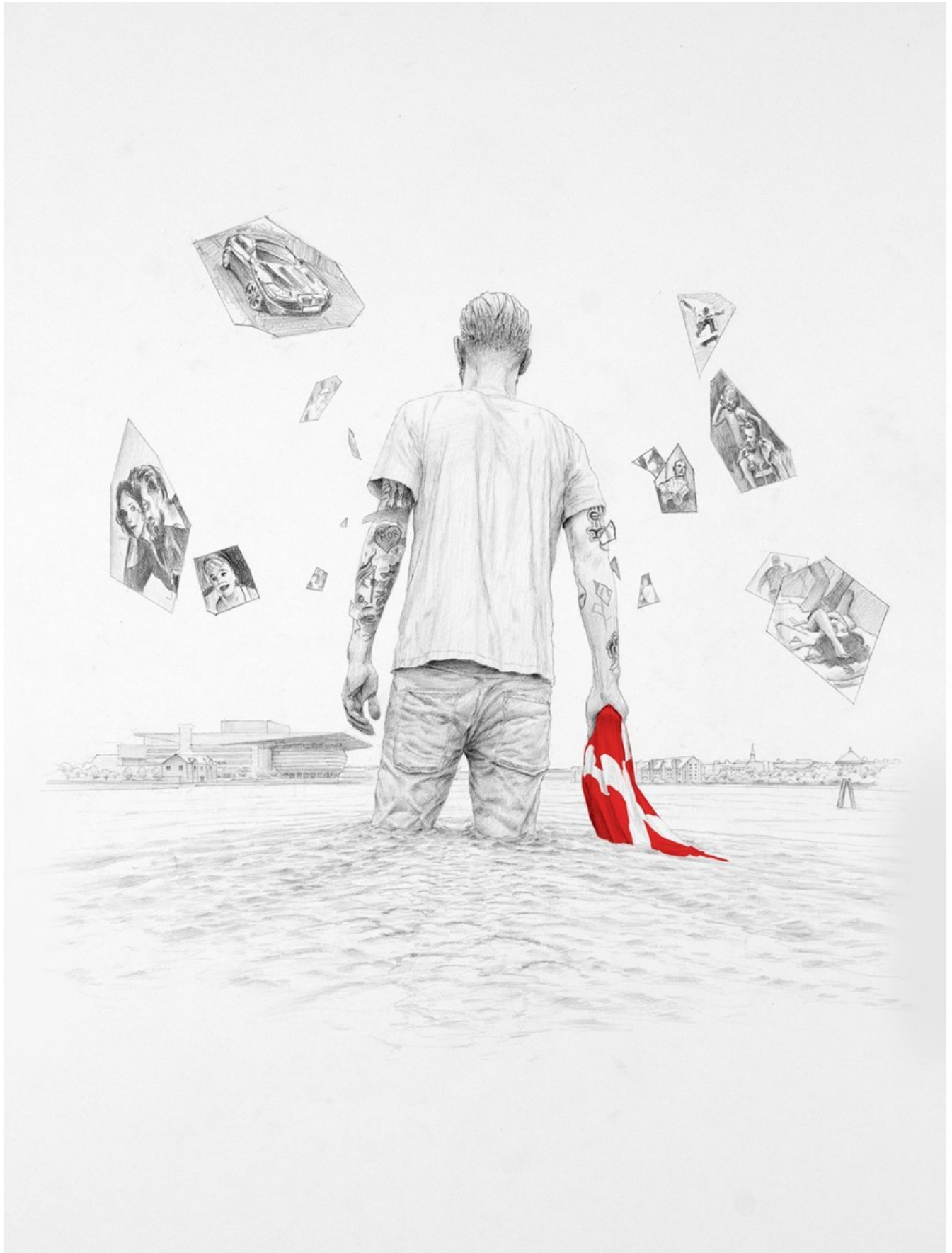
"Untitled Dansker 2" 2014, Silkscreen print two color on Coventry Rag paper., edition of 36 + 4 AP, 61 x 46 cm, 24 x 18 in

GALLERY POULSEN CONTEMPORARY FINE ARTS - COPENHAGEN