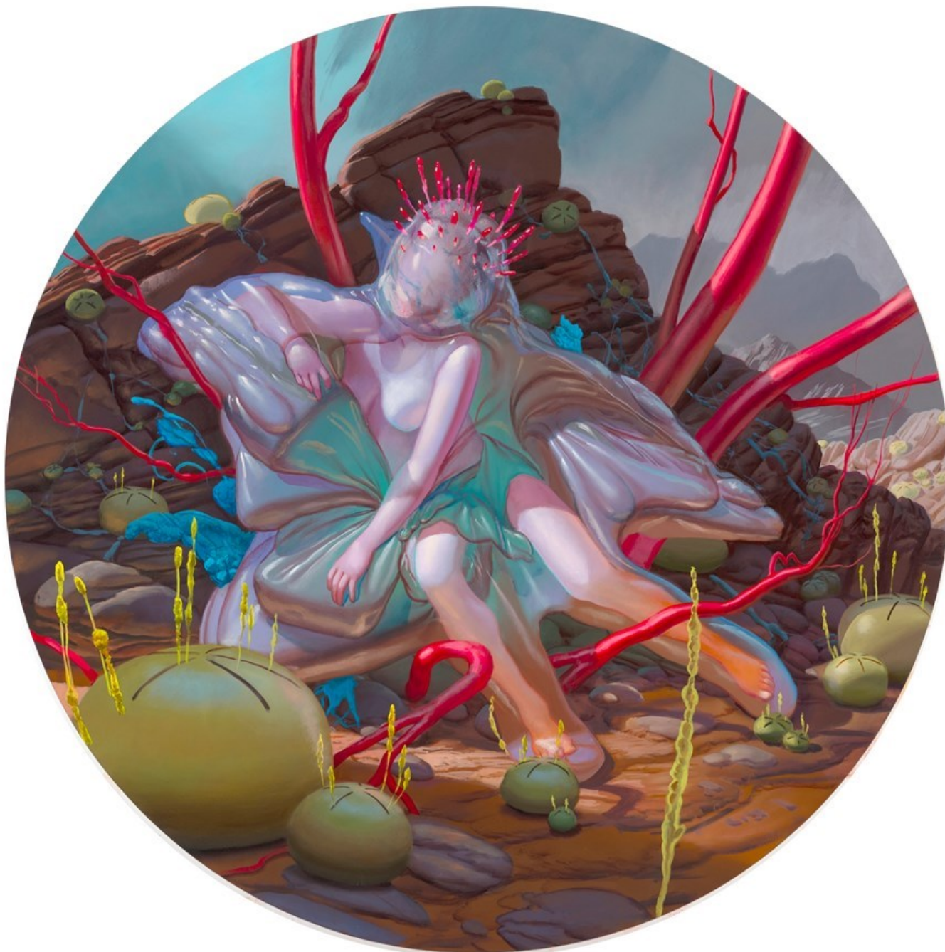
"Dendritic Repose" 2023, Oil on canvas - 91,5 cm, 36 in across, $20,000 (+5% Danish art tax)

GALLERY POULSEN CONTEMPORARY FINE ARTS - COPENHAGEN