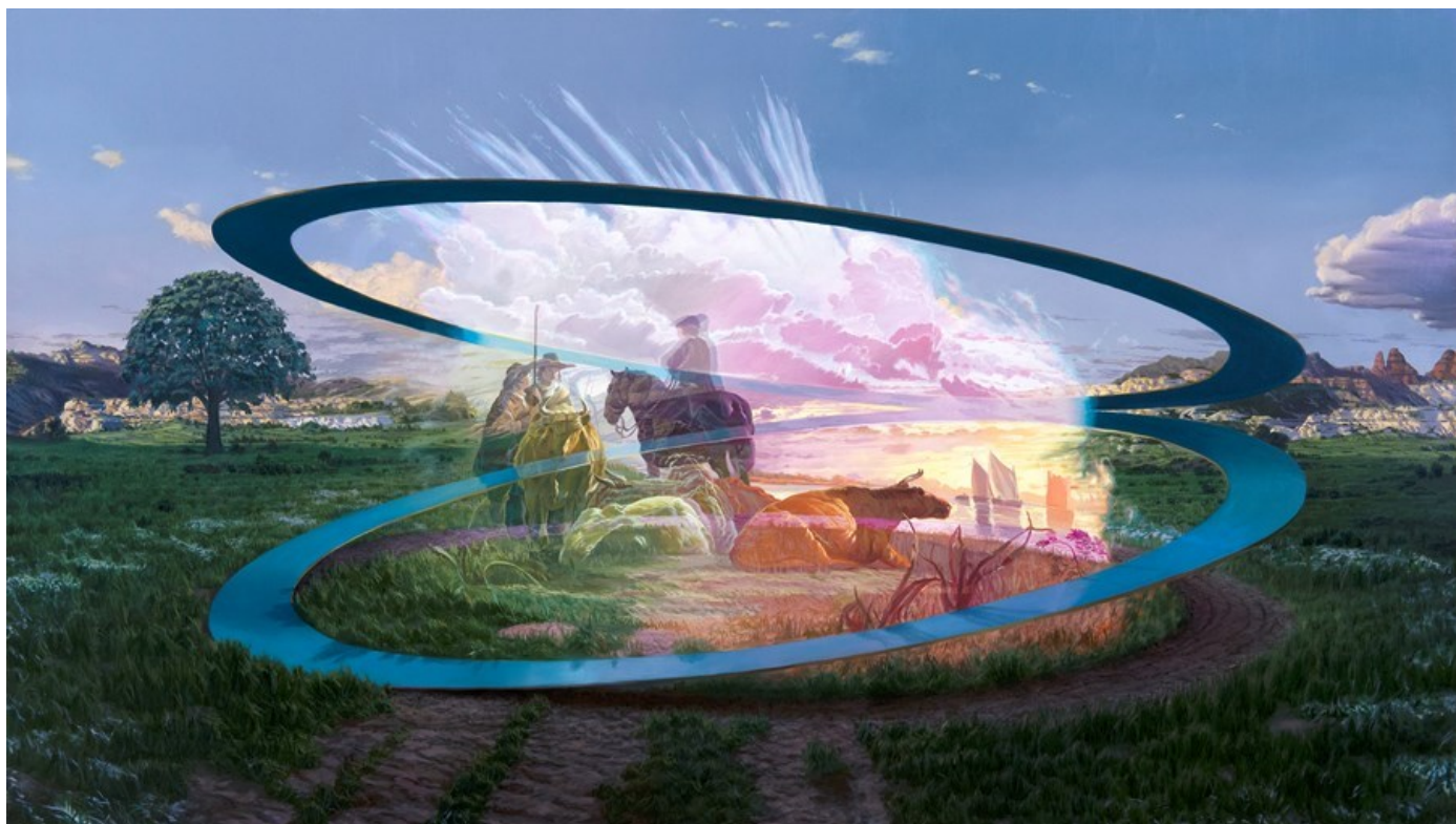
"Bicameral Husbandry" 2019, Oil on linen, 76 x 127 cm, 30 x 53 in

GALLERY POULSEN CONTEMPORARY FINE ARTS - COPENHAGEN