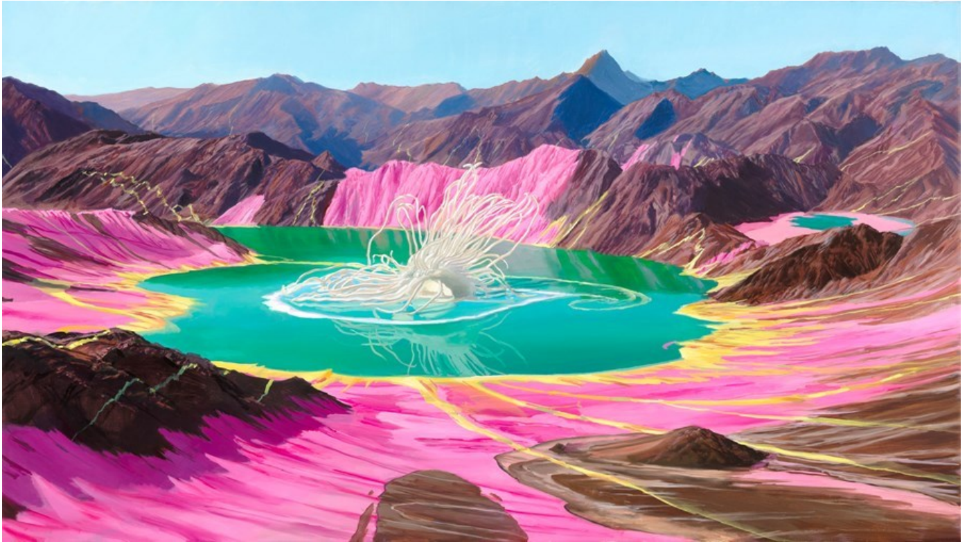
Stay Dim for Long, 2025, Oil on linen, 51 x 91 cm, 20 x 36 in

GALLERY POULSEN CONTEMPORARY FINE ARTS - COPENHAGEN