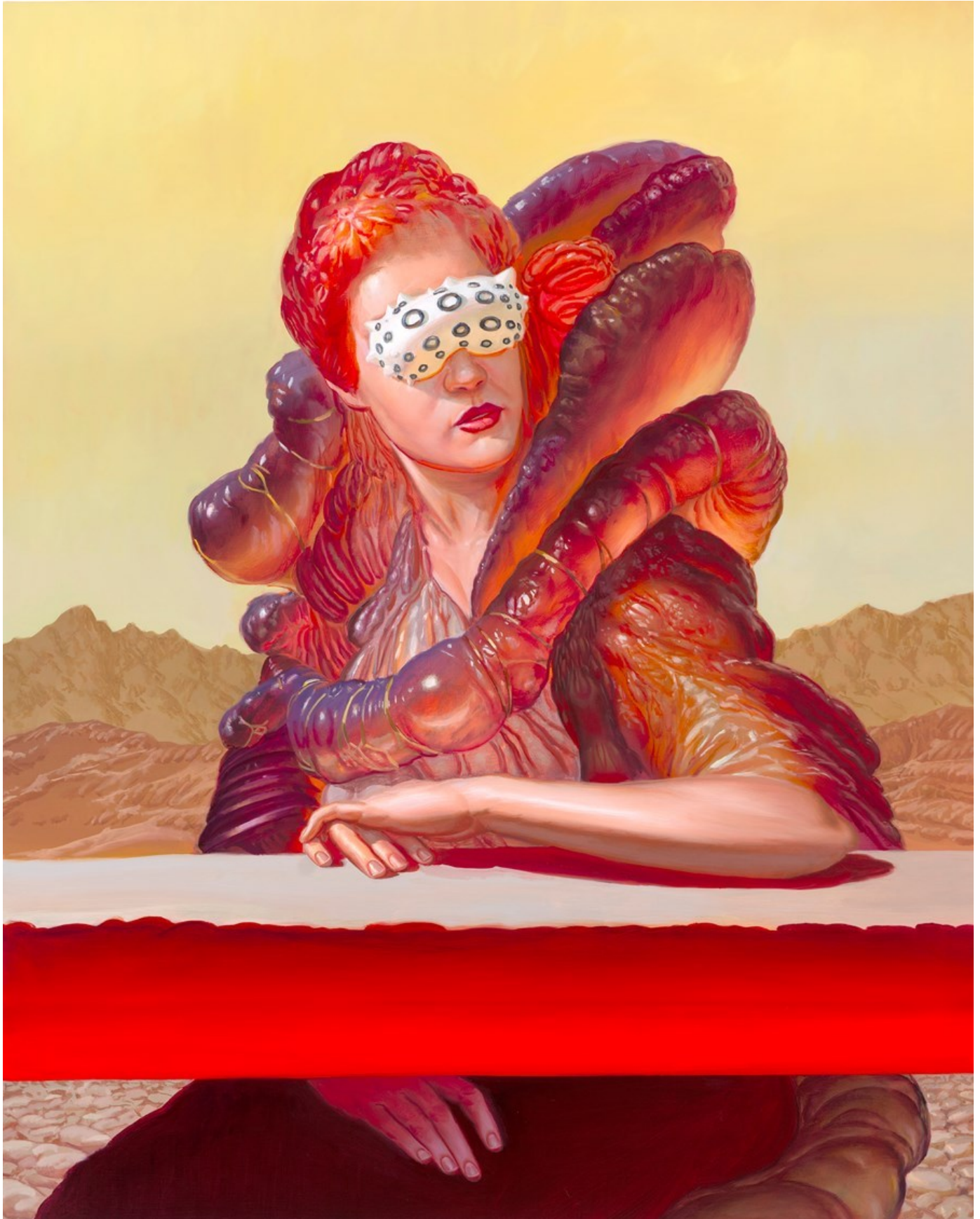
"Curiosity Fire" 2023, Oil on linen - 76 x 61 cm, 30 x 24 in, $15,000 (+5% Danish art tax)

GALLERY POULSEN CONTEMPORARY FINE ARTS - COPENHAGEN