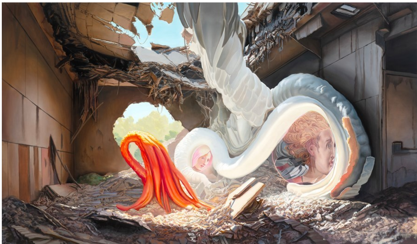
Jean-Pierre Roy "Communication Theory" 2024, Oil on linen, 90 x 155 cm, 35 x 61 in

GALLERY POULSEN CONTEMPORARY FINE ARTS - COPENHAGEN