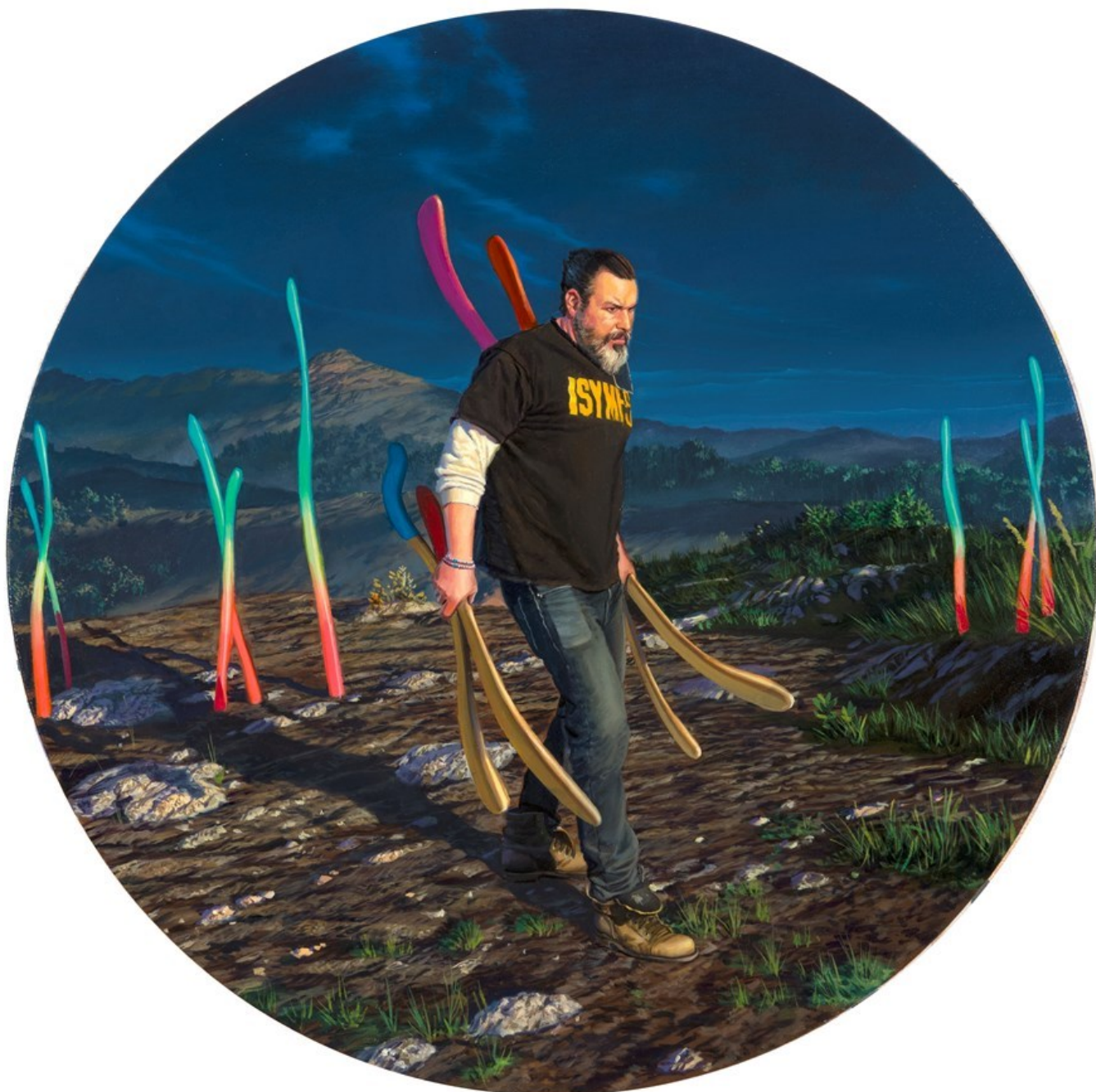
"An Application of Stored Self" 2021., oil on linen, 61 cm diameter, 24 in across

GALLERY POULSEN CONTEMPORARY FINE ARTS - COPENHAGEN