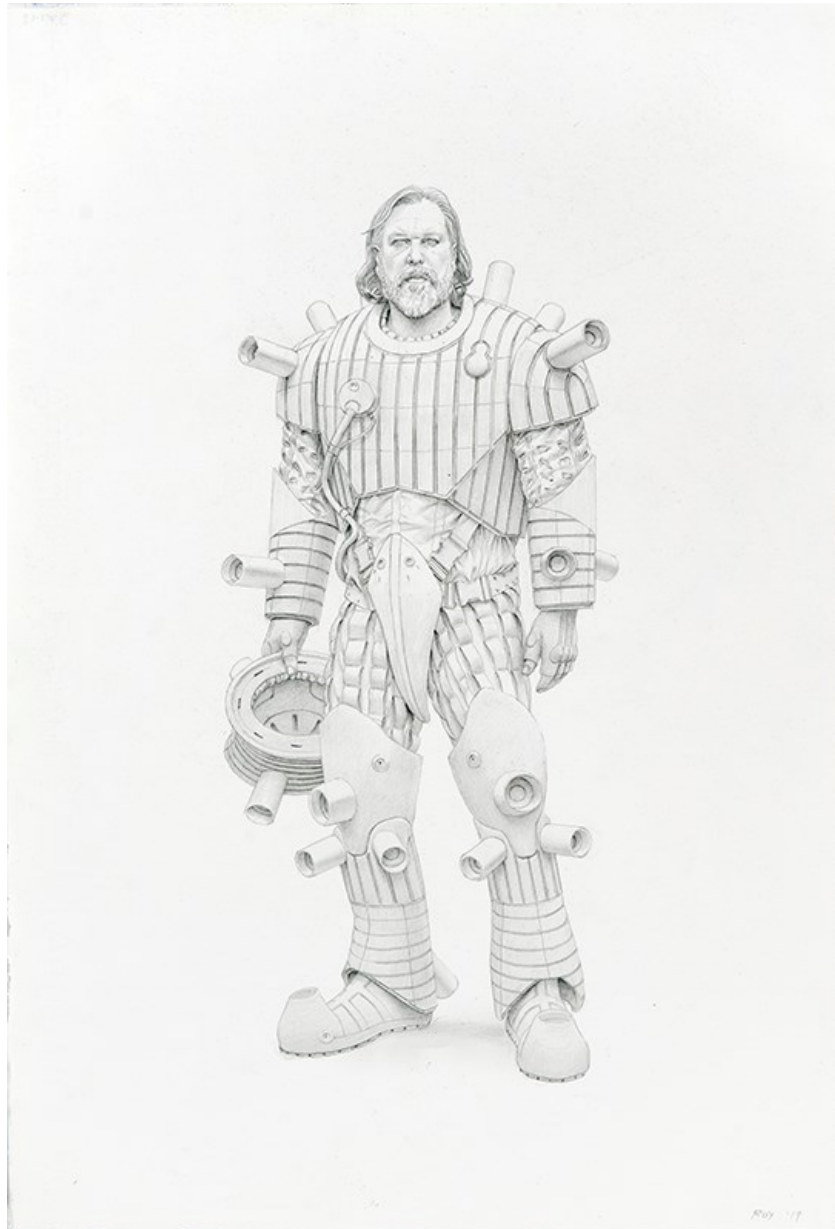
Self portrait in Low-Entropy Object Temporal Dislocation Suit, 2019, graphite on paper, 56 x 38 cm, 22 x 15 in

GALLERY POULSEN CONTEMPORARY FINE ARTS - COPENHAGEN