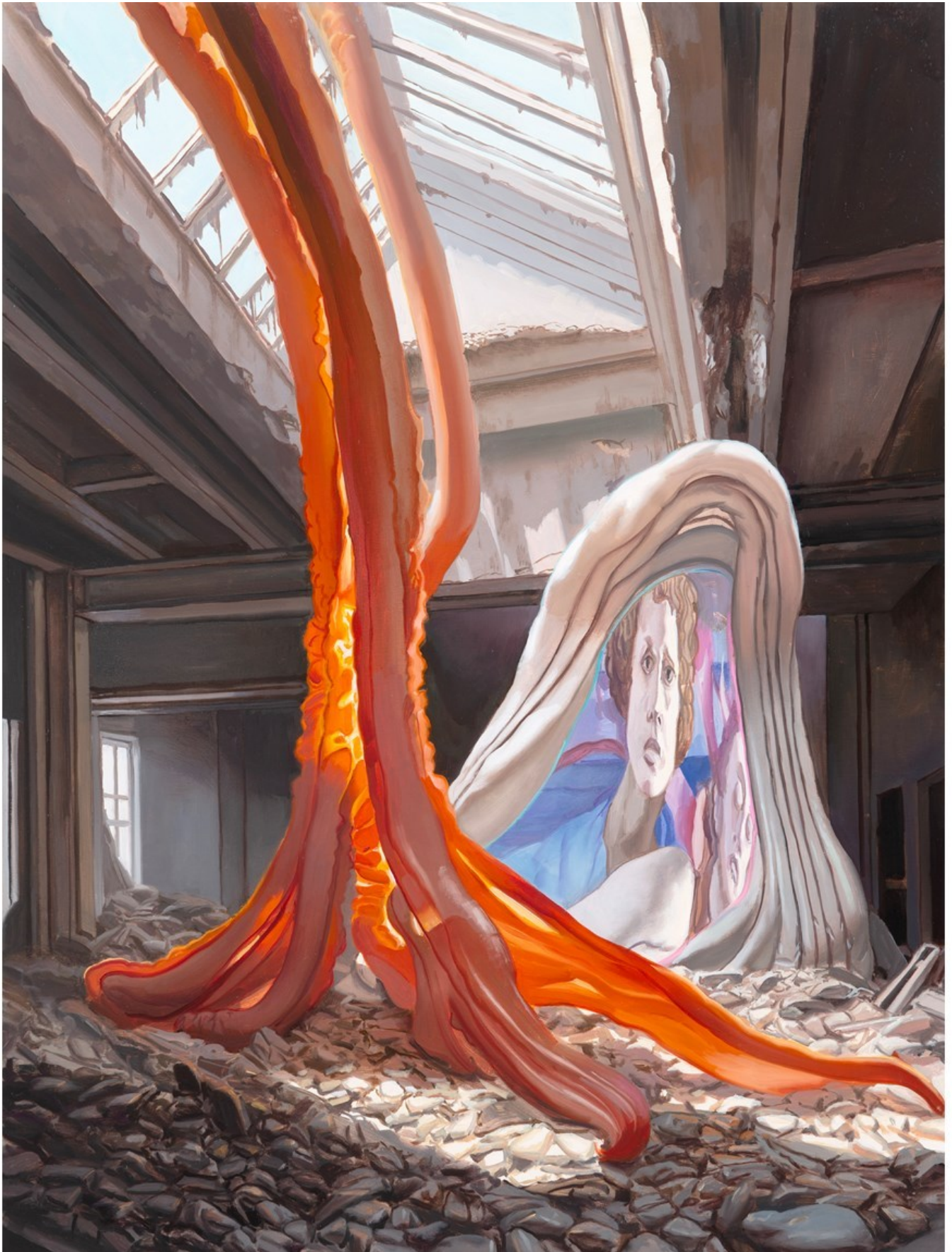
Jean-Pierre Roy "Thrill to Bloom" 2024, Oil on panel, 61 x 46 cm, 24 x 18 in

GALLERY POULSEN CONTEMPORARY FINE ARTS - COPENHAGEN