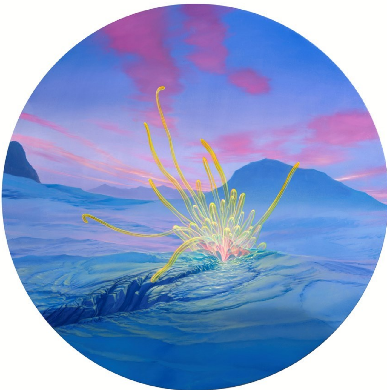
"Laryngospasm" 2021,, oil on linen,, 61 cm diameter, 24 in across

GALLERY POULSEN CONTEMPORARY FINE ARTS - COPENHAGEN