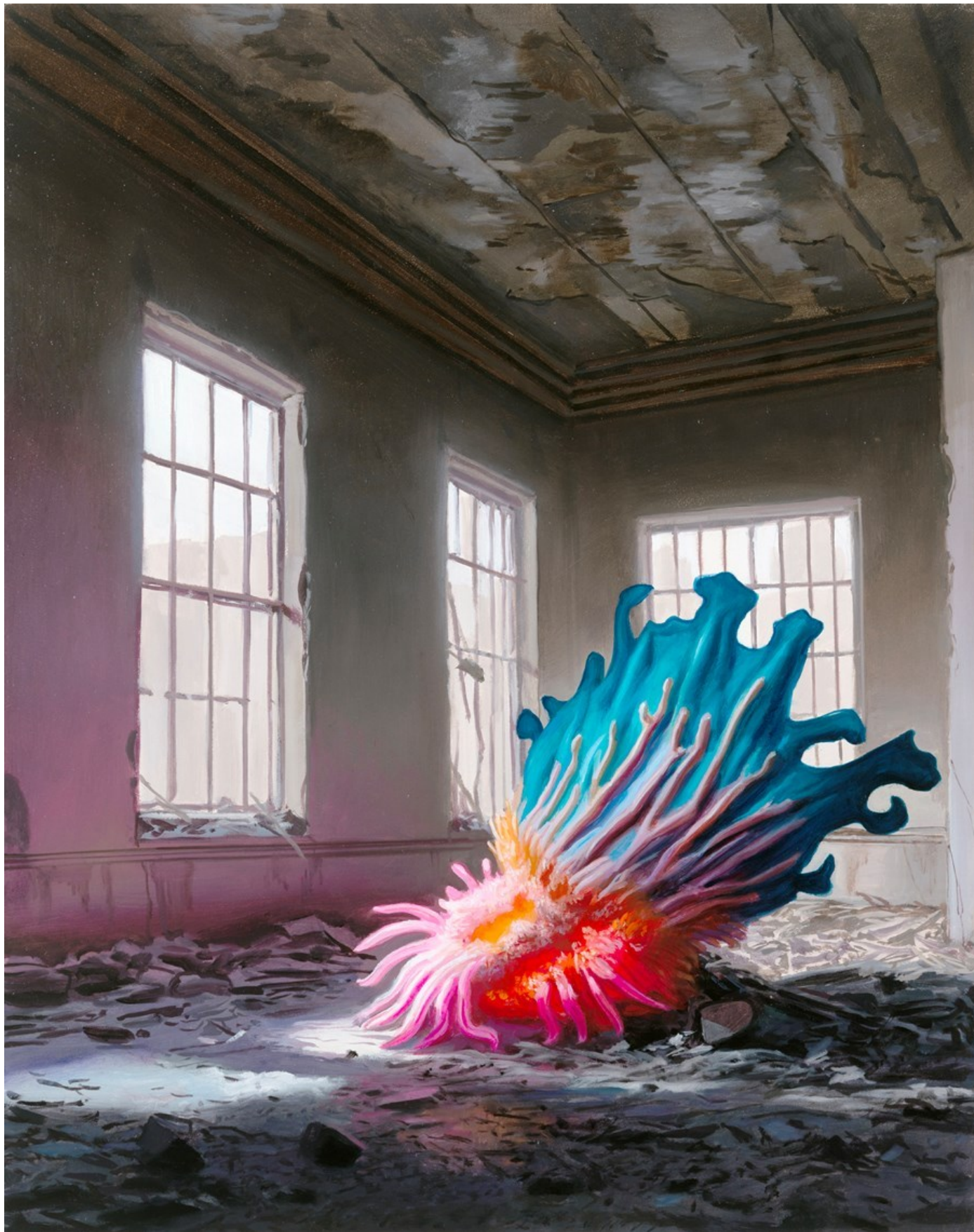
"Mnestic Conquest" 2024, Oil on panel, 36 x 28 cm, 14 x 11 in

GALLERY POULSEN CONTEMPORARY FINE ARTS - COPENHAGEN