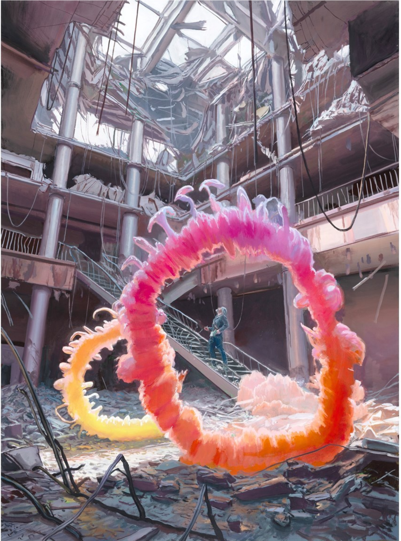
"In Situ" 2025, Oil on linen, 55 x 40 cm, 22 x 16 in

GALLERY POULSEN CONTEMPORARY FINE ARTS - COPENHAGEN