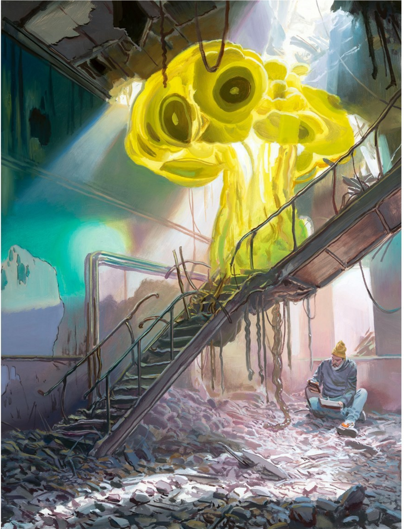
"In Natura", 2025, Oil on linen, 31 x 41 cm, 20 x 16 in

GALLERY POULSEN CONTEMPORARY FINE ARTS - COPENHAGEN