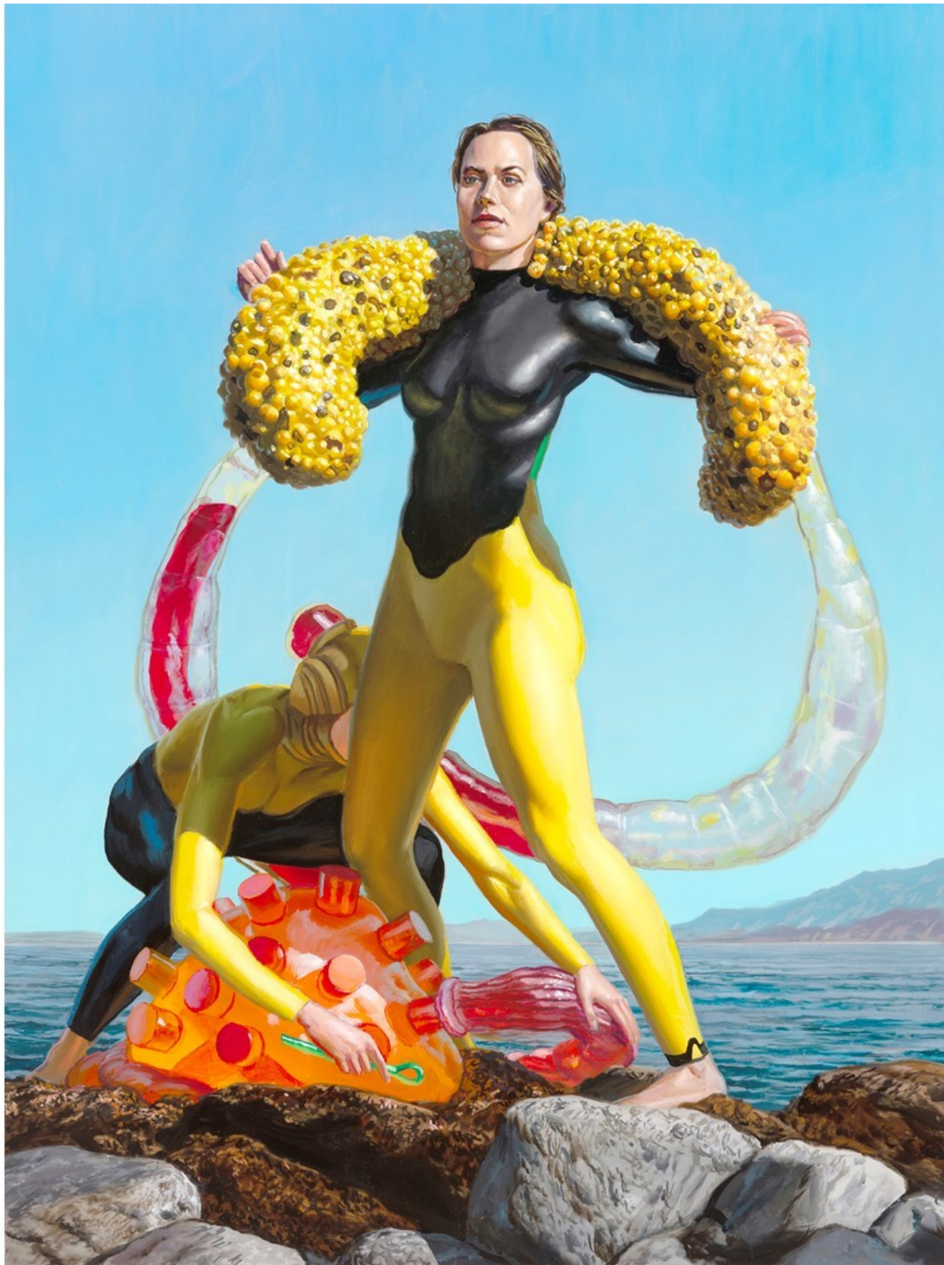
"Host Range" 2023, Oil on panel - 61 x 45,5 cm, 24 x 18 in, $10,000 (+ 5% Danish art tax)

GALLERY POULSEN CONTEMPORARY FINE ARTS - COPENHAGEN