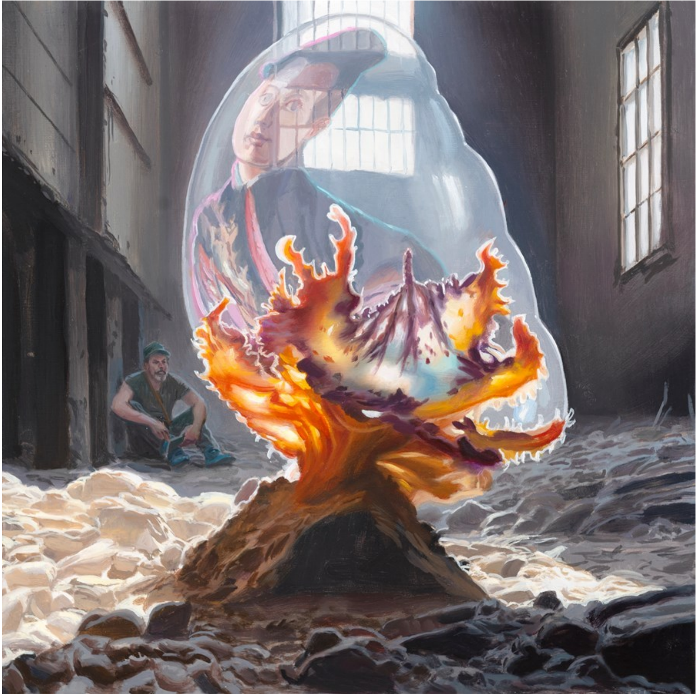
"Bathyscaphe" 2024, Oil on panel, 25 x 25 cm, 10 x 10 in

GALLERY POULSEN CONTEMPORARY FINE ARTS - COPENHAGEN