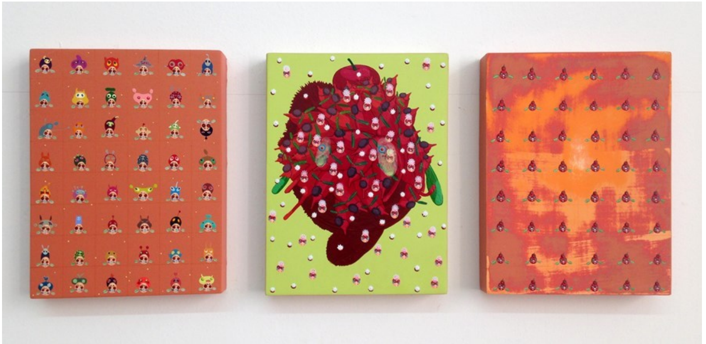
Germs, 2015, Acrylic on panel, 20 x 15 cm, 8 x 6 in each

GALLERY POULSEN CONTEMPORARY FINE ARTS - COPENHAGEN