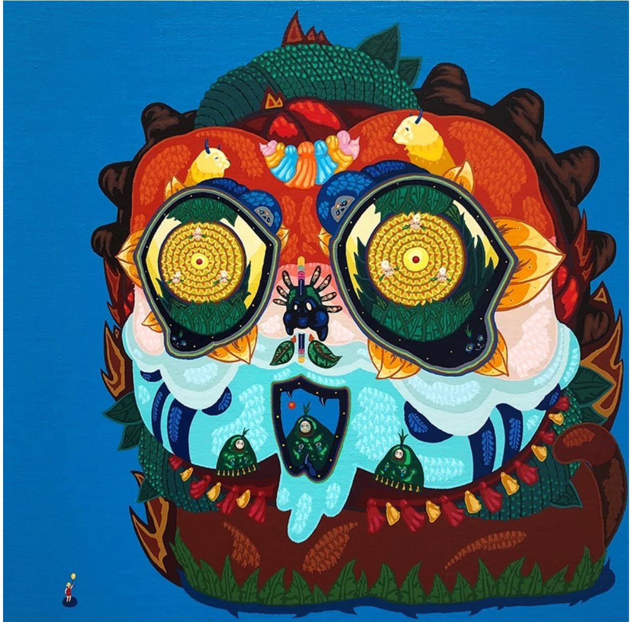
Dandy Lion, 2019, Acrylic on canvas, 46 x 46 cm, 18 x 18 in

GALLERY POULSEN CONTEMPORARY FINE ARTS - COPENHAGEN