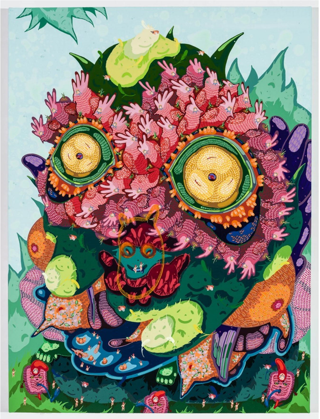
Strawberry Iguana, 2016, Acrylic on linen & thread, 61 x 46 cm, 24 x 18 in