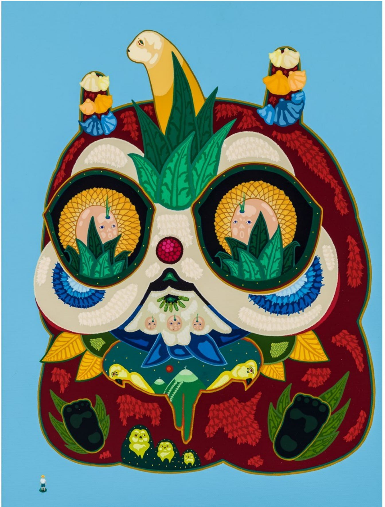
Bigger than You #1, 2018, acrylic on linen, 41 x 30 cm, 16 x 12 in