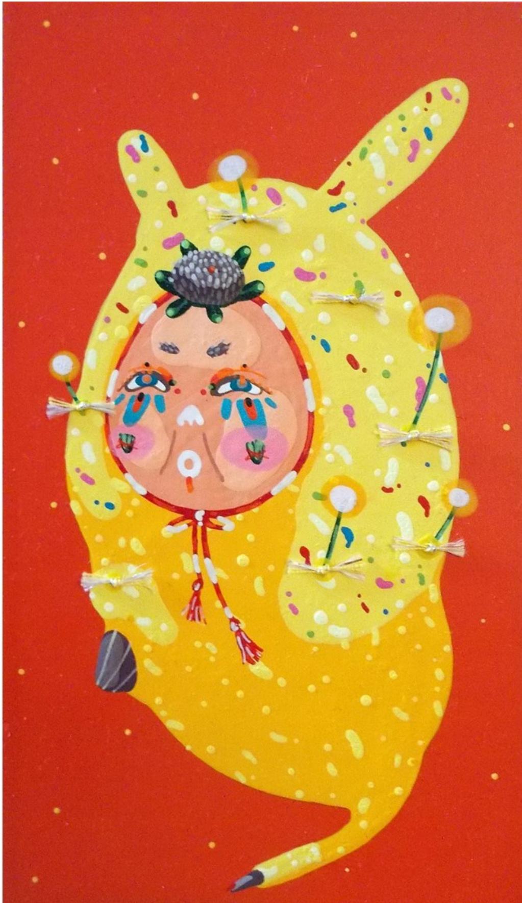
Dust #1, 2016, Acrylic on panel & thread, 13 x 8 cm, 5 x 3 in

GALLERY POULSEN CONTEMPORARY FINE ARTS - COPENHAGEN