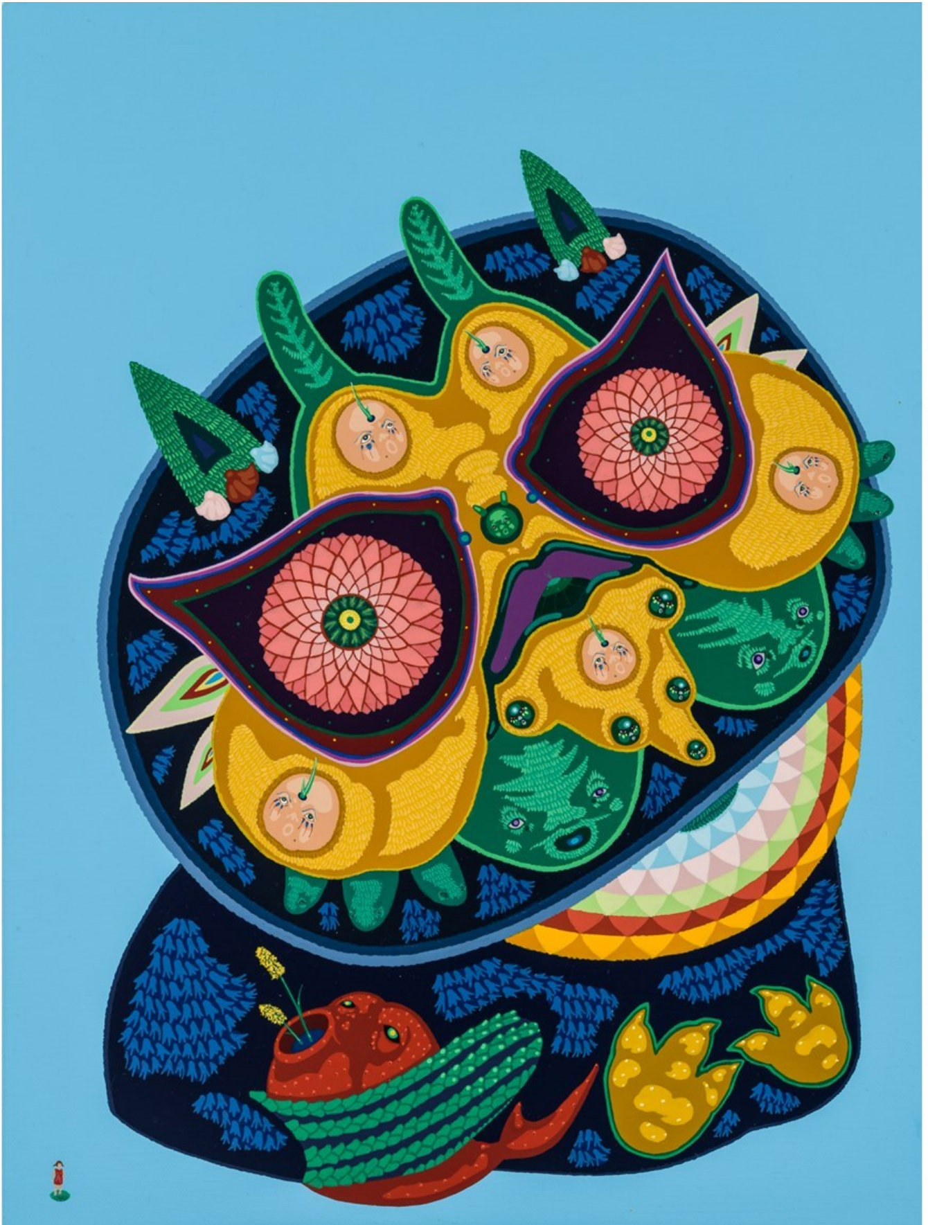
Bigger than You #2, 2018, acrylic on linen, 41 x 30 cm, 16 x 12 in

GALLERY POULSEN CONTEMPORARY FINE ARTS - COPENHAGEN