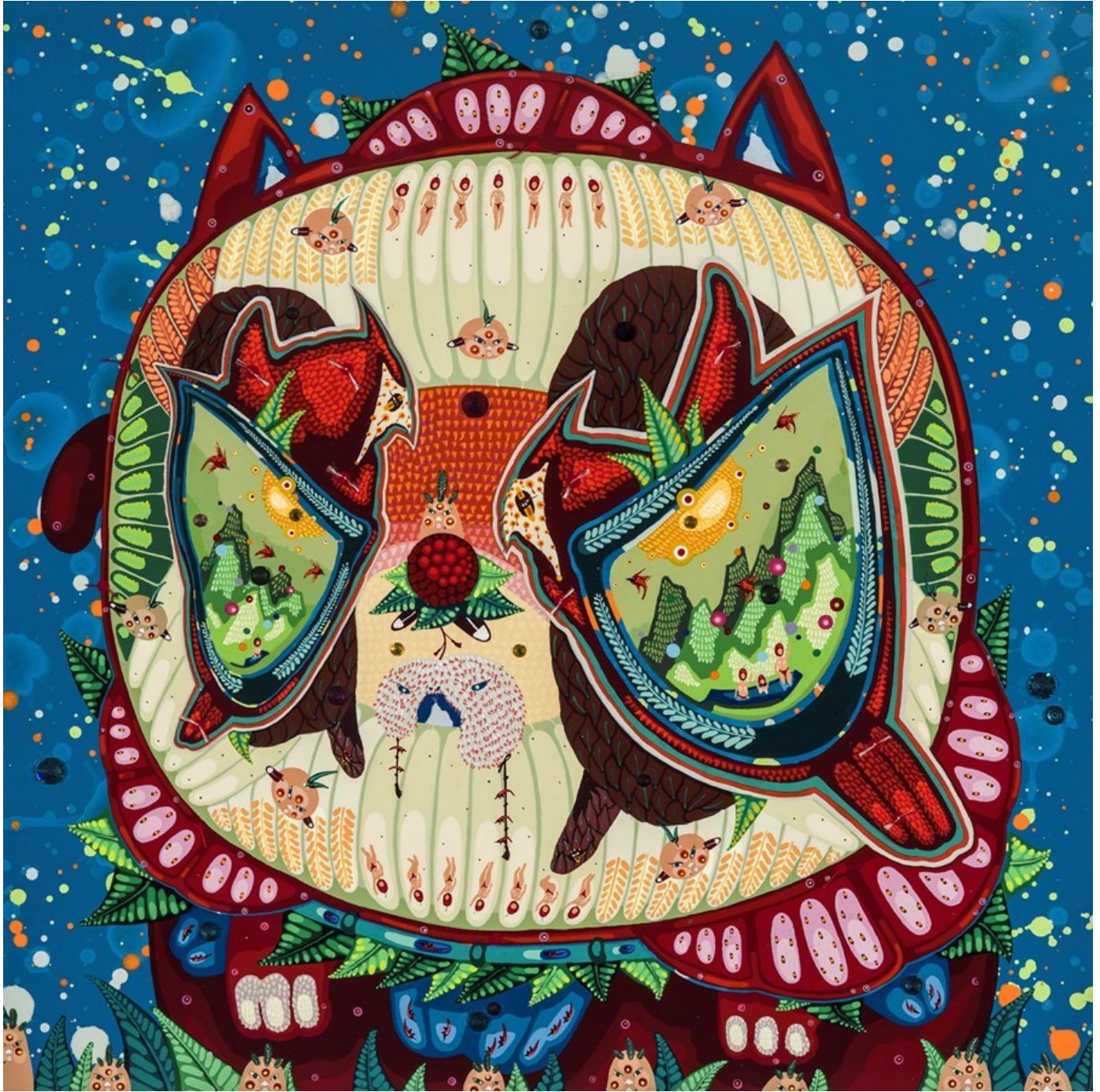
Cherry Pop, 2017, Acrylic, thread, crystal on panel, 25 x 25 cm, 10 x 10 in

GALLERY POULSEN CONTEMPORARY FINE ARTS - COPENHAGEN