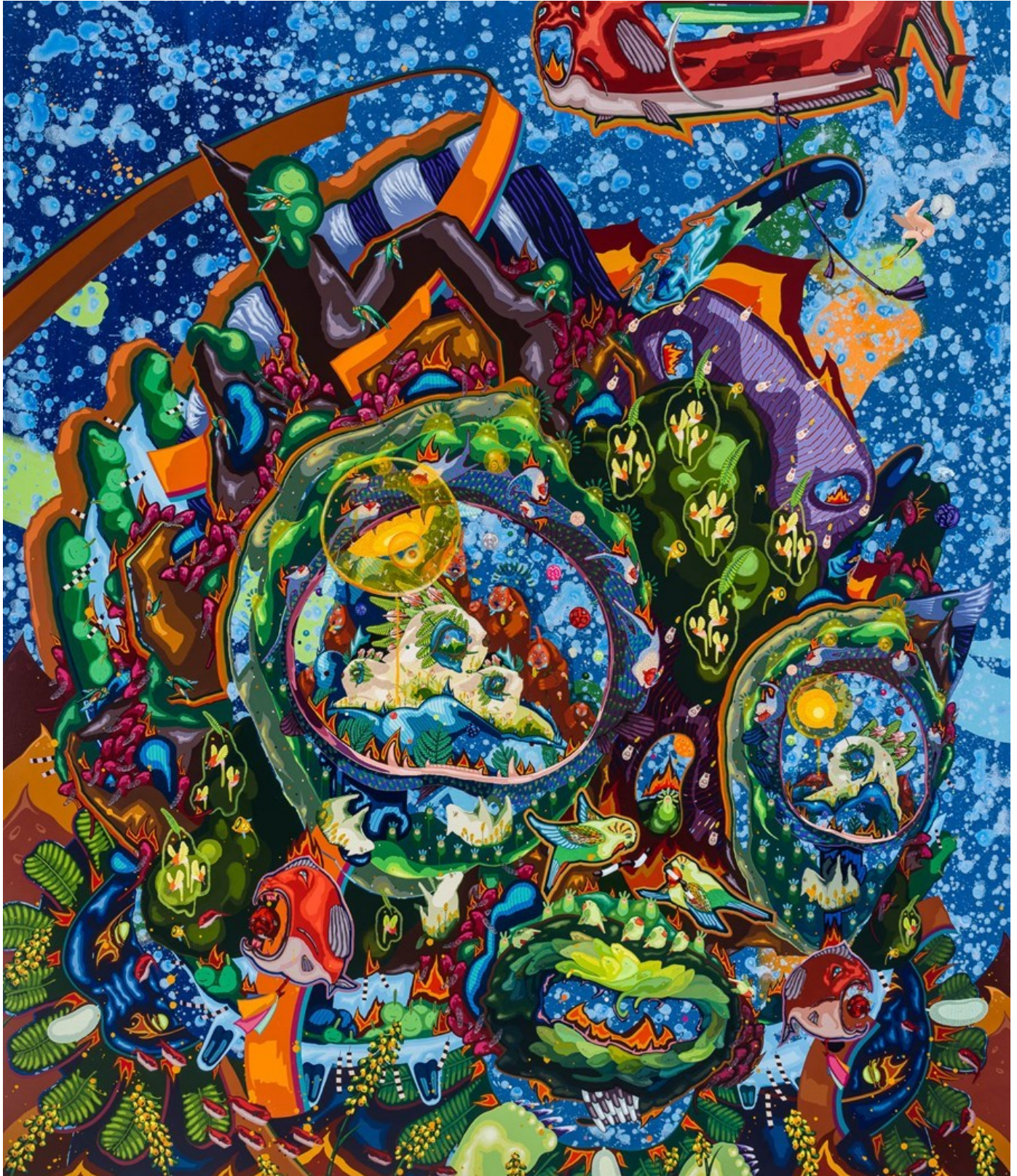
Coral Sea, 2017, Acrylic on canvas and cut-out paper, 178 x 152 cm, 70 x 60 in

GALLERY POULSEN CONTEMPORARY FINE ARTS - COPENHAGEN