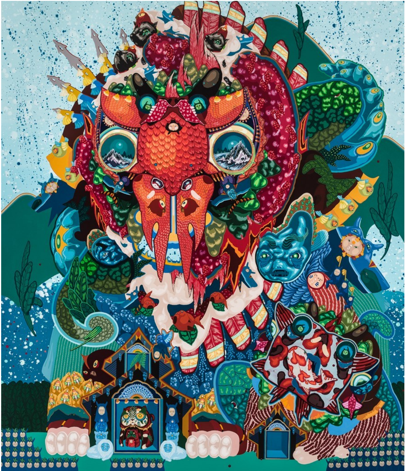
Sea Farm, 2018, acrylic on canvas, 178 x 152 cm, 70 x 60 in

GALLERY POULSEN CONTEMPORARY FINE ARTS - COPENHAGEN