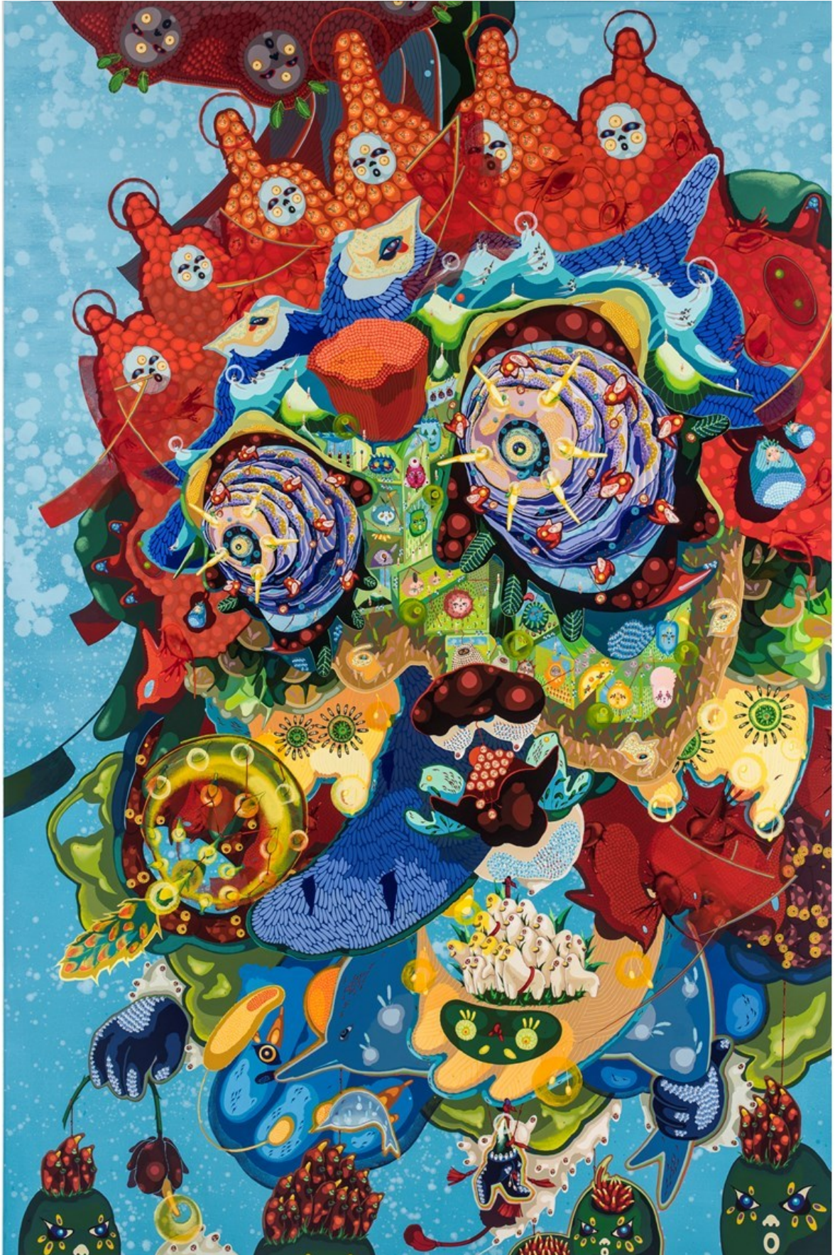
Sleepwalker, 2017, Acrylic on canvas and cut paper, 183 x 122 cm, 72 x 48 in

GALLERY POULSEN CONTEMPORARY FINE ARTS - COPENHAGEN