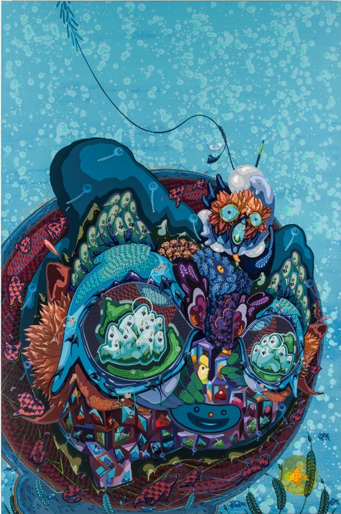
Fishing Dreams, 2017, Acrylic on canvas and cut paper, 183 x 122 cm, 72 x 48 in

GALLERY POULSEN CONTEMPORARY FINE ARTS - COPENHAGEN