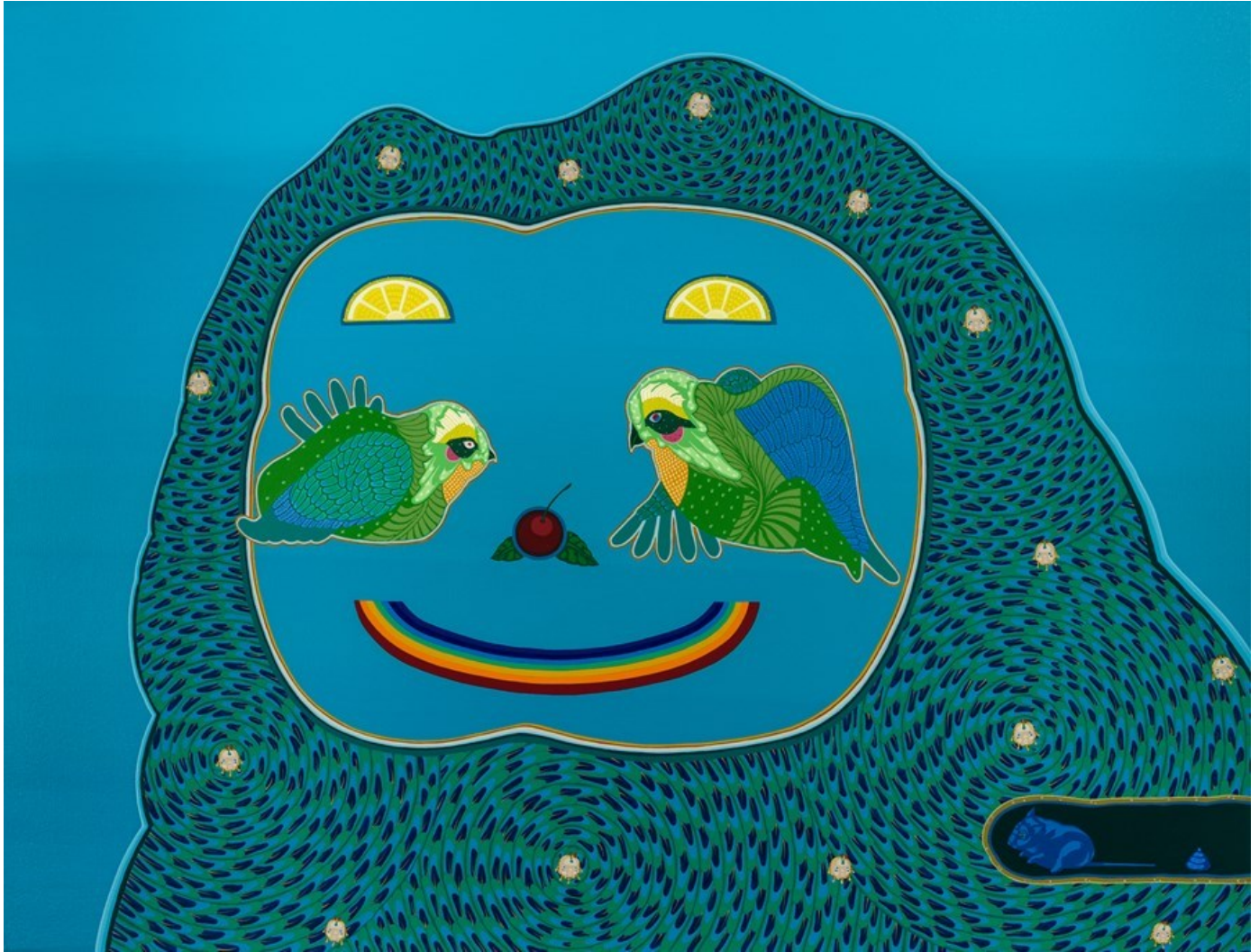
Birds on the Border, 2018, acrylic on canvas, 81 x 107 cm, 32 x 42 in

GALLERY POULSEN CONTEMPORARY FINE ARTS - COPENHAGEN