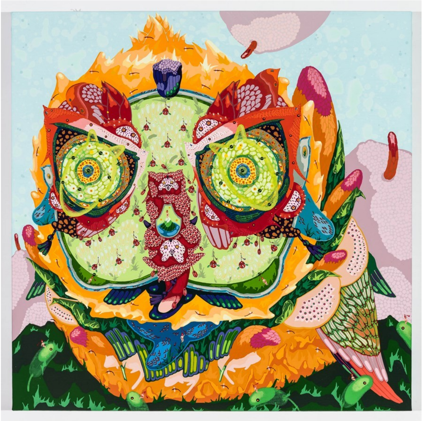
Horned Melon, 2016, Acrylic on linen & thread, 51 x 51 cm, 20 x 20 in

GALLERY POULSEN CONTEMPORARY FINE ARTS - COPENHAGEN