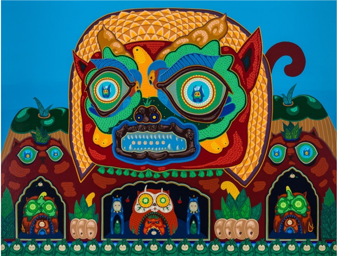
Fun House, 2018, acrylic on canvas, 81 x 107 cm, 32 x 42 in

GALLERY POULSEN CONTEMPORARY FINE ARTS - COPENHAGEN