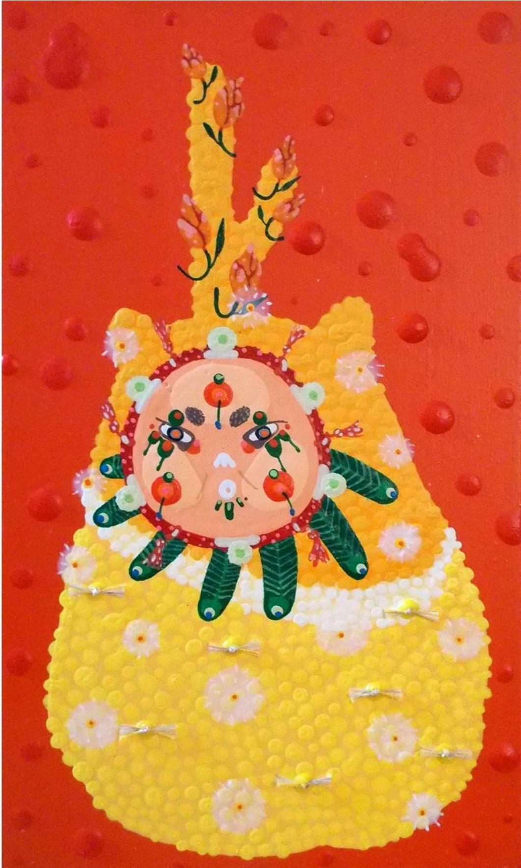
Dust #2, 2016, Acrylic on panel & thread, 13 x 8 cm, 5 x 3 in

GALLERY POULSEN CONTEMPORARY FINE ARTS - COPENHAGEN