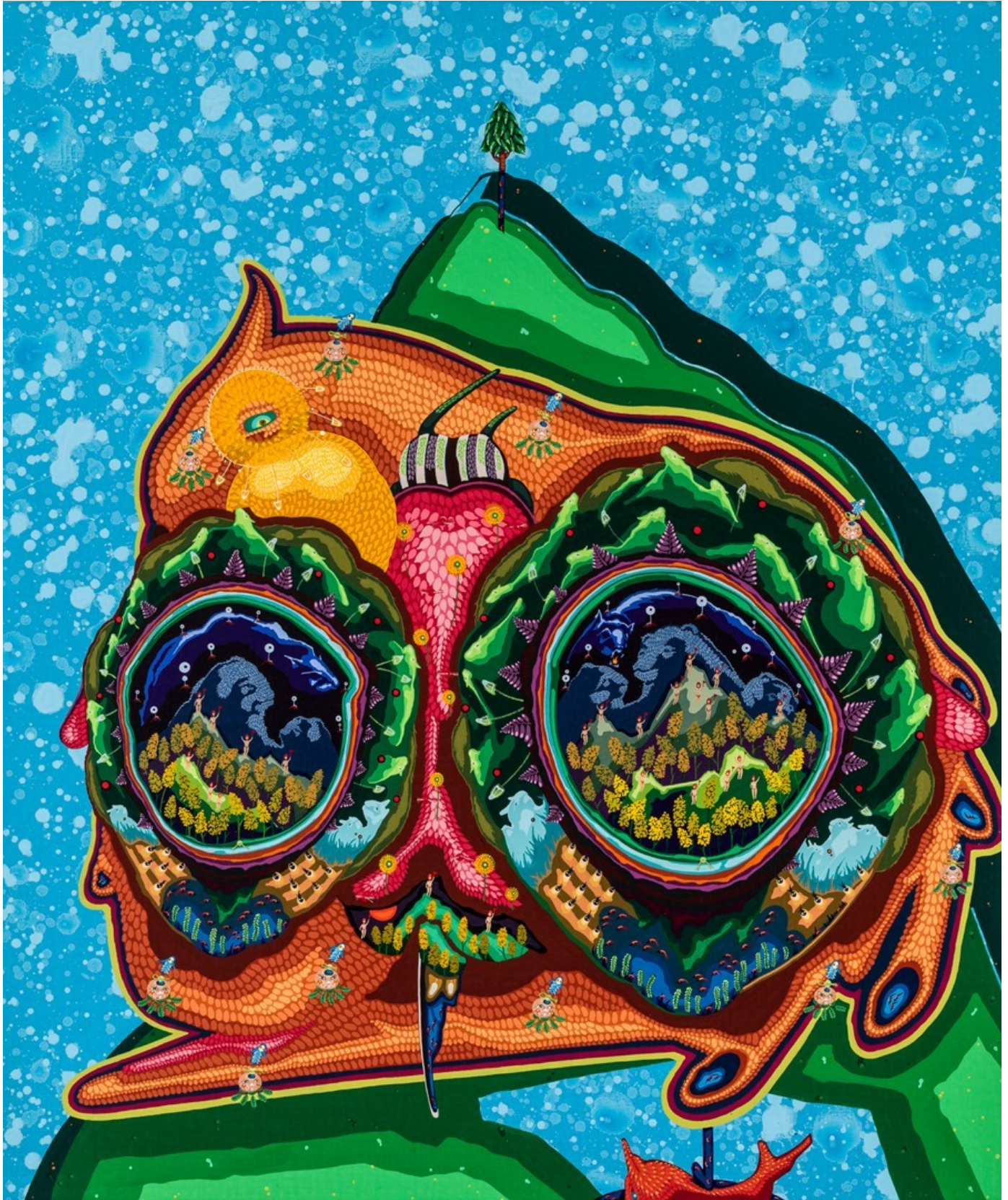
Bird of Paradise, 2017, acrylic on linen, thread, crystal, 61 x 51 cm, 24 x 20 in

GALLERY POULSEN CONTEMPORARY FINE ARTS - COPENHAGEN