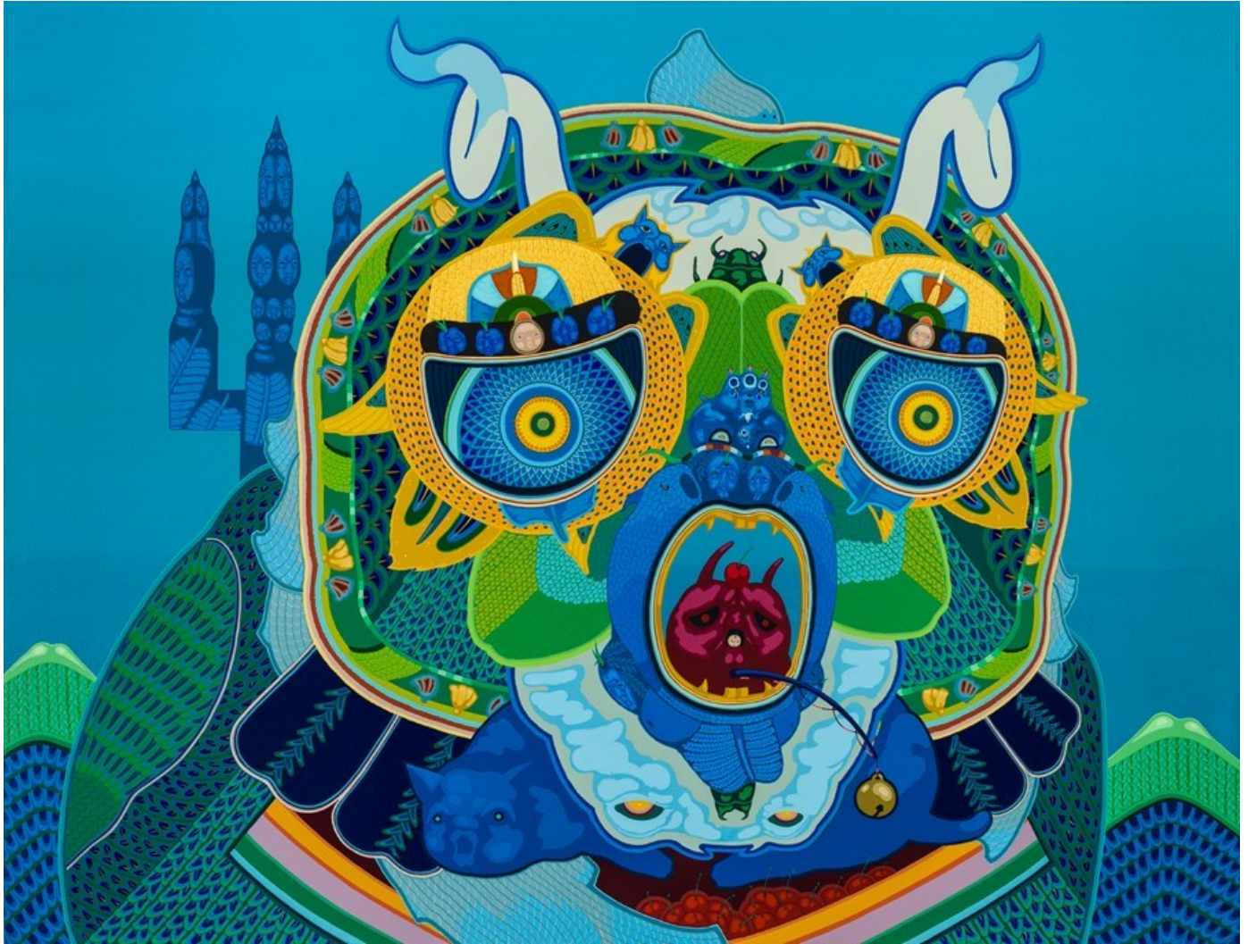
Peacock Tiger, 2018, acrylic on canvas, 81 x 107 cm, 32 x 42 in

GALLERY POULSEN CONTEMPORARY FINE ARTS - COPENHAGEN