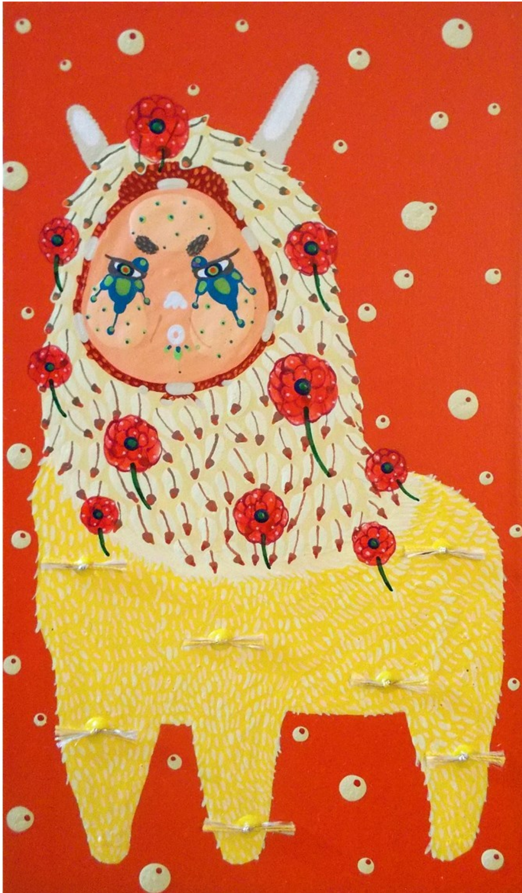
Dust #3, 2016, Acrylic on panel & thread, 13 x 8 cm, 5 x 3 in

GALLERY POULSEN CONTEMPORARY FINE ARTS - COPENHAGEN