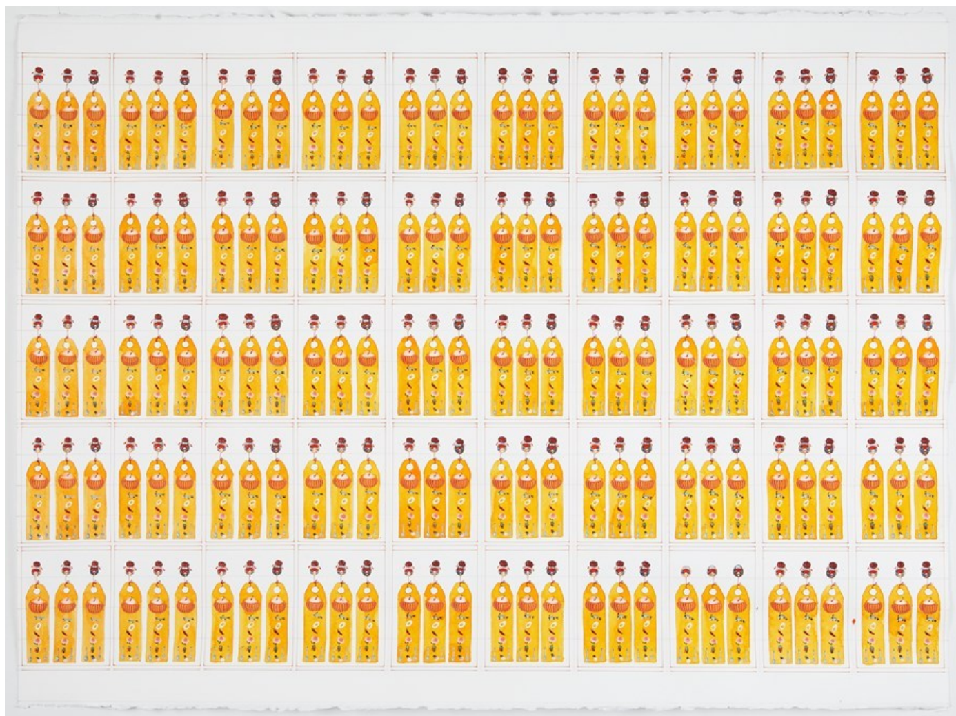
Dinner, 2014, Acrylic paint, water color, pen, and pencil on arches, 55 x 76 cm, 21.7 x 29.9 in

GALLERY POULSEN CONTEMPORARY FINE ARTS - COPENHAGEN