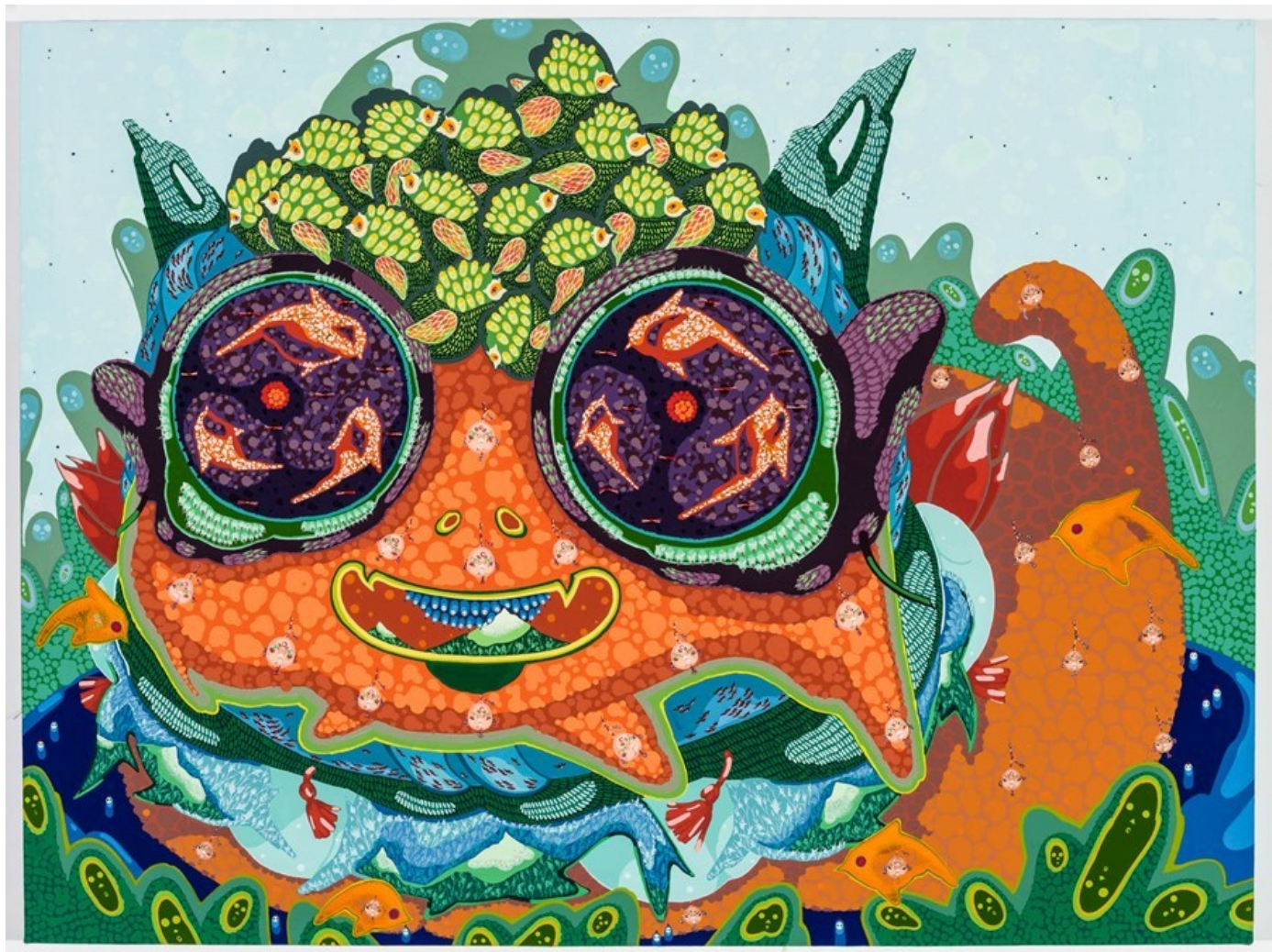
Orange Cat, 2016, Acrylic on linen & thread, 46 x 61 cm, 18 x 24 in

GALLERY POULSEN CONTEMPORARY FINE ARTS - COPENHAGEN