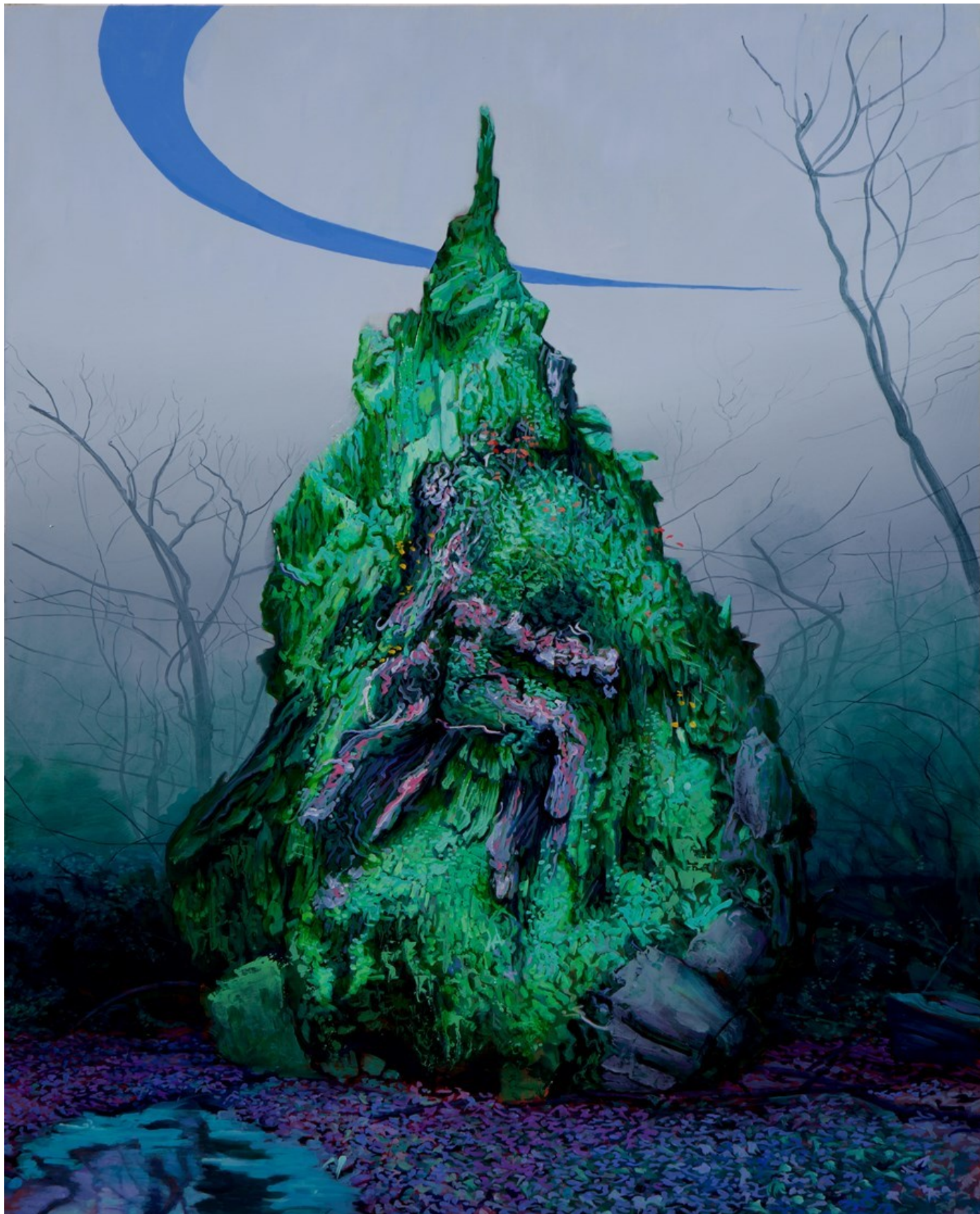
"Naked Nest" 2024, Oil on panel, 76 x 61 cm, 30 x 24 in

GALLERY POULSEN CONTEMPORARY FINE ARTS - COPENHAGEN