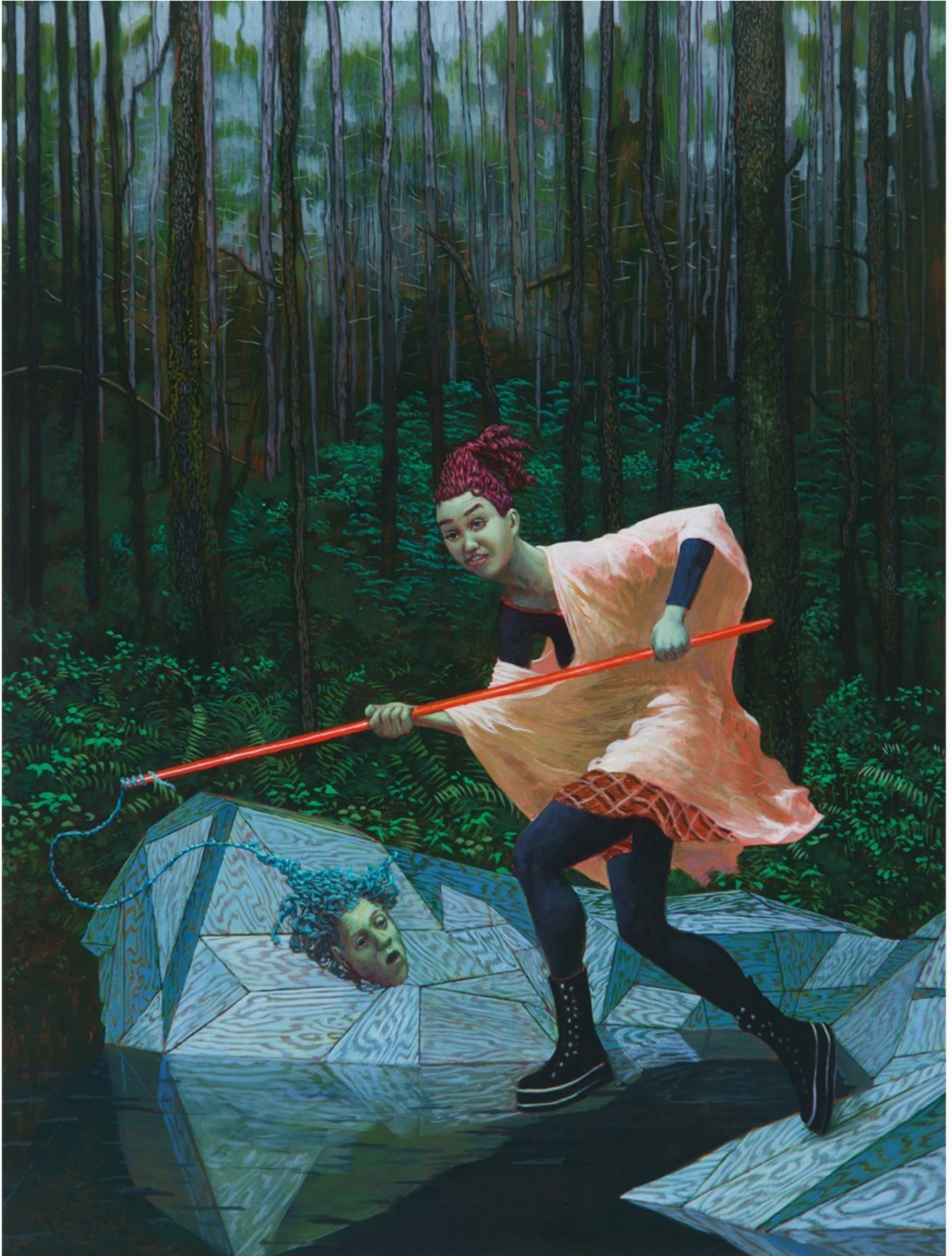
"Regathering" 2024, Oil on panel, 61 x 46 cm, 24 x 18 in

GALLERY POULSEN CONTEMPORARY FINE ARTS - COPENHAGEN