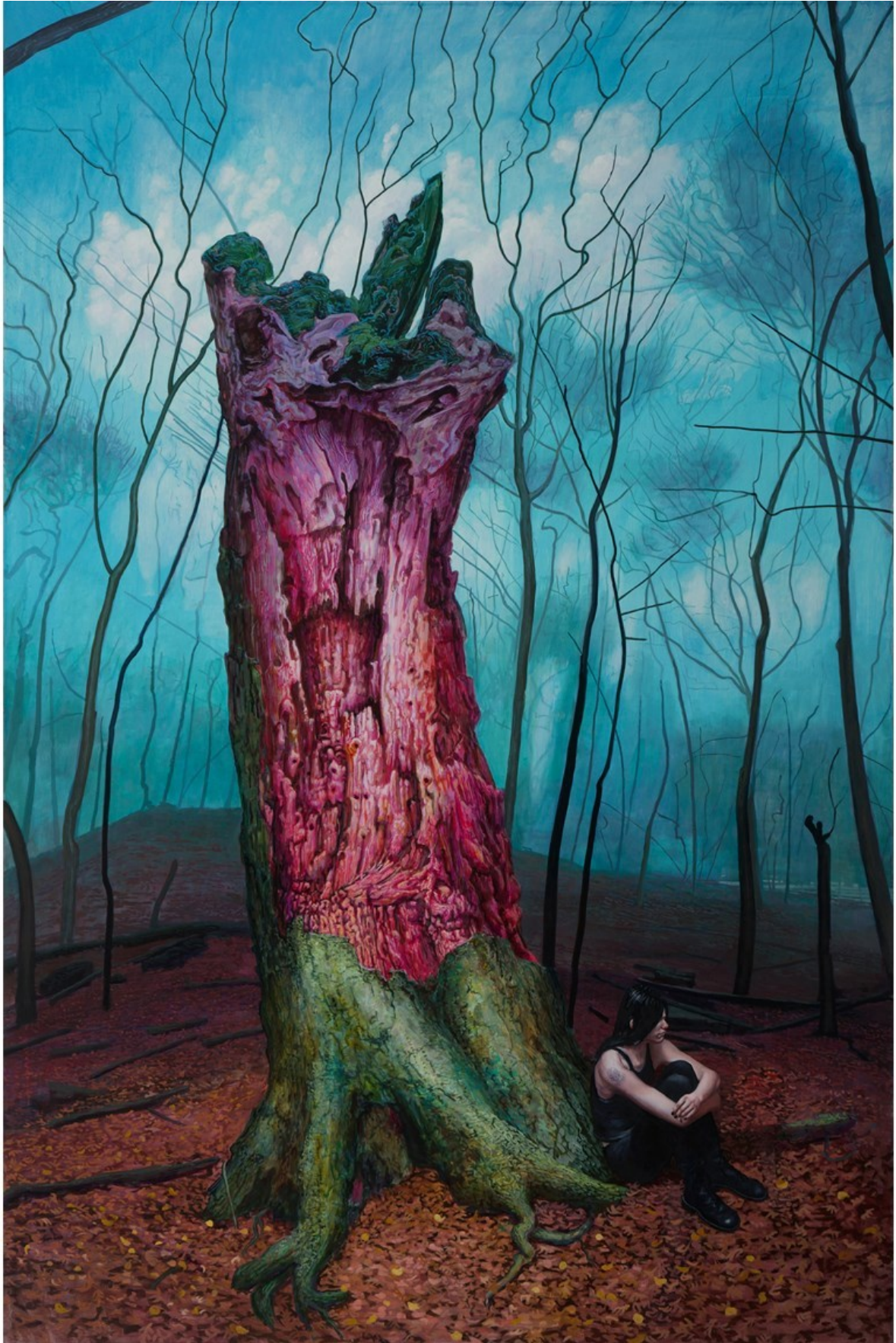
"Starfish" 2022, Oil on linen, 152,5 x 101,5 cm, 60 x 40 in

GALLERY POULSEN CONTEMPORARY FINE ARTS - COPENHAGEN