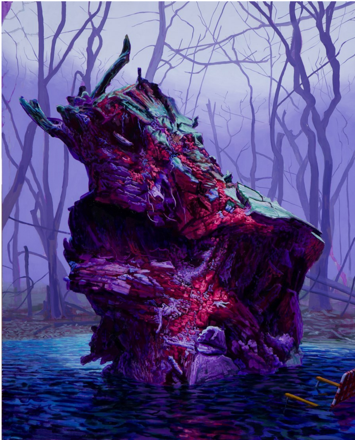
"Pound of Obscure" 2024, Oil on panel, 76 x 61 cm, 30 x 24 in

GALLERY POULSEN CONTEMPORARY FINE ARTS - COPENHAGEN