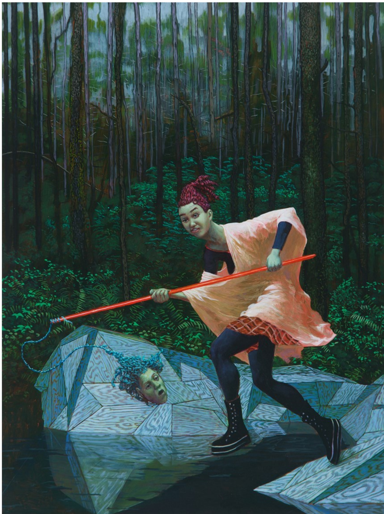
"Regathering" 2024, Oil on panel, 61 x 46 cm, 24 x 18 in

GALLERY POULSEN CONTEMPORARY FINE ARTS - COPENHAGEN