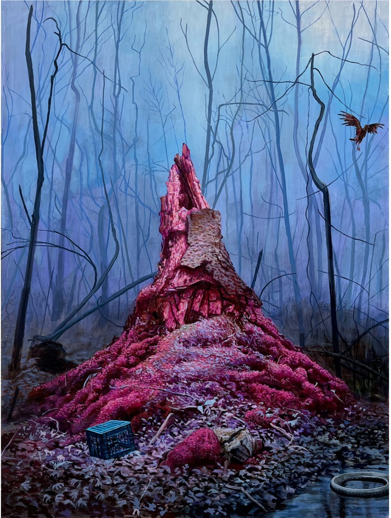
"Disentombed" 2023, Oil on panel - 61 x 45,5 cm, 24 x 18 in, $6,000 (+5% Danish art tax)

GALLERY POULSEN CONTEMPORARY FINE ARTS - COPENHAGEN