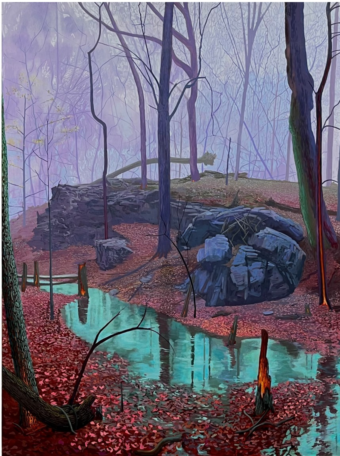
"Ghost Wood" 2022, Oil on linen, 122 x 91,5 cm, 48 x 36 in

GALLERY POULSEN CONTEMPORARY FINE ARTS - COPENHAGEN