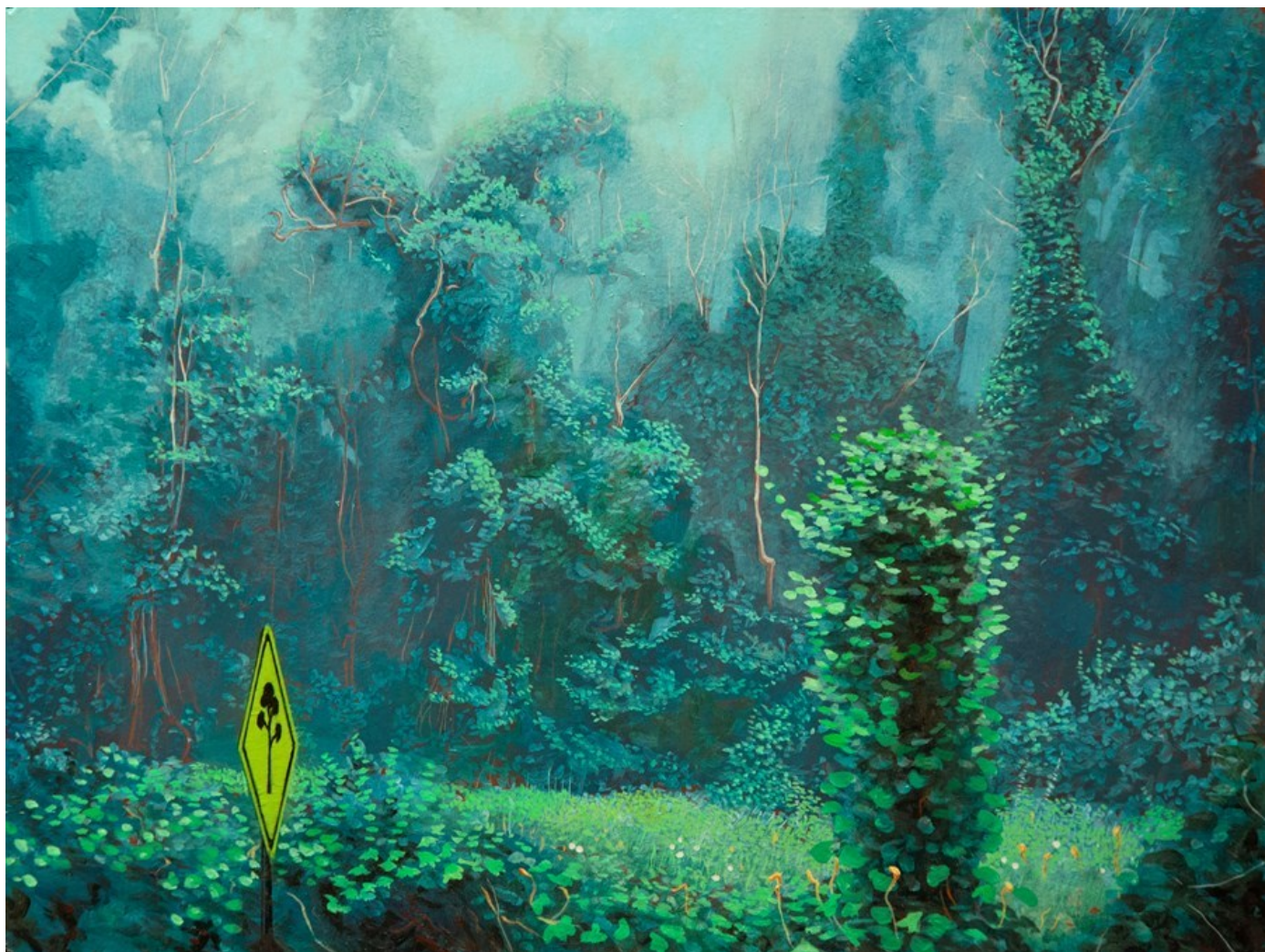
"Angry Trees" 2020, Oil on linen, 30,5 x 40,5 cm, 12 x 16 in

GALLERY POULSEN CONTEMPORARY FINE ARTS - COPENHAGEN