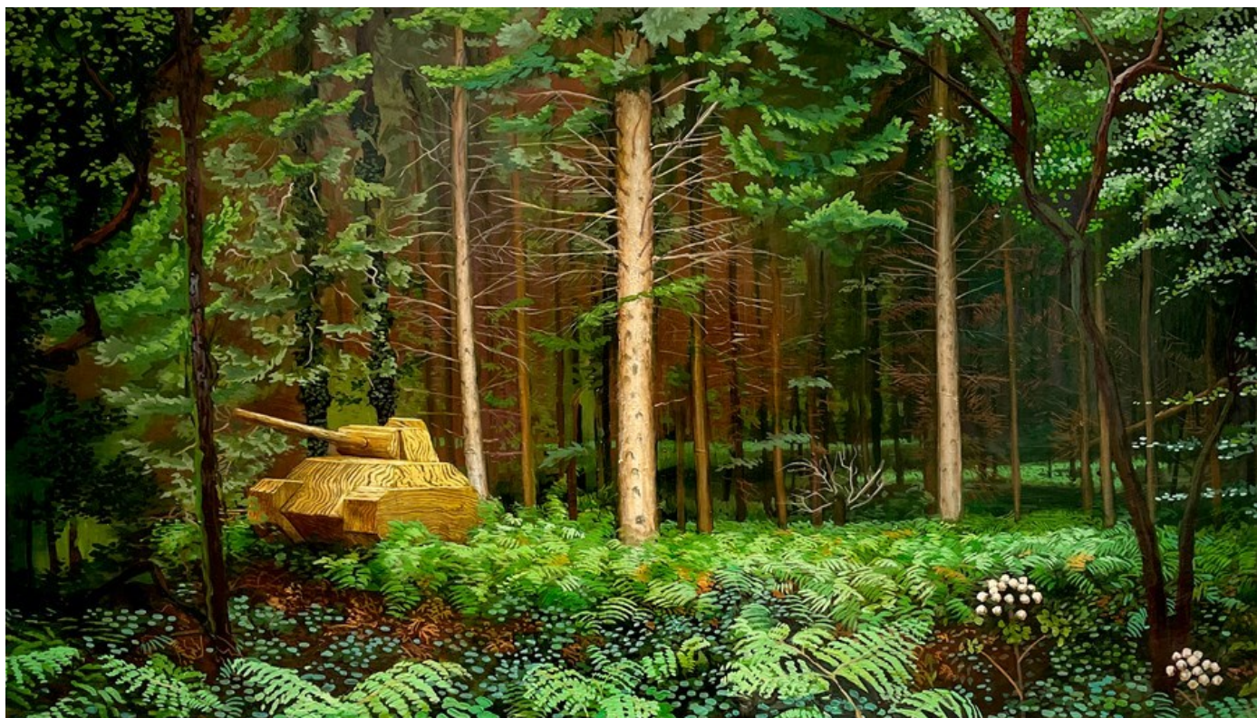
"Tick Tank" 2009, Oil on linen, 51,5 x 91 cm, 20 x 36 in

GALLERY POULSEN CONTEMPORARY FINE ARTS - COPENHAGEN