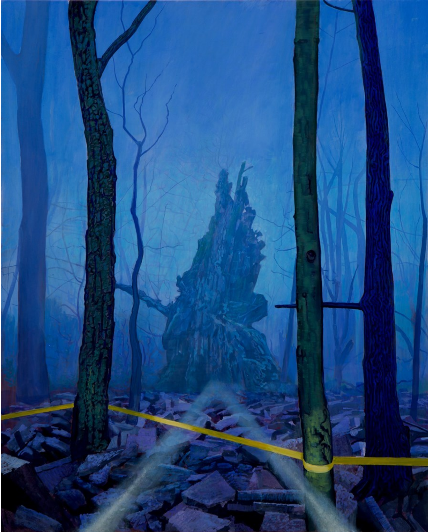
"Great Old One" 2024, Oil on panel, 76 x 61 cm, 30 x 24 in

GALLERY POULSEN CONTEMPORARY FINE ARTS - COPENHAGEN