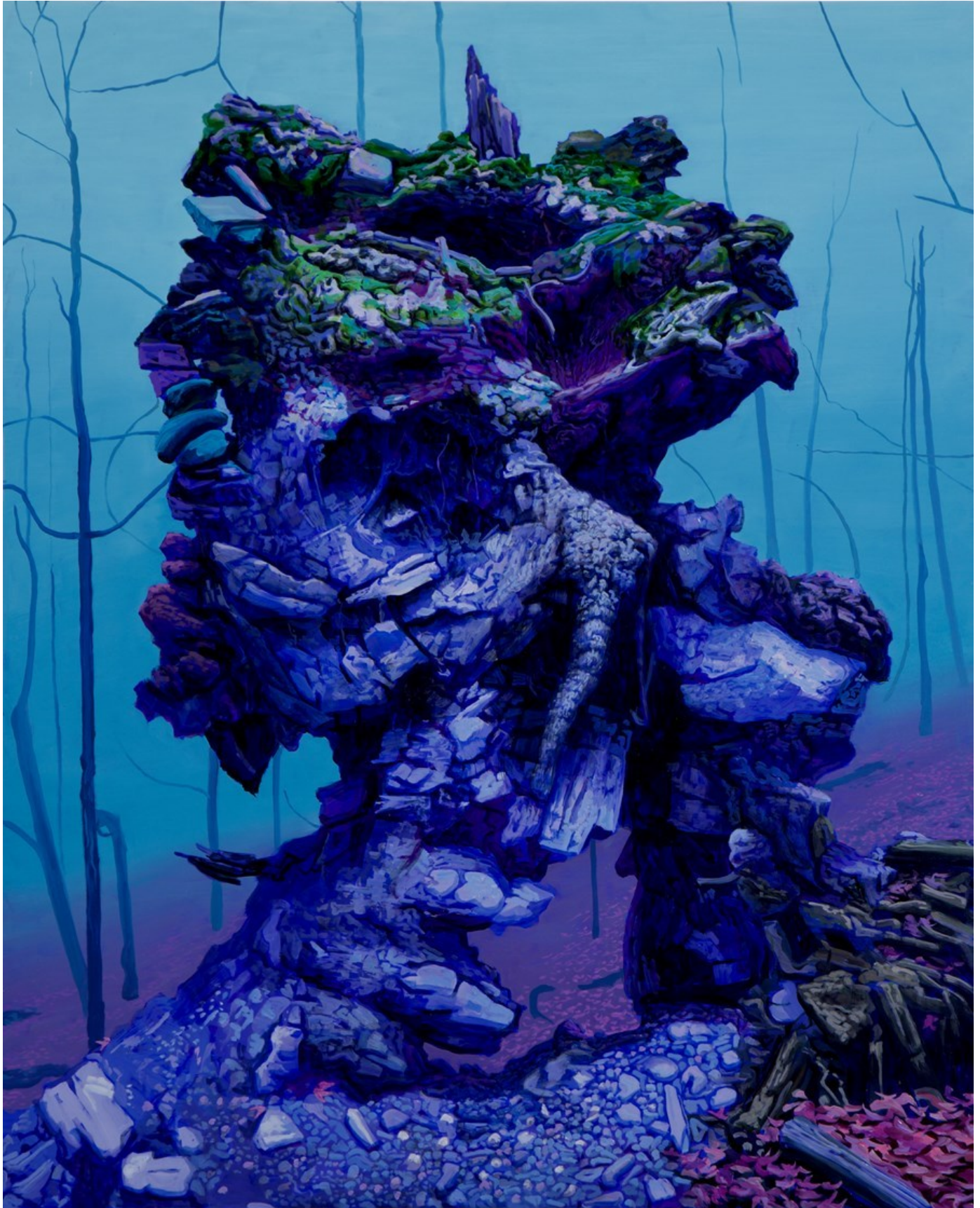
"Unstable Condition" 2024, Oil on panel, 76 x 61 cm, 30 x 24 in

GALLERY POULSEN CONTEMPORARY FINE ARTS - COPENHAGEN