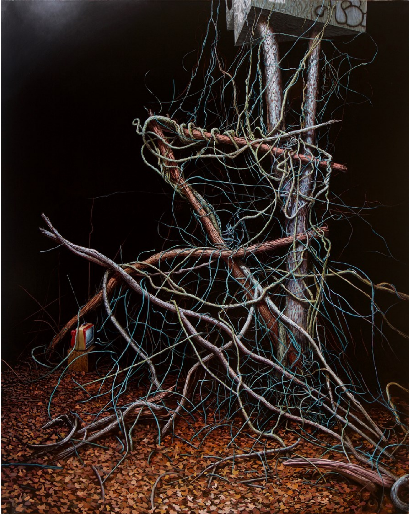
The Owl was Fake, 2019, oil on linen, 127 x 102 cm, 50 x 40 in

GALLERY POULSEN CONTEMPORARY FINE ARTS - COPENHAGEN