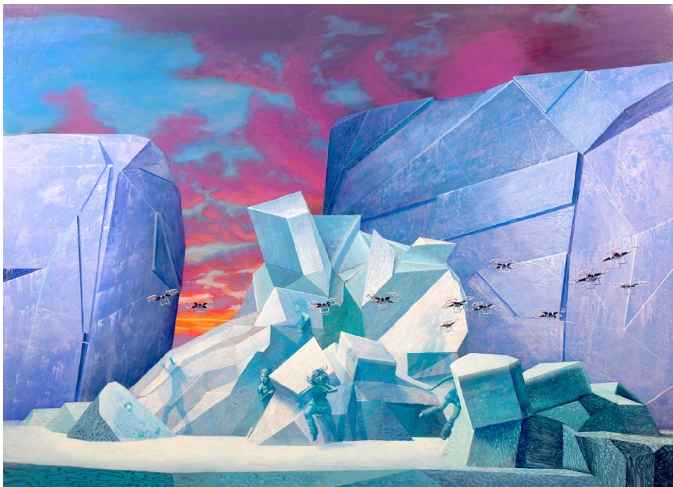
"The Ungraving" 2022, Oil on linen, 153,5 x 213,5 cm, 60,5 x 84 in

GALLERY POULSEN CONTEMPORARY FINE ARTS - COPENHAGEN