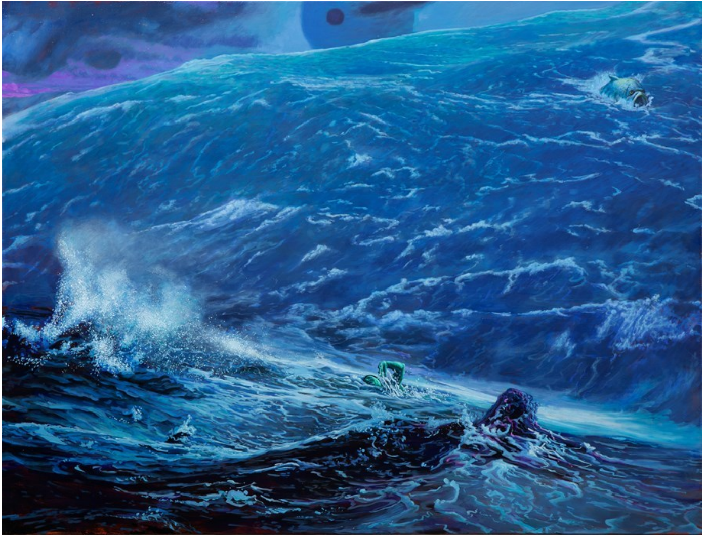
"Follow the Star" 2025, Oil on Linen, 81 x 107 cm, 32 x 42 in

GALLERY POULSEN CONTEMPORARY FINE ARTS - COPENHAGEN