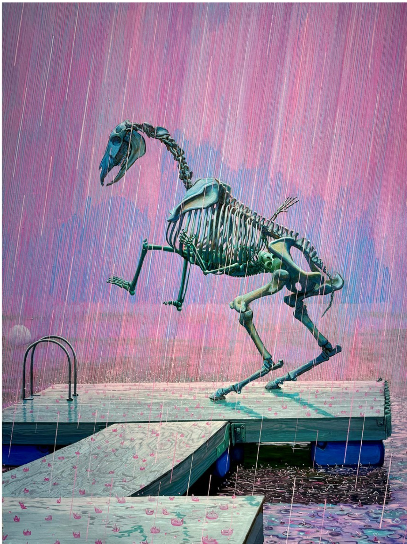
"Departure" 2024, Oil on linen, 122 x 92 cm, 48 x 36 in

GALLERY POULSEN CONTEMPORARY FINE ARTS - COPENHAGEN