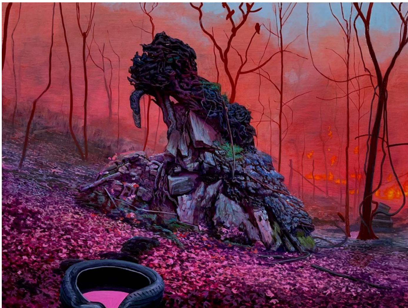
"Abysmal Dawn" 2023, Oil on panel - 45,5 x 61 cm, 18 x 24 in, $6,000 (+5% Danish art tax)

GALLERY POULSEN CONTEMPORARY FINE ARTS - COPENHAGEN