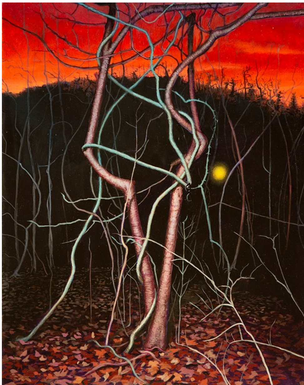
The Philosopher, 2020, oil on linen, 35,5 x 28 cm, 14 x 11 in

GALLERY POULSEN CONTEMPORARY FINE ARTS - COPENHAGEN