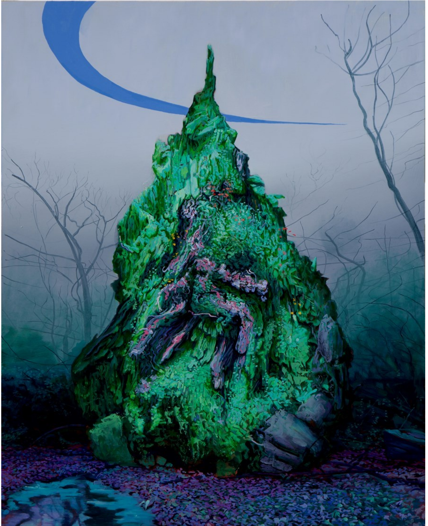
"Naked Nest" 2024, Oil on panel, 76 x 61 cm, 30 x 24 in

GALLERY POULSEN CONTEMPORARY FINE ARTS - COPENHAGEN