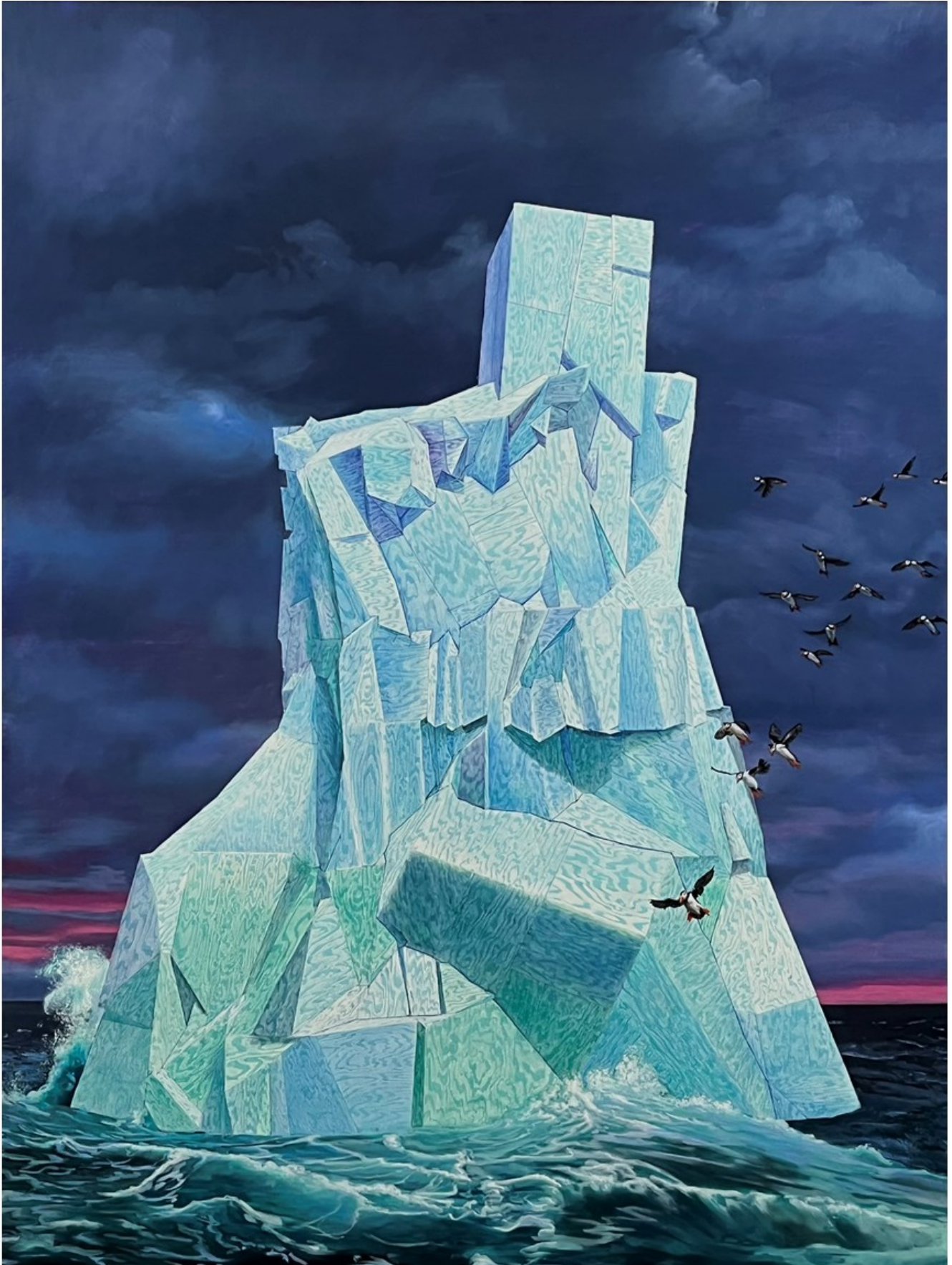
"North Wood" 2021, Oil on linen, 122 x 91,5 cm, 48 x 36 in

GALLERY POULSEN CONTEMPORARY FINE ARTS - COPENHAGEN