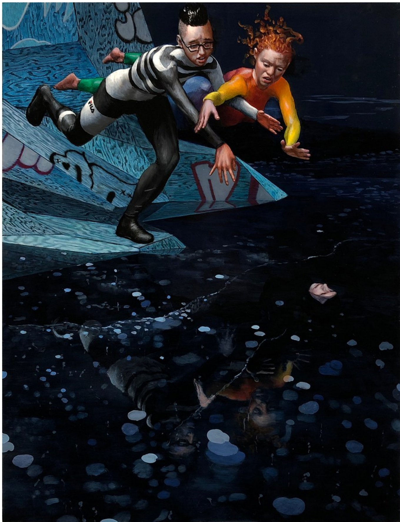
"Black Ice" 2021, Oil on panel, 61 x 46 cm, 24 x 18 in

GALLERY POULSEN CONTEMPORARY FINE ARTS - COPENHAGEN