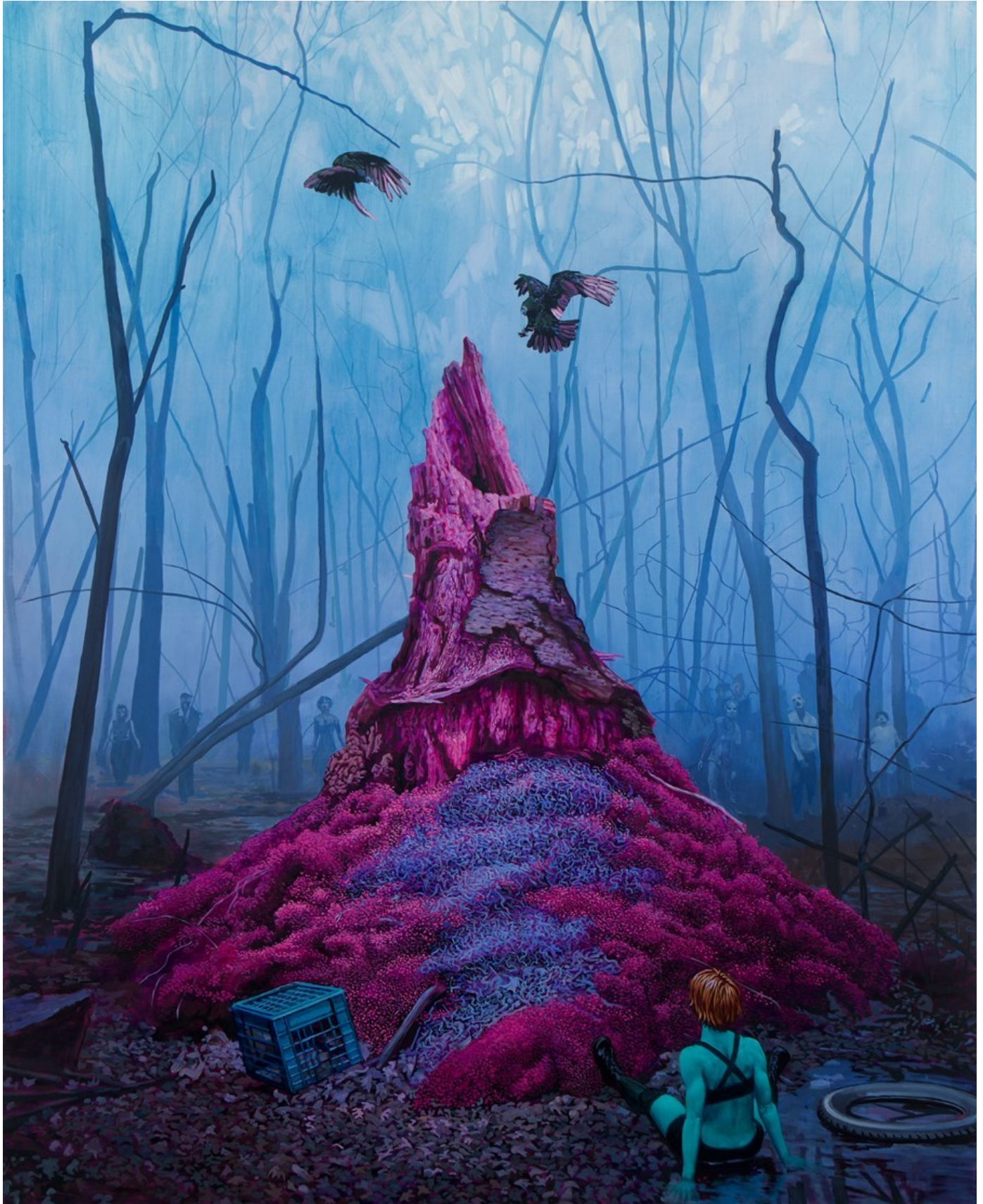
"Victual Sign" 2023, Oil on linen - 152,5 x 122 cm, 60 x 48 in, $14,000 (+ 5% Danish art tax)

GALLERY POULSEN CONTEMPORARY FINE ARTS - COPENHAGEN