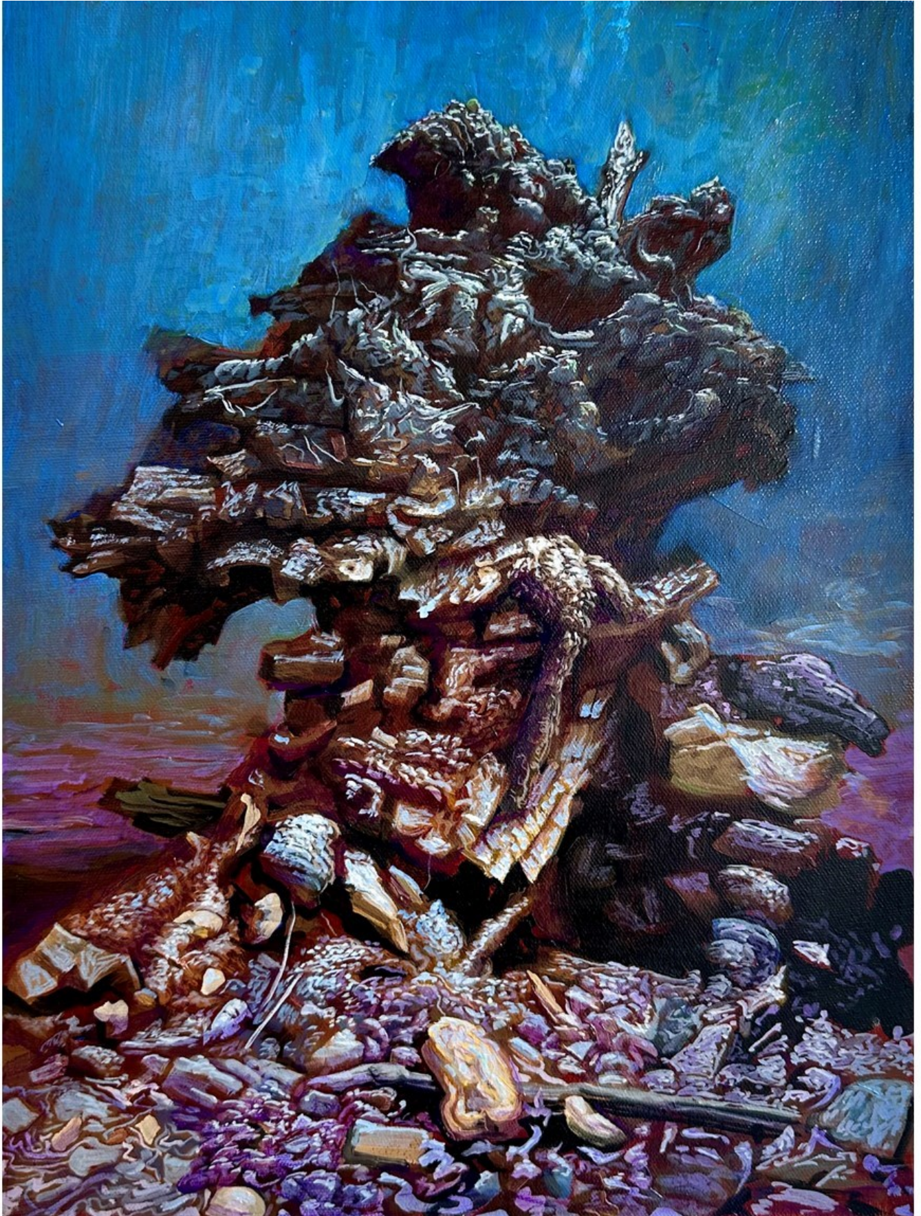
"Stable Condition" 2024, Oil on linen, 41 x 30,5 cm, 16 x 12 in

GALLERY POULSEN CONTEMPORARY FINE ARTS - COPENHAGEN