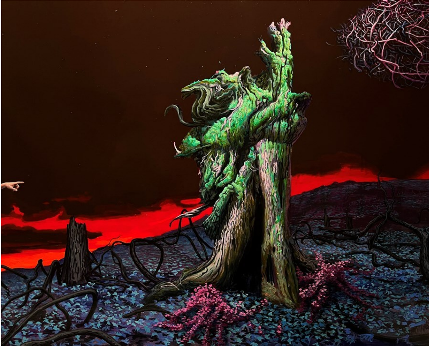
"Oracle" 2023, Oil on panel, 61 x 76 cm, 24 x 30 in

GALLERY POULSEN CONTEMPORARY FINE ARTS - COPENHAGEN