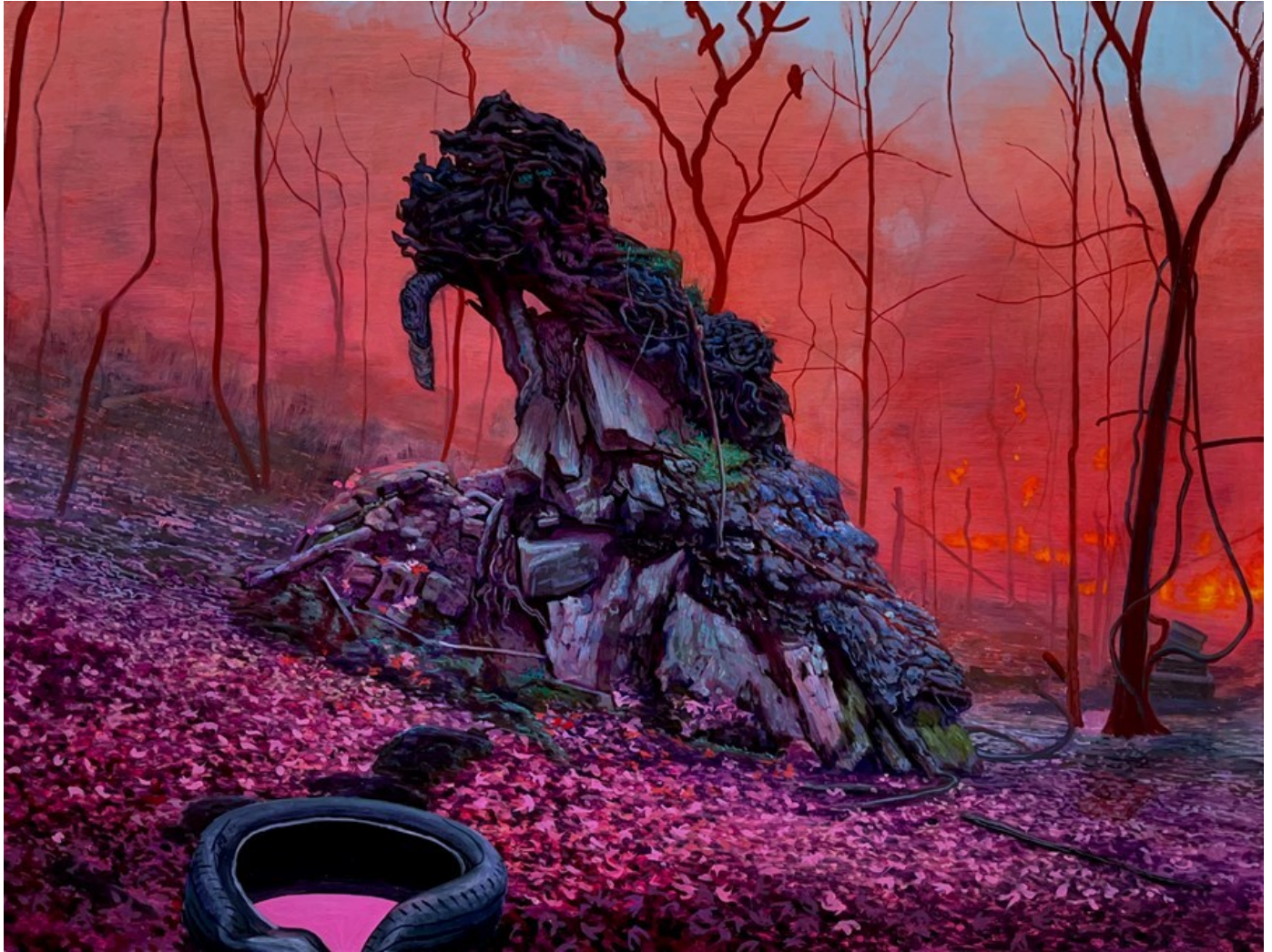
"Abysmal Dawn" 2023, Oil on panel - 45,5 x 61 cm, 18 x 24 in, $6,000 (+5% Danish art tax)

GALLERY POULSEN CONTEMPORARY FINE ARTS - COPENHAGEN