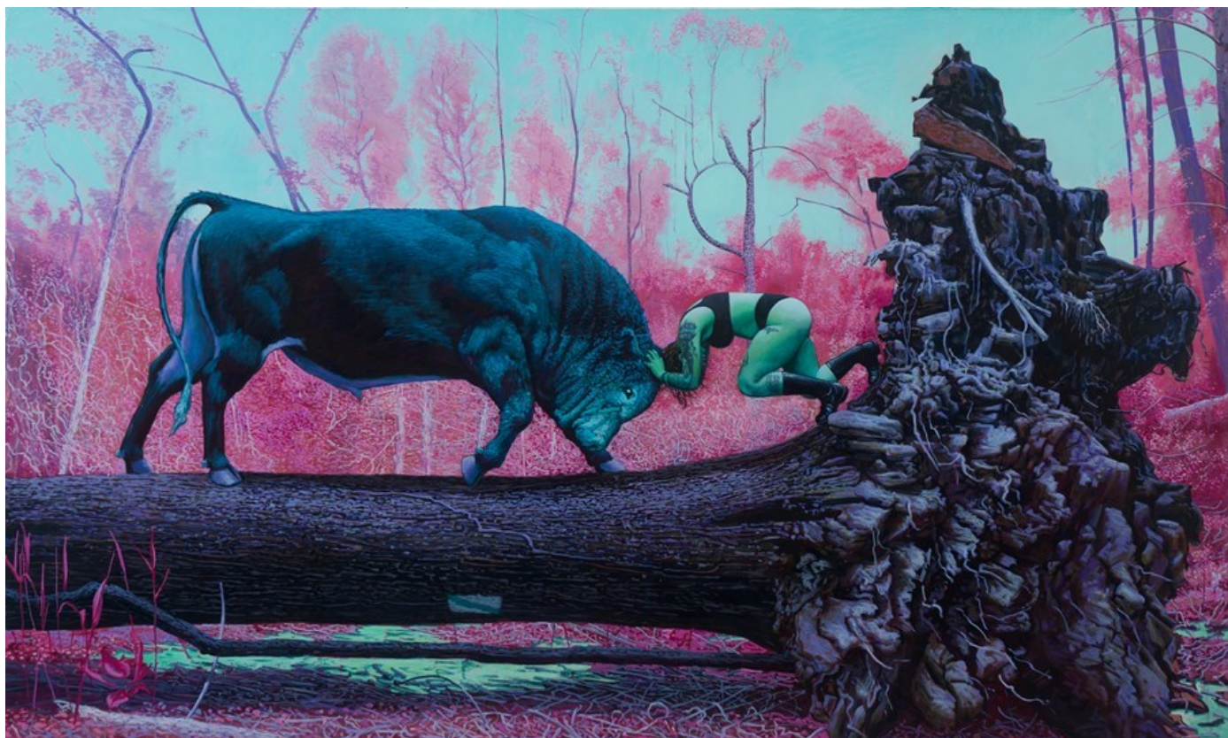
John Jacobsmeyer "Lumber Punks" 2024, Oil on linen, 76 x 127 cm, 30 x 50 in

GALLERY POULSEN CONTEMPORARY FINE ARTS - COPENHAGEN