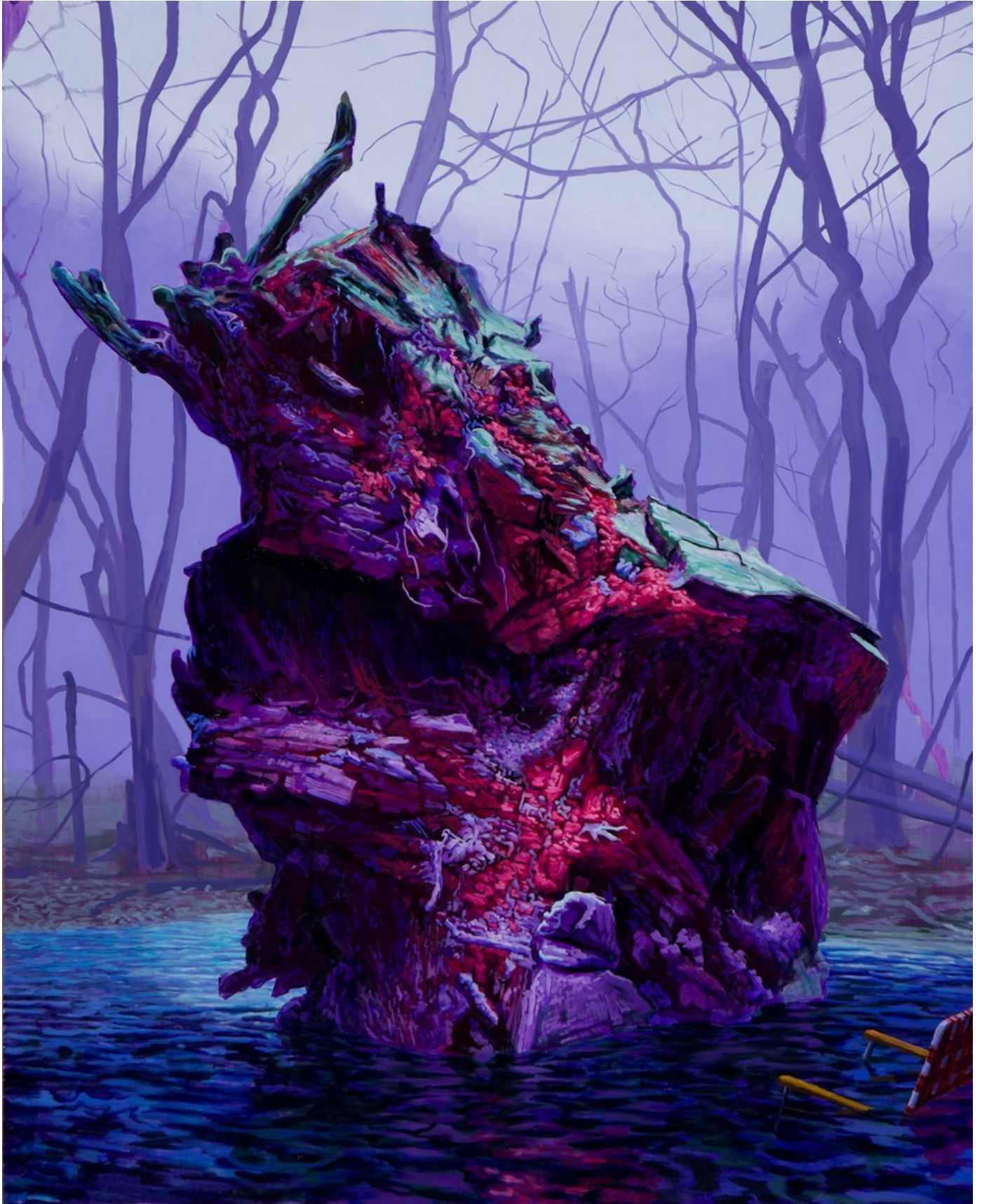
"Pound of Obscure" 2024, Oil on panel, 76 x 61 cm, 30 x 24 in

GALLERY POULSEN CONTEMPORARY FINE ARTS - COPENHAGEN