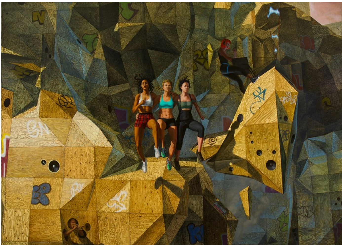
Frak Me Gently, 2018, Oil on Linen, 152 x 213 cm, 60 x 84 in

GALLERY POULSEN CONTEMPORARY FINE ARTS - COPENHAGEN