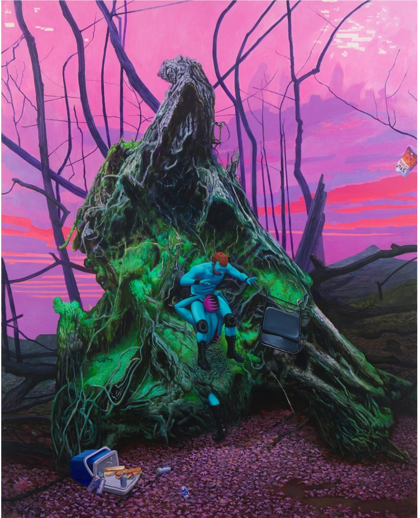
"Bad Picnic" 2023, Oil on linen - 152,5 x 122 cm, 60 x 48 in, $14,000 (+ 5% Danish art tax)

GALLERY POULSEN CONTEMPORARY FINE ARTS - COPENHAGEN