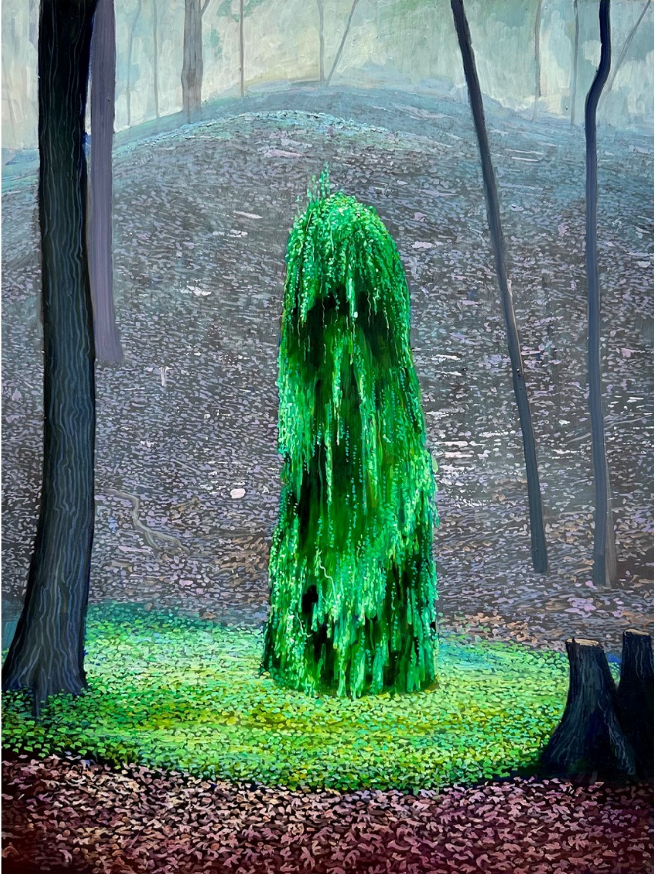
"Mist Mesh" 2024, Oil on panel, 61 x 46 cm, 24 x 18 in

GALLERY POULSEN CONTEMPORARY FINE ARTS - COPENHAGEN