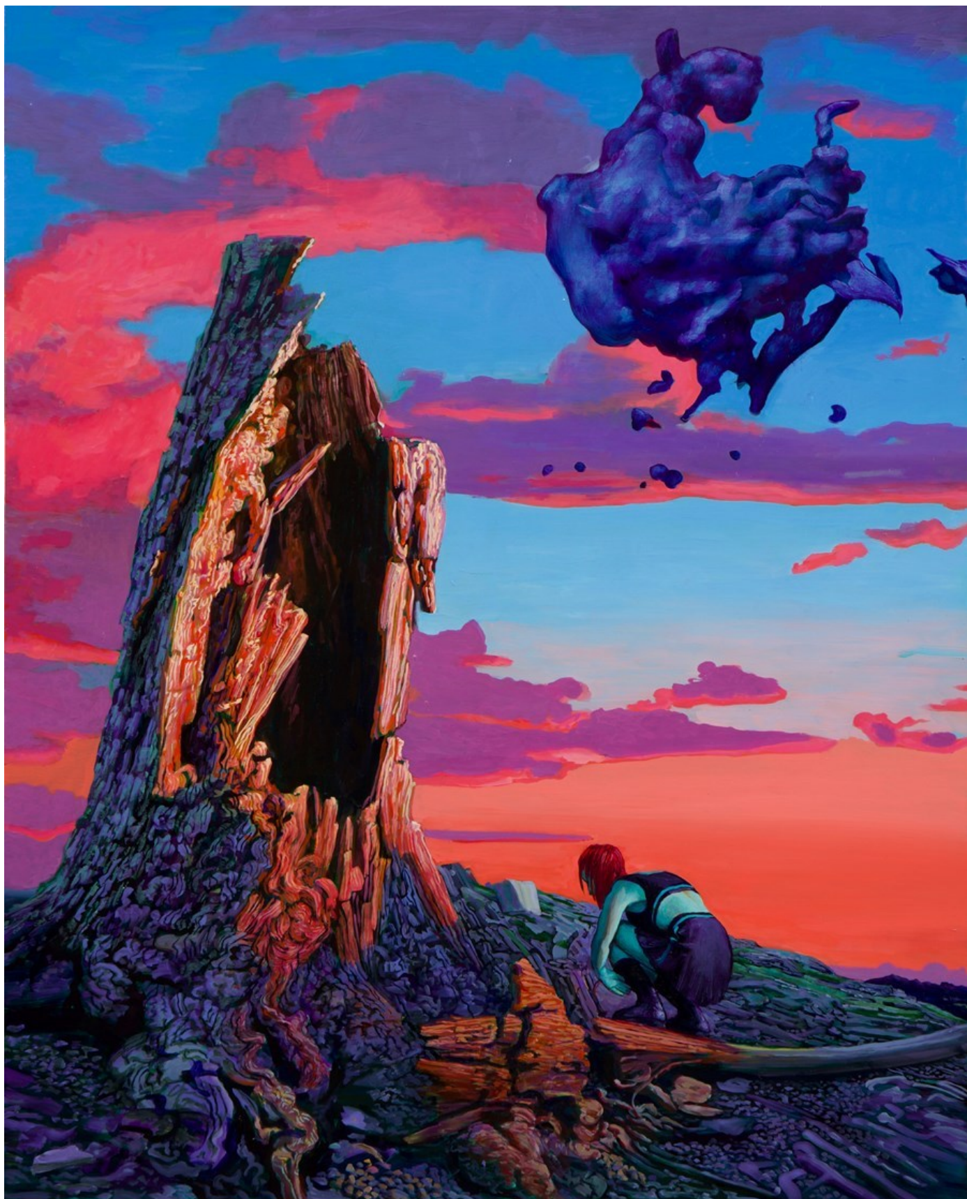
"Another Doubtful" 2024, Oil on panel, 76 x 61 cm, 30 x 24 in

GALLERY POULSEN CONTEMPORARY FINE ARTS - COPENHAGEN