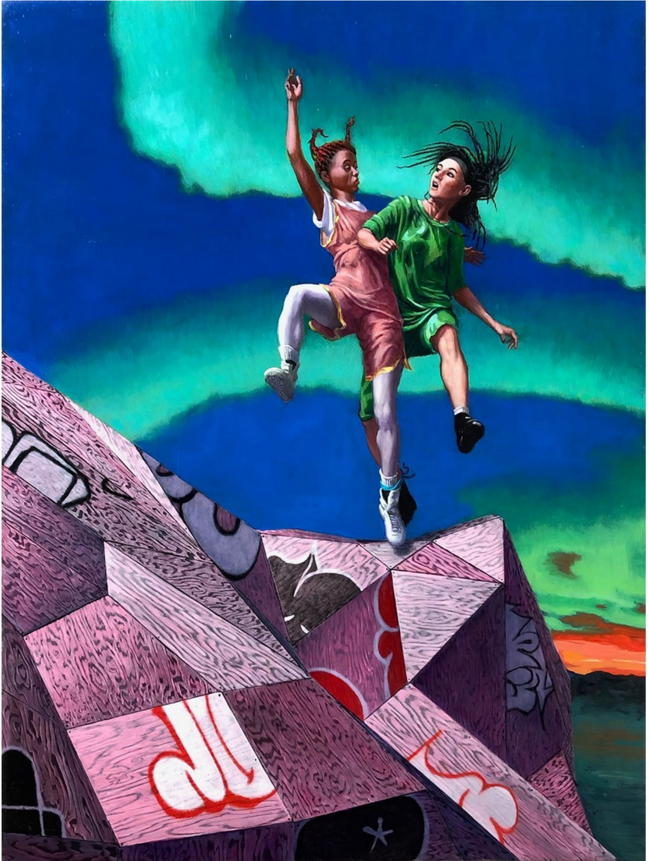
"Great Feat" 2021, Oil on panel, 61 x 46 cm, 24 x 18 in

GALLERY POULSEN CONTEMPORARY FINE ARTS - COPENHAGEN