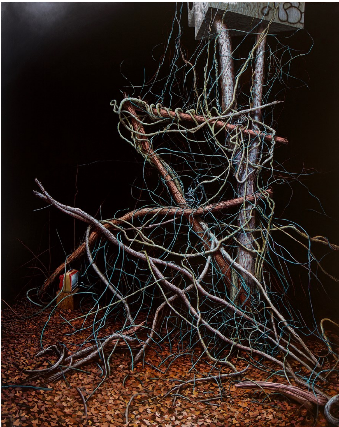
The Owl was Fake, 2019, oil on linen, 127 x 102 cm, 50 x 40 in

GALLERY POULSEN CONTEMPORARY FINE ARTS - COPENHAGEN