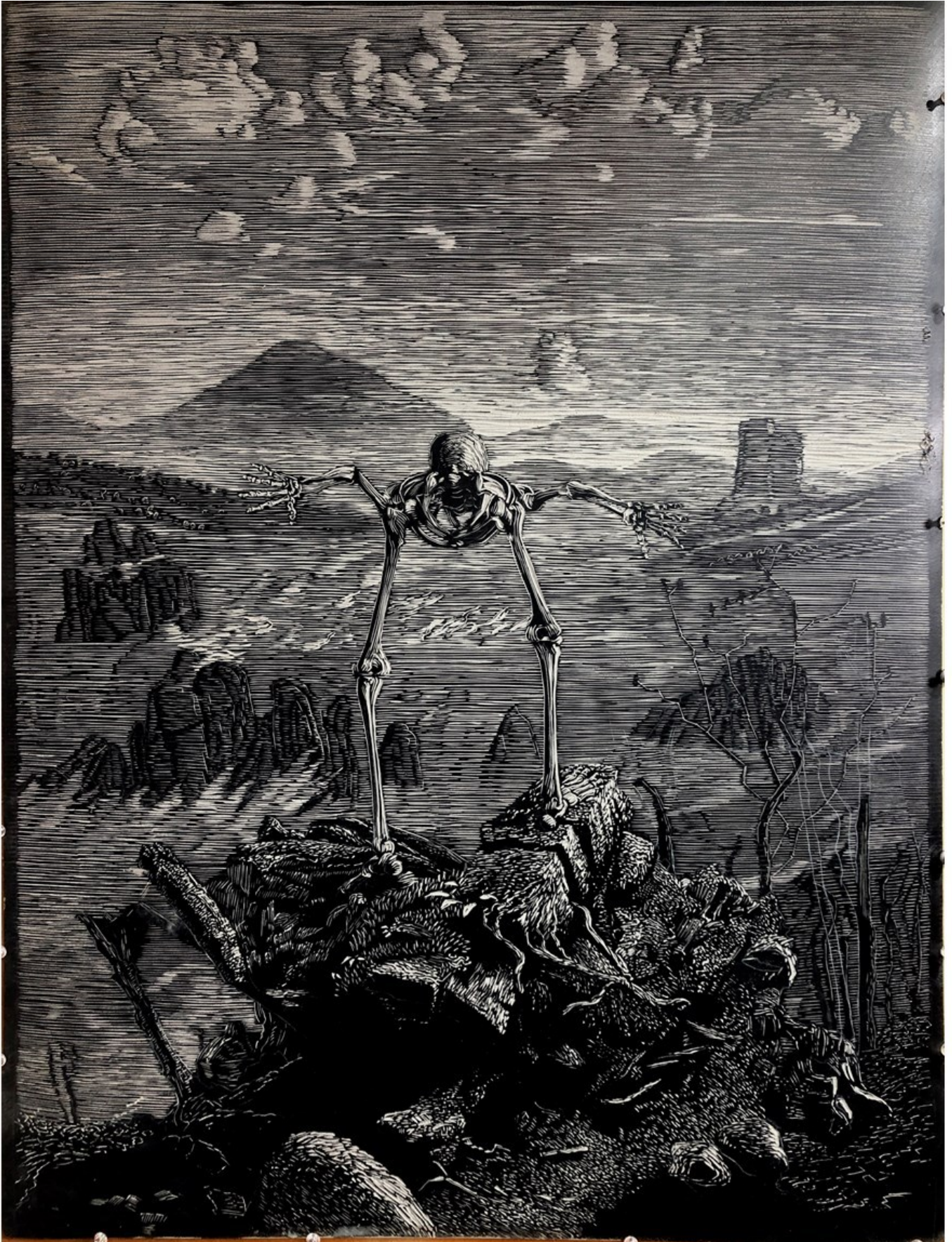
Oculus, 2019, Linocut, 81 cm x 61 cm, 32 x 24 in

GALLERY POULSEN CONTEMPORARY FINE ARTS - COPENHAGEN