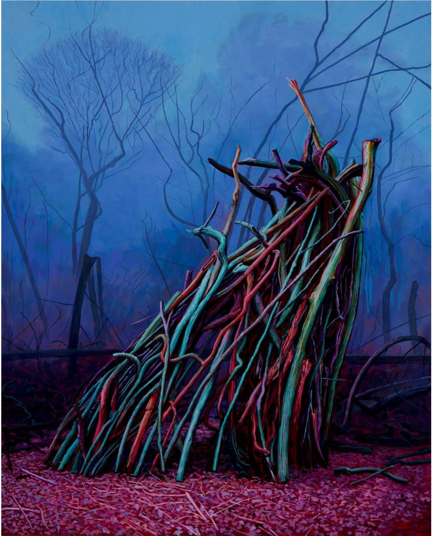
"Prism House" 2024, Oil on panel, 76 x 61 cm, 30 x 24 in

GALLERY POULSEN CONTEMPORARY FINE ARTS - COPENHAGEN