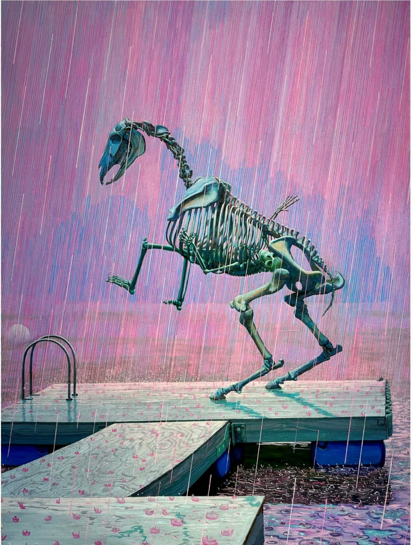
"Departure" 2024, Oil on linen, 122 x 92 cm, 48 x 36 in

GALLERY POULSEN CONTEMPORARY FINE ARTS - COPENHAGEN