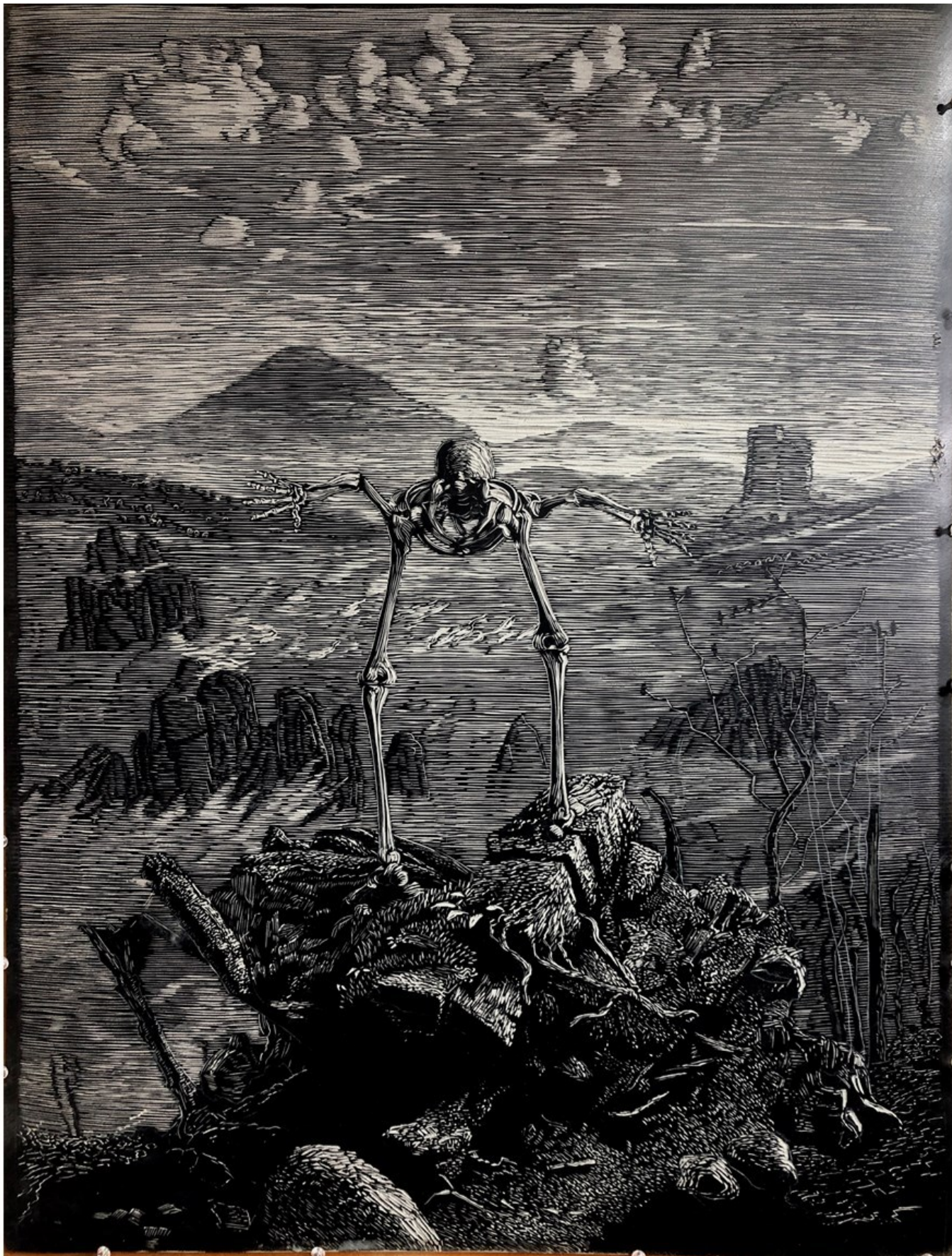
Oculus, 2019, Linocut, 81 cm x 61 cm, 32 x 24 in

GALLERY POULSEN CONTEMPORARY FINE ARTS - COPENHAGEN