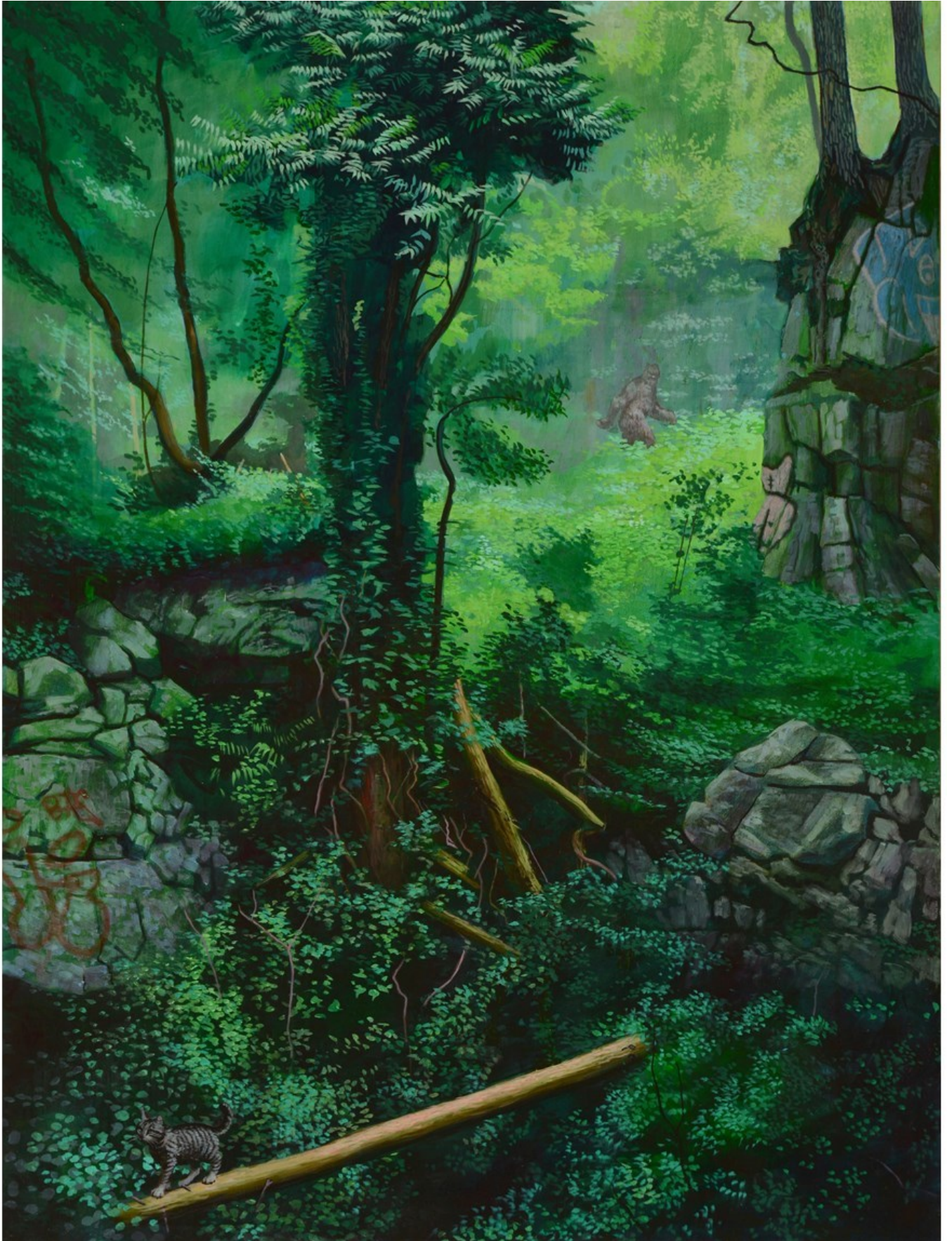
"Phase VI" 2020,, oil on panel,, 61 x 46 cm, 24 x 18 in

GALLERY POULSEN CONTEMPORARY FINE ARTS - COPENHAGEN