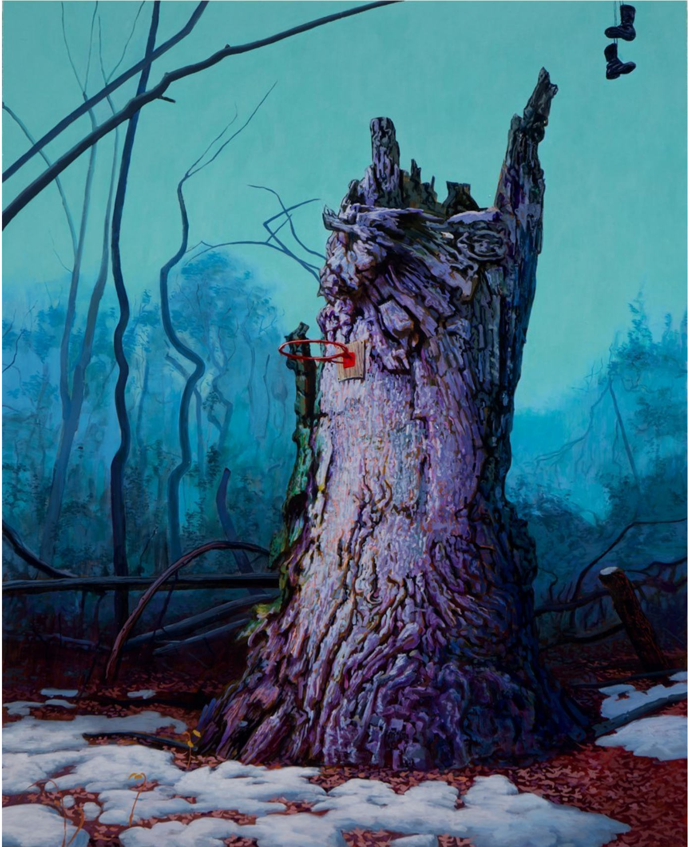
"Grey Mind" 2024, Oil on panel, 76 x 61 cm, 30 x 24 in

GALLERY POULSEN CONTEMPORARY FINE ARTS - COPENHAGEN