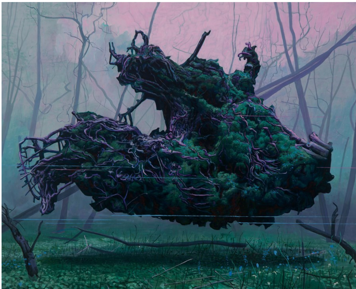
"Sacrifice" 2023, Oil on panel, 61 x 76 cm, 24 x 30 in

GALLERY POULSEN CONTEMPORARY FINE ARTS - COPENHAGEN