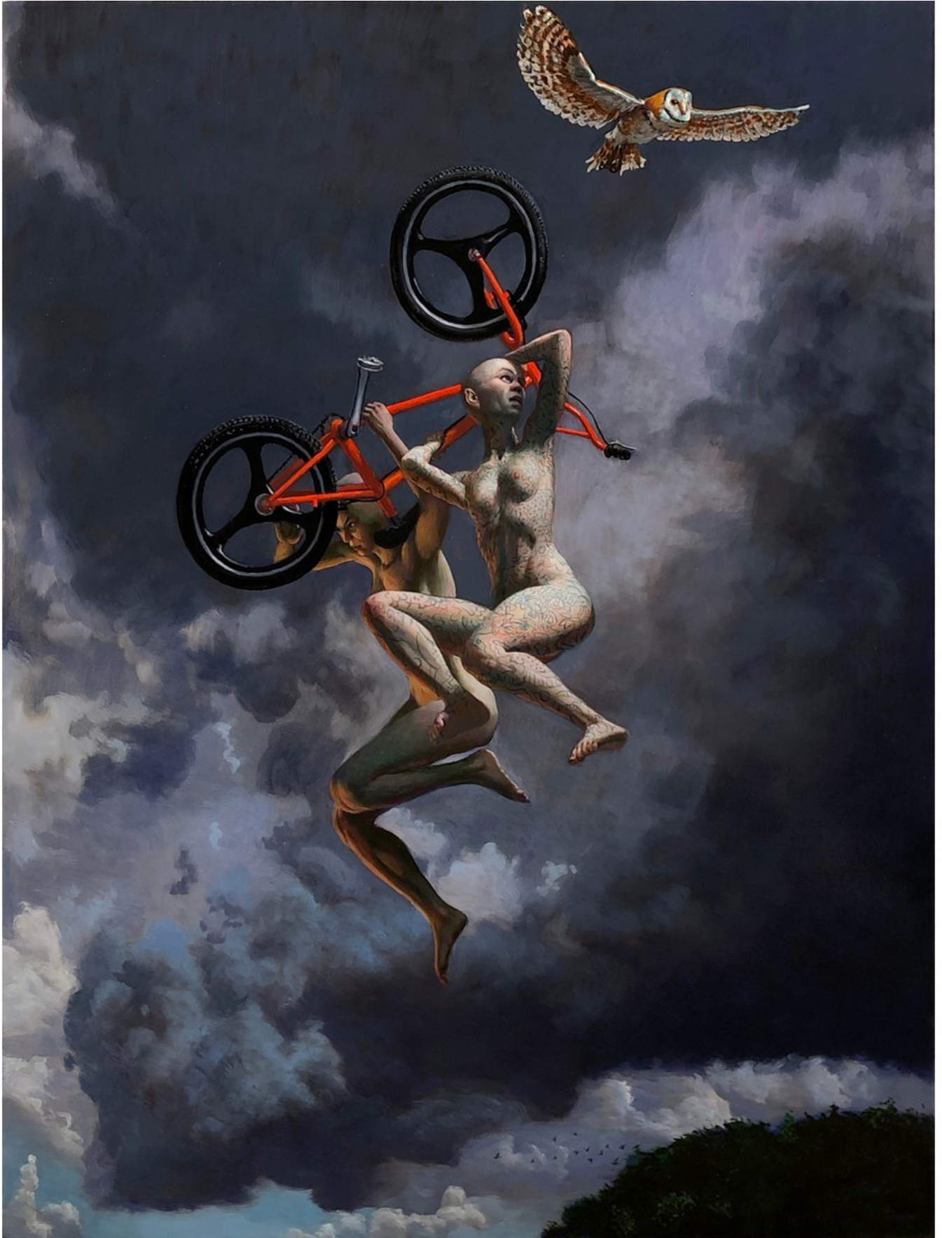
"Out of this World" 2021, Oil on panel, 61 x 46 cm, 24 x 18 in

GALLERY POULSEN CONTEMPORARY FINE ARTS - COPENHAGEN