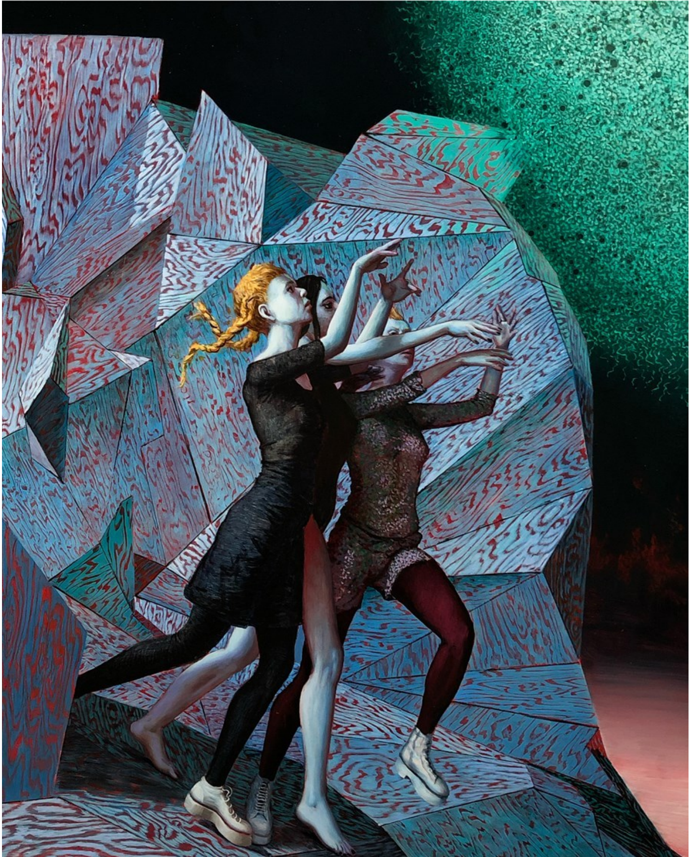
"Visitation" 2021, Oil on panel, 61 x 46 cm, 24 x 18 in

GALLERY POULSEN CONTEMPORARY FINE ARTS - COPENHAGEN