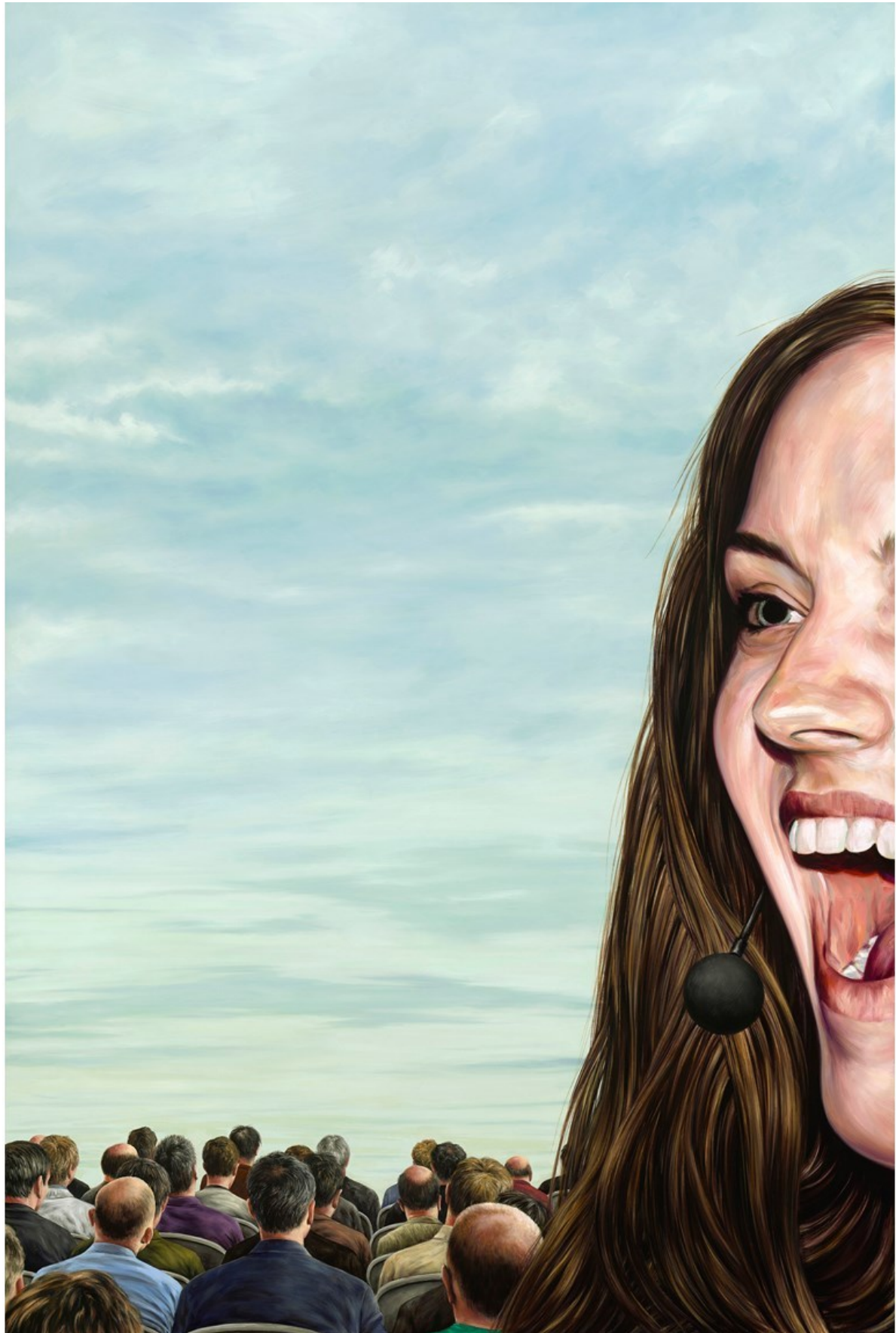
Seminar, 2019, oil on canvas, 183 x 122 cm, 72 x 48 in

GALLERY POULSEN CONTEMPORARY FINE ARTS - COPENHAGEN