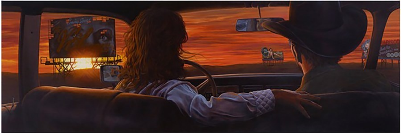
Down In Front - Coming Soon 2019, Pigment inkjet print 305gm Hotpress paper, Edition of 20, 25,5 x 76 cm, 10 x 30 in

GALLERY POULSEN CONTEMPORARY FINE ARTS - COPENHAGEN