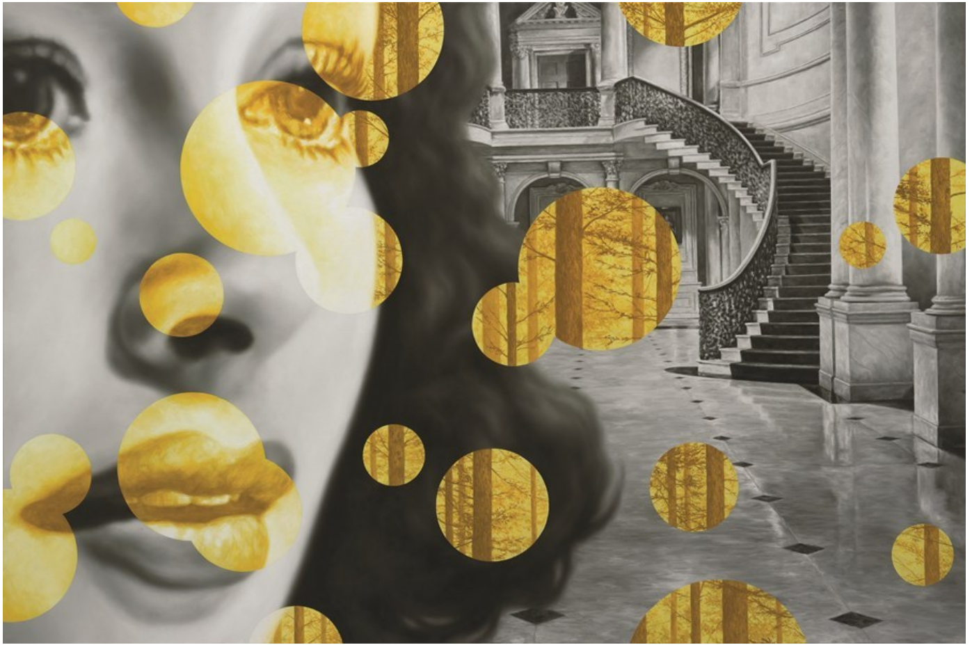
Foyer, 2012, Giclee print, edition of 50, 50 x 71 cm, 19.7 x 28 in

GALLERY POULSEN CONTEMPORARY FINE ARTS - COPENHAGEN