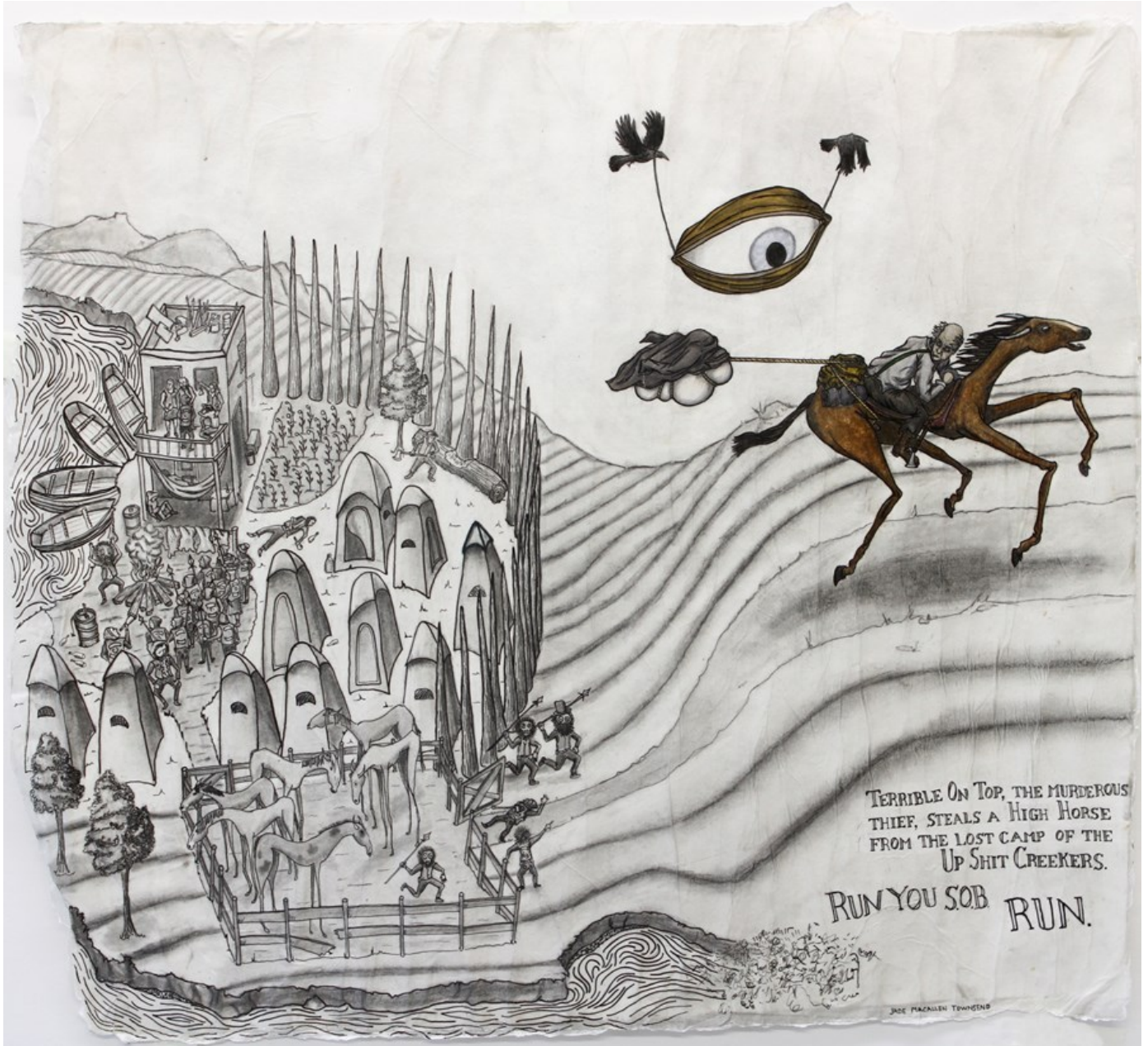
Run you S.O.B. Run, 2014, Graphite, charcoal, prisma color and ink on paper, 64 x 58 cm, 25.2 x 22.8 in

GALLERY POULSEN CONTEMPORARY FINE ARTS - COPENHAGEN