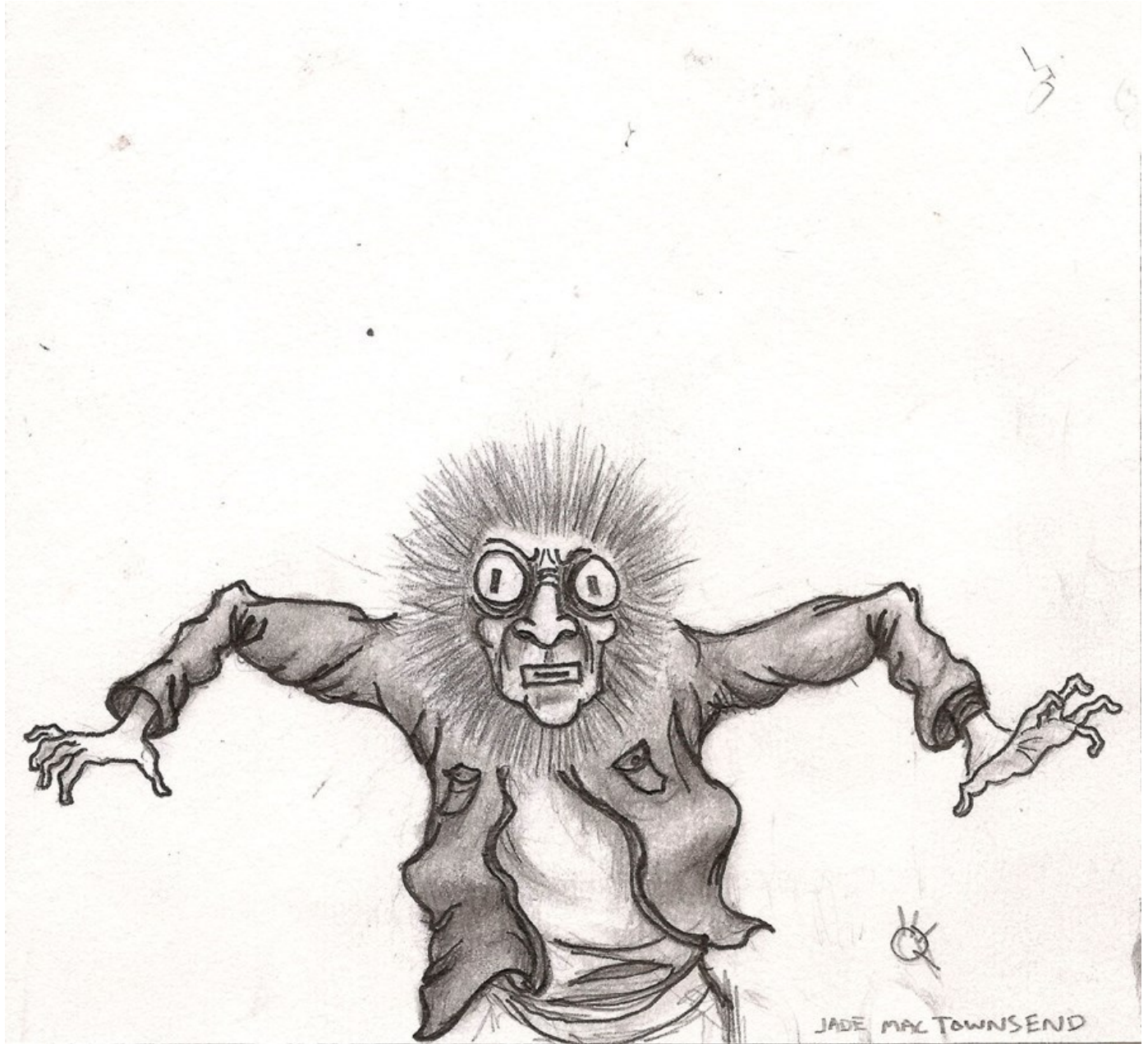
Little One, 2014, Graphite on paper, 13 x 13 cm, 5.1 x 5.1 in

GALLERY POULSEN CONTEMPORARY FINE ARTS - COPENHAGEN