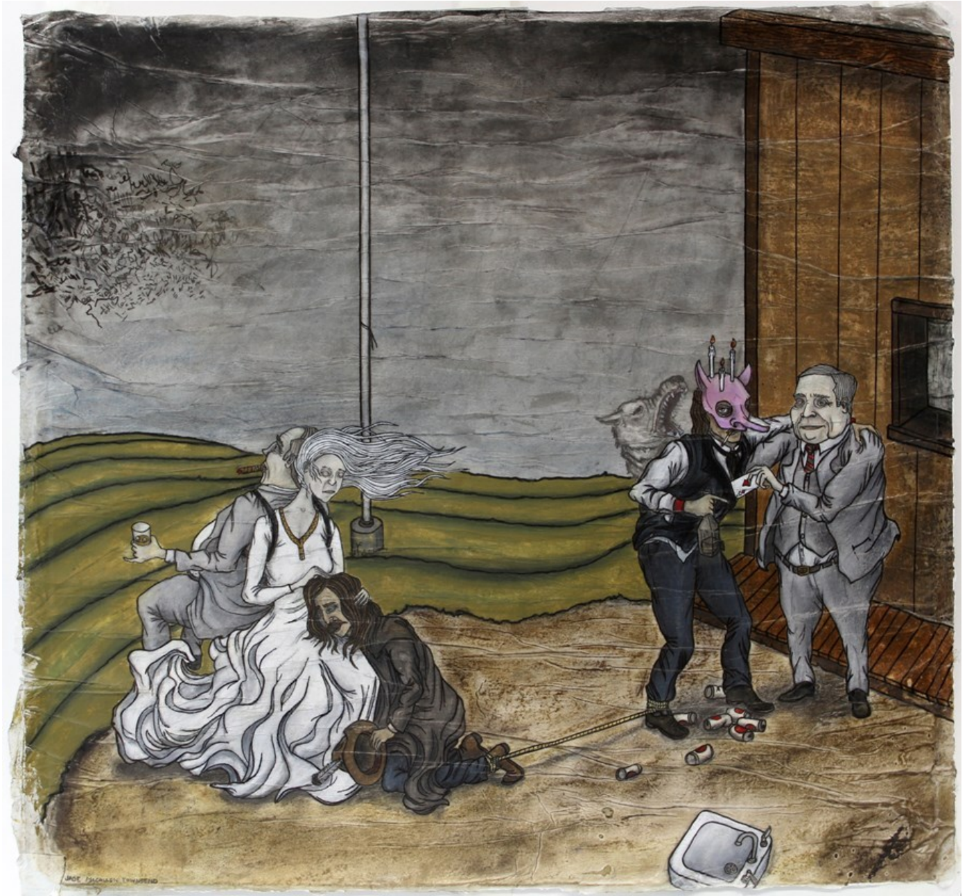
Freewill & Fate-Freewill consoled by Delusion and Fate is hammer ed drunk making questionable alliances, 2014, Graphite, charcoal, oil, prisma color and ink on paper, 48 x 46 cm, 18.9 x 18.1 in

GALLERY POULSEN CONTEMPORARY FINE ARTS - COPENHAGEN