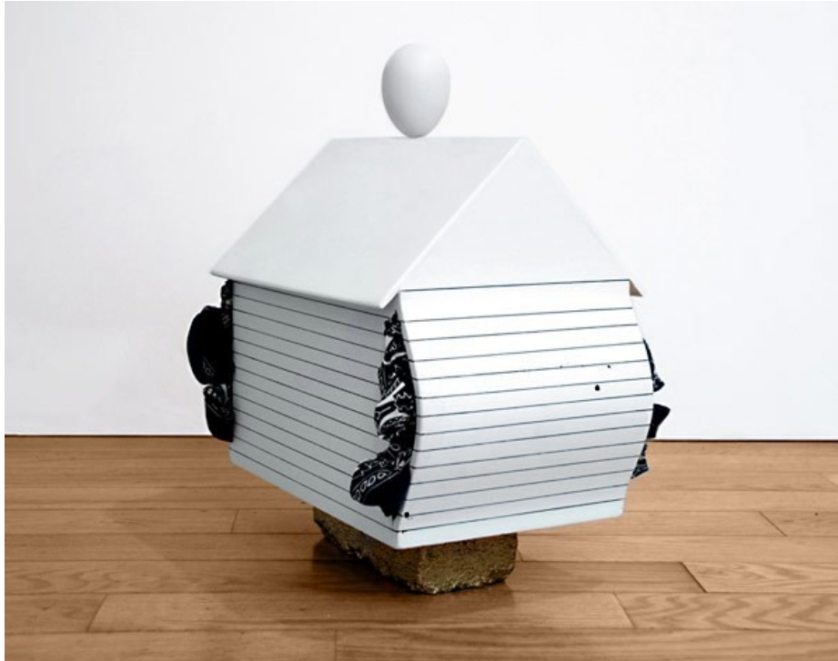
Of Alchemy, Revolution and Dreams, 2007, Pine, birch, brick, balsa foam, latex paint, ink and cloth, 40.6 x 30.5 x 45.7 cm, 16 x 12 x 18 in

GALLERY POULSEN CONTEMPORARY FINE ARTS - COPENHAGEN