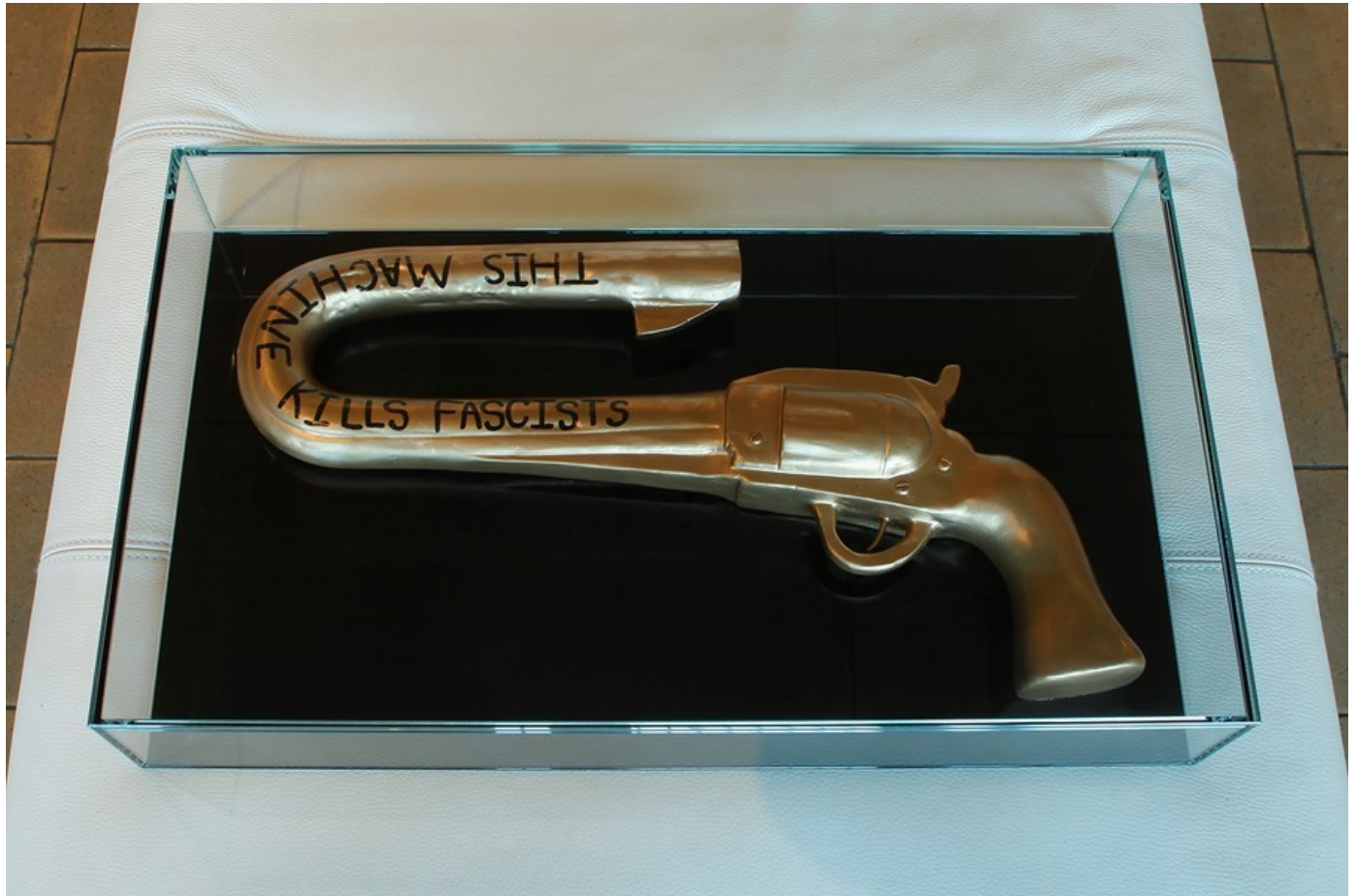
Hey Hey Woody Guthrie, 2007, Styrofoam, roscoe foam coat, krylo n paint, ink, pillow and satin pillow case, framed in glass montre., 60.9 x 3 5.5 x 15.2 cm, 24 x 14 x 6 in

GALLERY POULSEN CONTEMPORARY FINE ARTS - COPENHAGEN