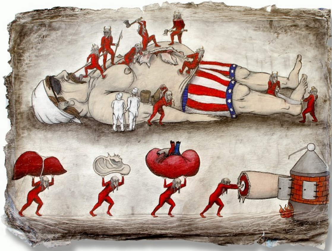
Beached, 2013, Graphite, charcoal, prisma color, oil and ink on paper, 74 x 103 cm, 29.1 x 40.6 in

GALLERY POULSEN CONTEMPORARY FINE ARTS - COPENHAGEN