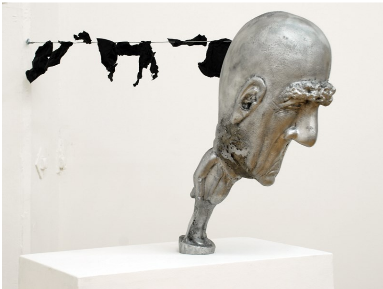
Underbelly, 2010, 70 lbs of solid aluminum, black wrap, and aircraft cable, 50.8 x 30.5 x 50.8 cm, 20 x 12.1 x 20 in

GALLERY POULSEN CONTEMPORARY FINE ARTS - COPENHAGEN