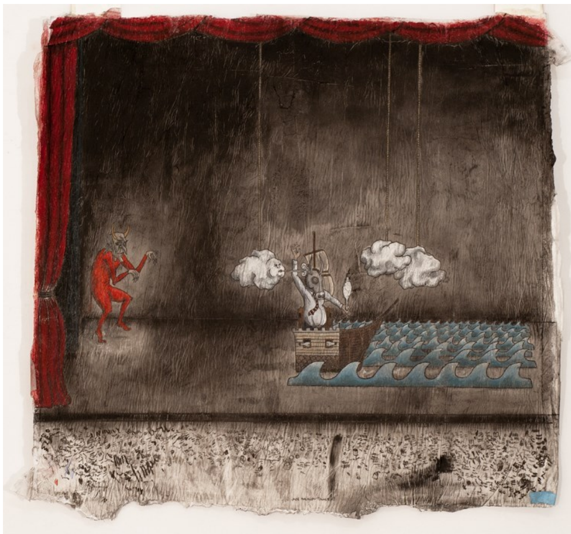
Of stroking your own Fallow Horse / Solipsism, 2013, Graphite, charcoal, prisma color, oil and ink on paper, 58 x 56 cm, 22.8 x 22 in

GALLERY POULSEN CONTEMPORARY FINE ARTS - COPENHAGEN