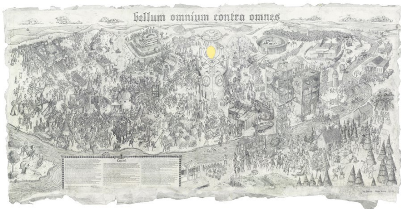
Bellum Omnium Contra Omnes, Collaboration between Jade Townsend and William Powhida, 2013, Digital print and imitation gold leaf on paper, edition of 24, 4AP, 118 x 224 cm, 46.5 x 88.2 in

GALLERY POULSEN CONTEMPORARY FINE ARTS - COPENHAGEN