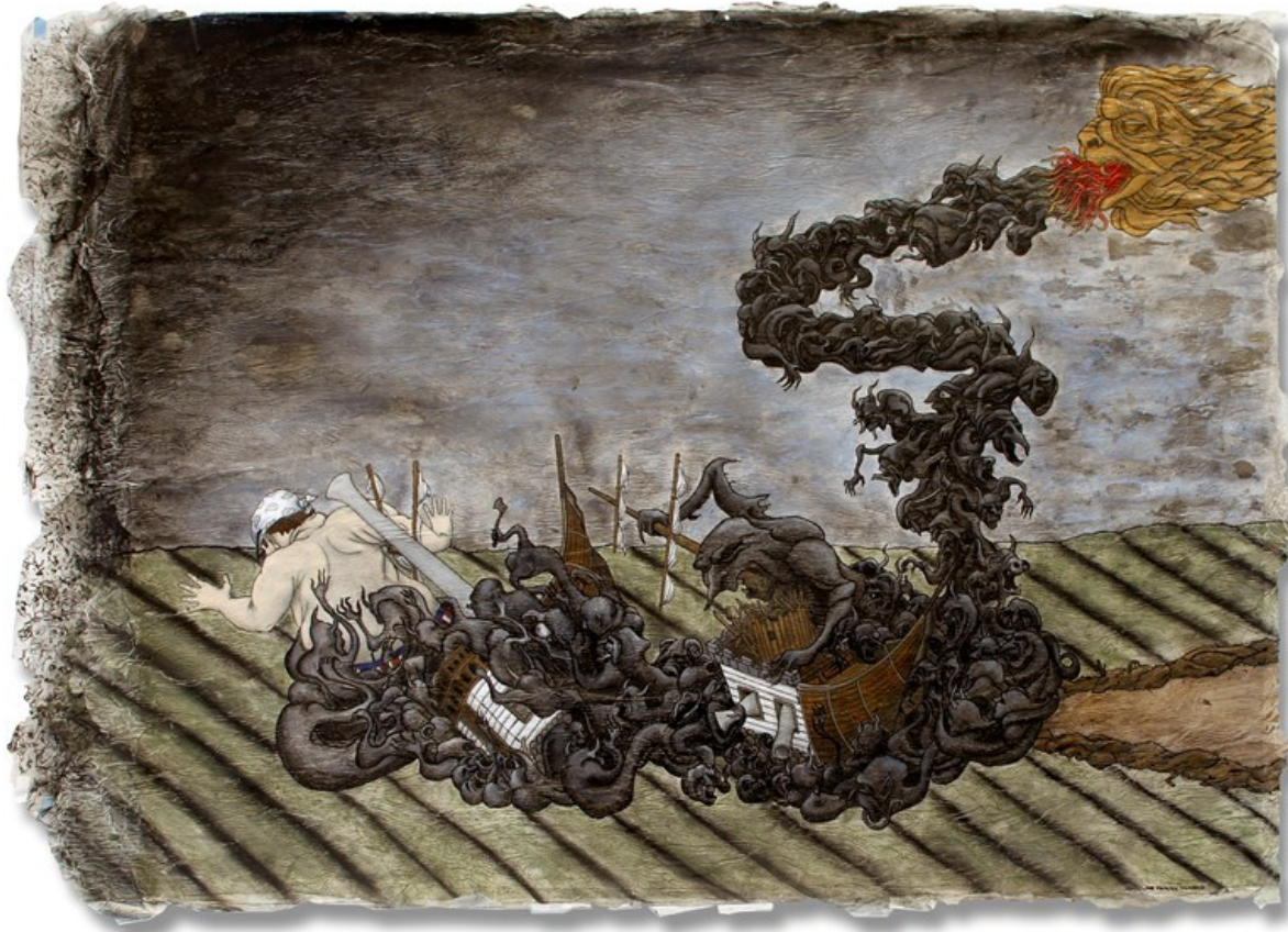
The Disaster, 2013, Graphite, charcoal, prisma color, oil and ink on paper., 97 x 136 cm, 38.2 x 53.5 in

GALLERY POULSEN CONTEMPORARY FINE ARTS - COPENHAGEN