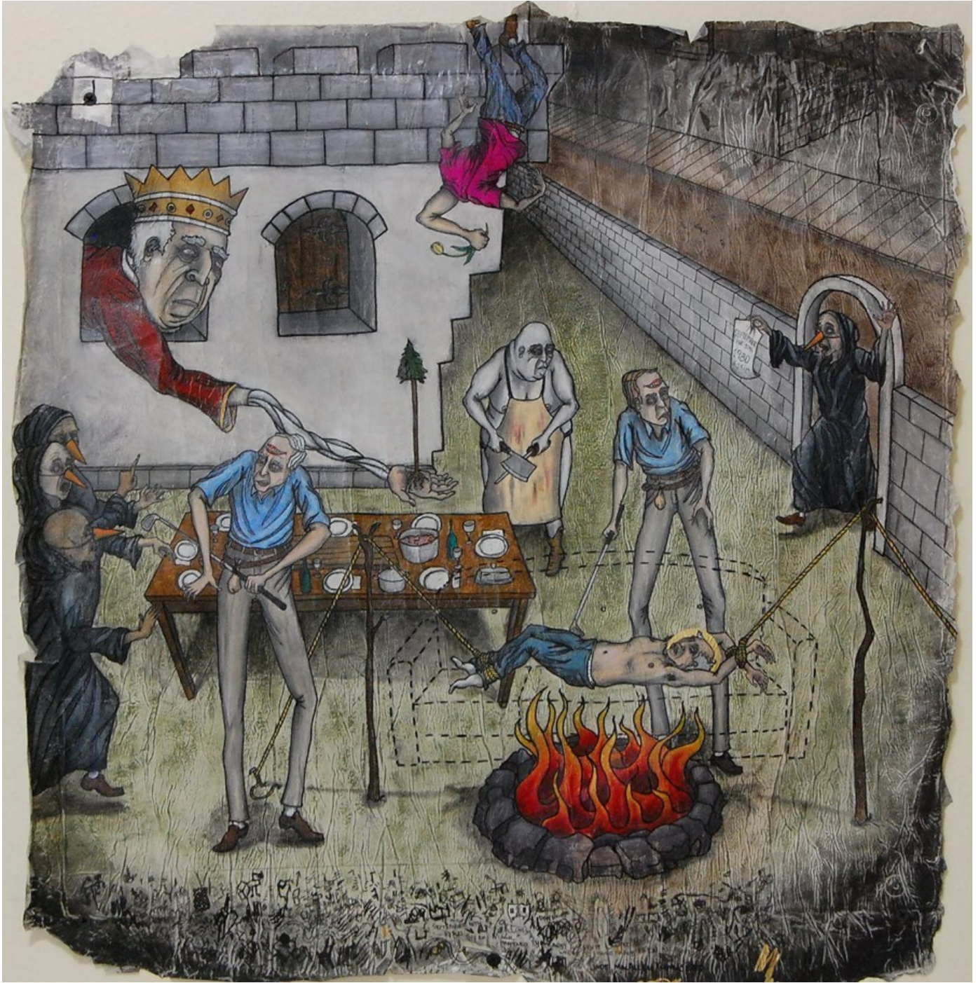
The Salvation of Terrible on Top 2015, mixed media on paper, 69 x 72 cm, 27 x 28 in

GALLERY POULSEN CONTEMPORARY FINE ARTS - COPENHAGEN