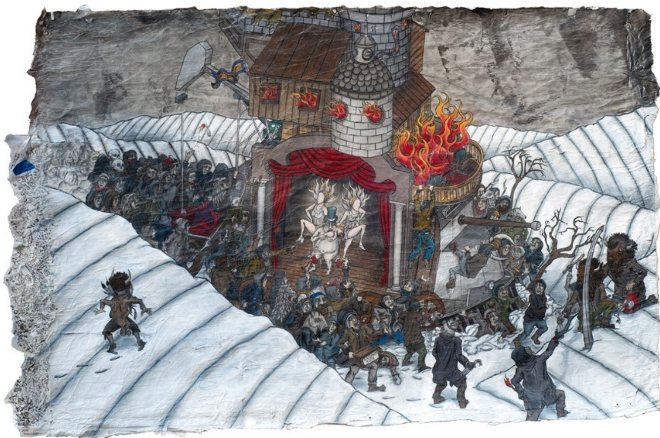
All is Well, 2014, Graphite, charcoal, prisma color, oil and ink on paper, 90 x 136 cm, 35.4 x 53.5 in

GALLERY POULSEN CONTEMPORARY FINE ARTS - COPENHAGEN