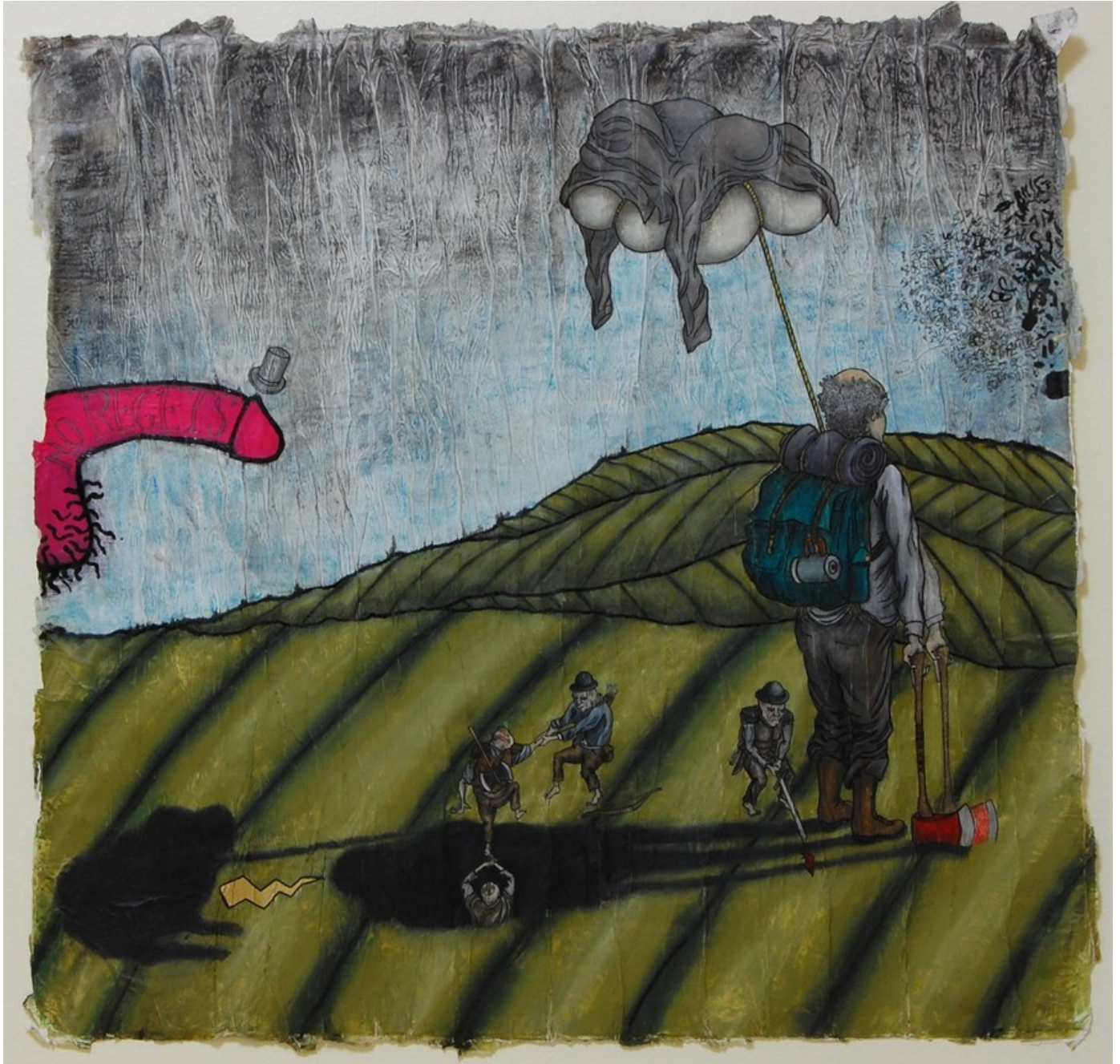
The Ballad of Terrible on Top - No Regets, 2015, Graphite, pastel, prisma color, oil and ink on paper, 61 x 58 cm, 24 x 23 in

GALLERY POULSEN CONTEMPORARY FINE ARTS - COPENHAGEN