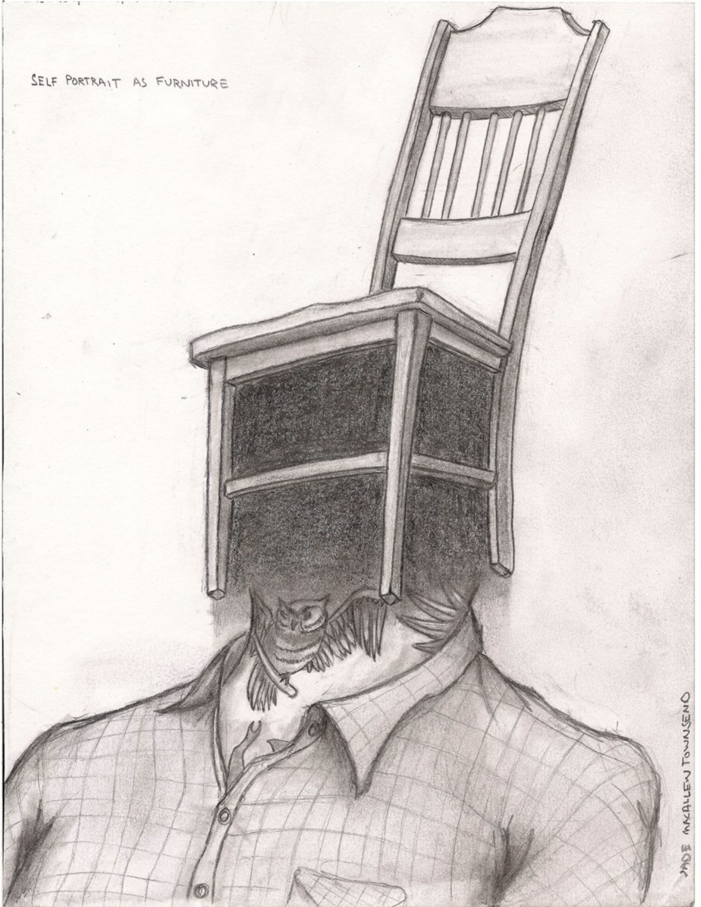
Self Portrait as Furniture, 2014, Graphite on paper, 28 x 22 cm, 11 x 8.7 in

GALLERY POULSEN CONTEMPORARY FINE ARTS - COPENHAGEN