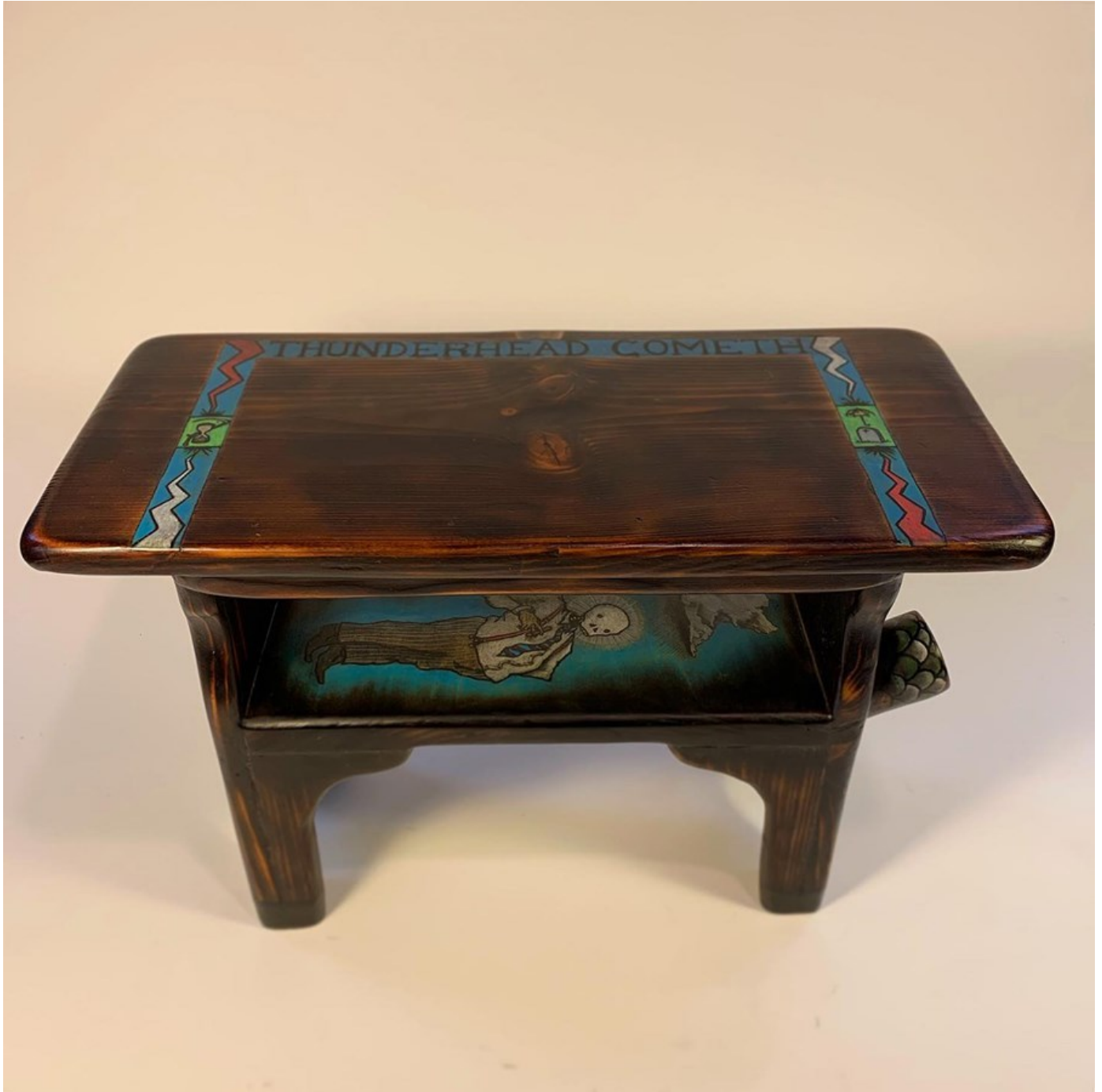
The Forecast Stool (Thunderhead Cometh) 2019, Found/reclaimed pine wood. Shou Sugi Ban finish, 42 x 19 x 28cm, 16.5 x 7.4 x 11 in

GALLERY POULSEN CONTEMPORARY FINE ARTS - COPENHAGEN