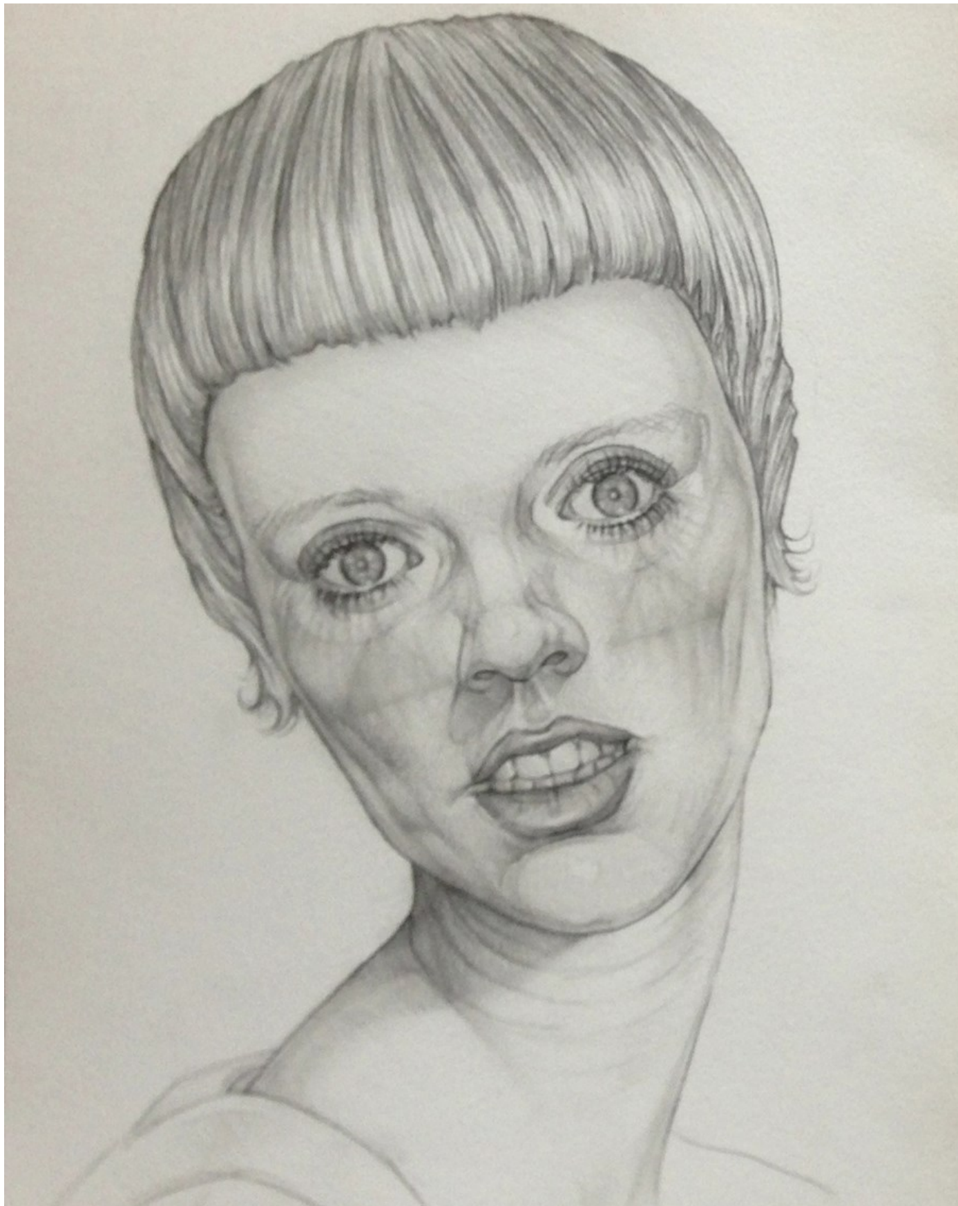
Untitled, 2015, graphite on paper, 41 x 30 cm, 16.1 x 11.8 in

GALLERY POULSEN CONTEMPORARY FINE ARTS - COPENHAGEN