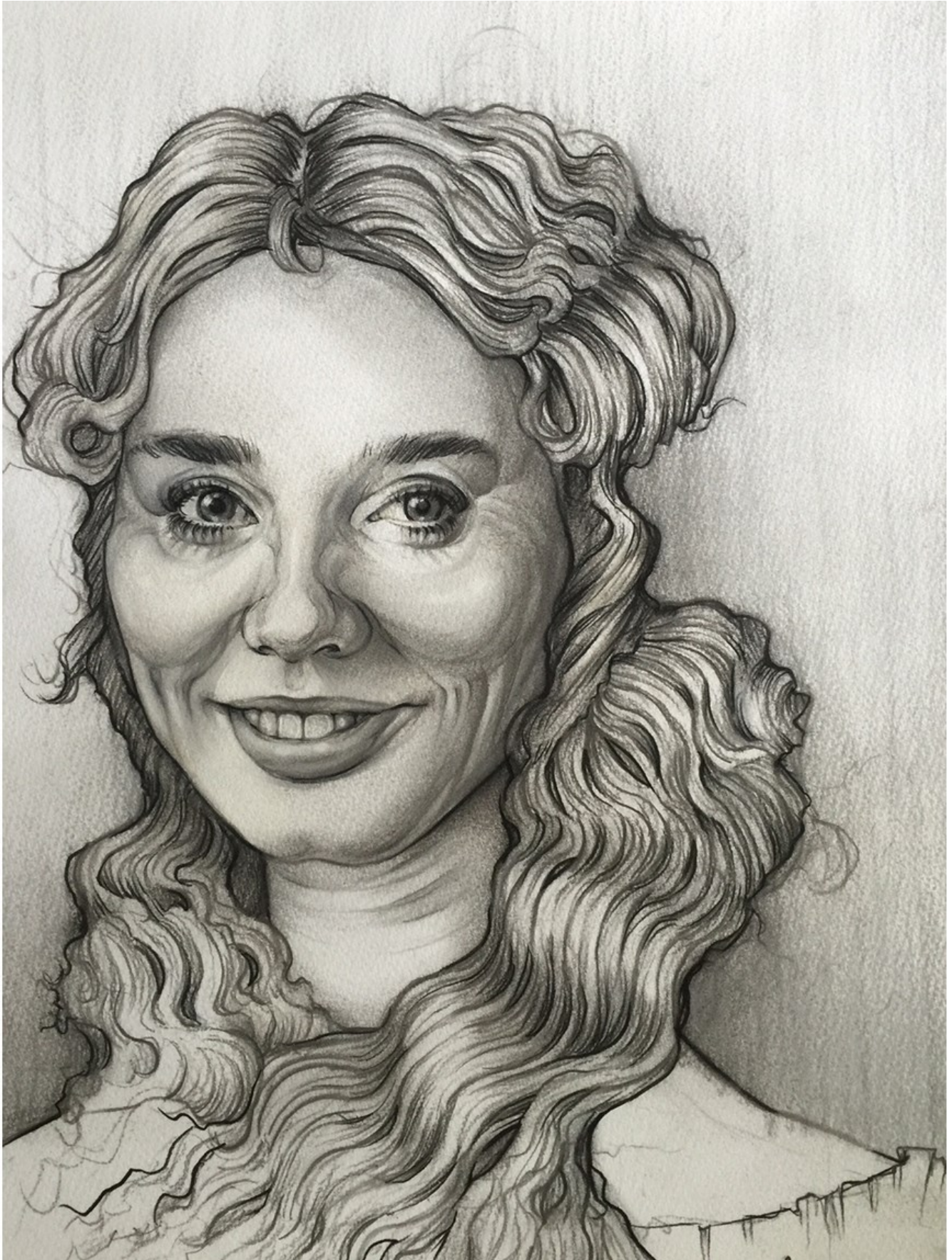
Directional hair study for 'They Shoot Pleistocene Epoch Megafauna Don't They?', 2015, chalk and charcoal on paper, 41 x 30 cm, 16.1 x 11.8 in

GALLERY POULSEN CONTEMPORARY FINE ARTS - COPENHAGEN