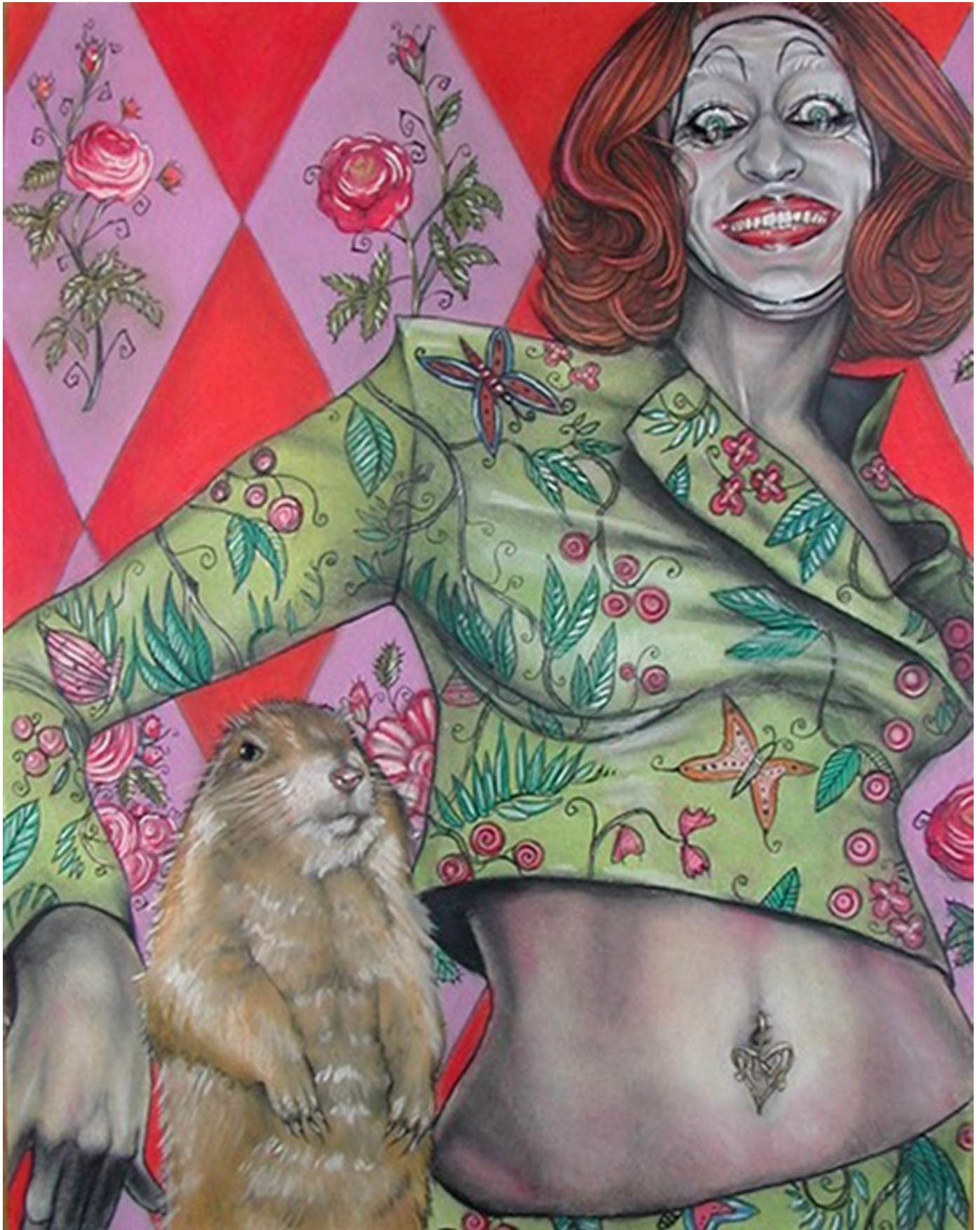
First Place - Souvenirs Oublies D'un Mime, 2013, pastel on paper, 58 x 43 cm, 23 x 17 in

GALLERY POULSEN CONTEMPORARY FINE ARTS - COPENHAGEN