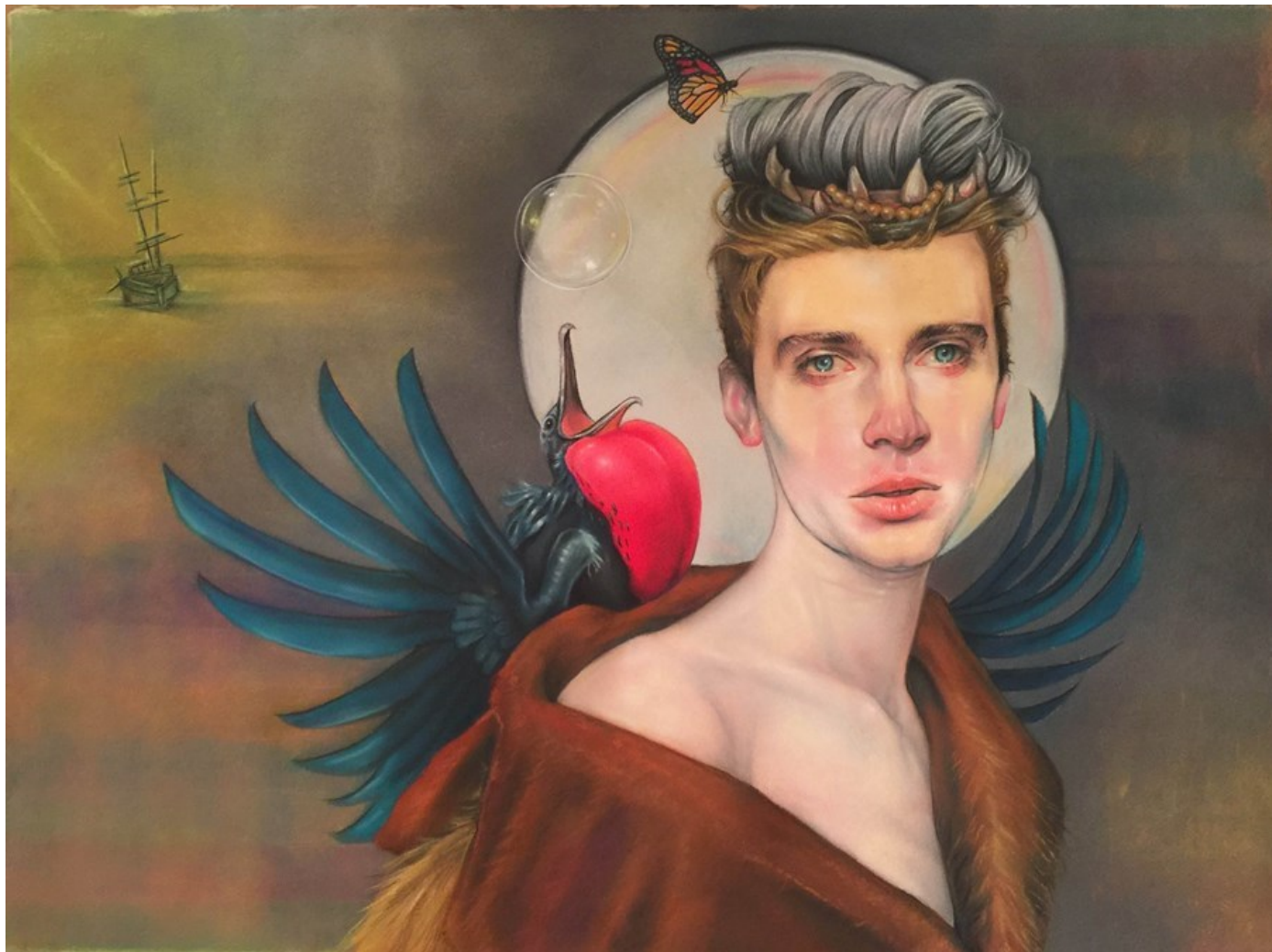
I'm singing a sad tune (And I know I've made it all a lie), 2016, pastel on paper, 57 x 76 cm, 22.5 x 30 in

GALLERY POULSEN CONTEMPORARY FINE ARTS - COPENHAGEN