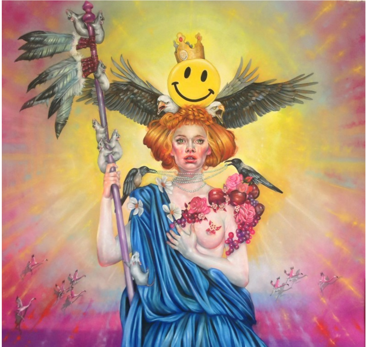
"Lady Liberty with the goo goo googly eyes" 2013, Pastel on paper, 132 x 137cm

GALLERY POULSEN CONTEMPORARY FINE ARTS - COPENHAGEN