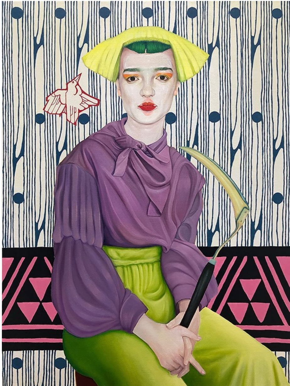
Portrait of a Polyculture Proctor, 2019, Oil on heringbone linen, 30 x 40 in, 76.2 x 101.6

GALLERY POULSEN CONTEMPORARY FINE ARTS - COPENHAGEN