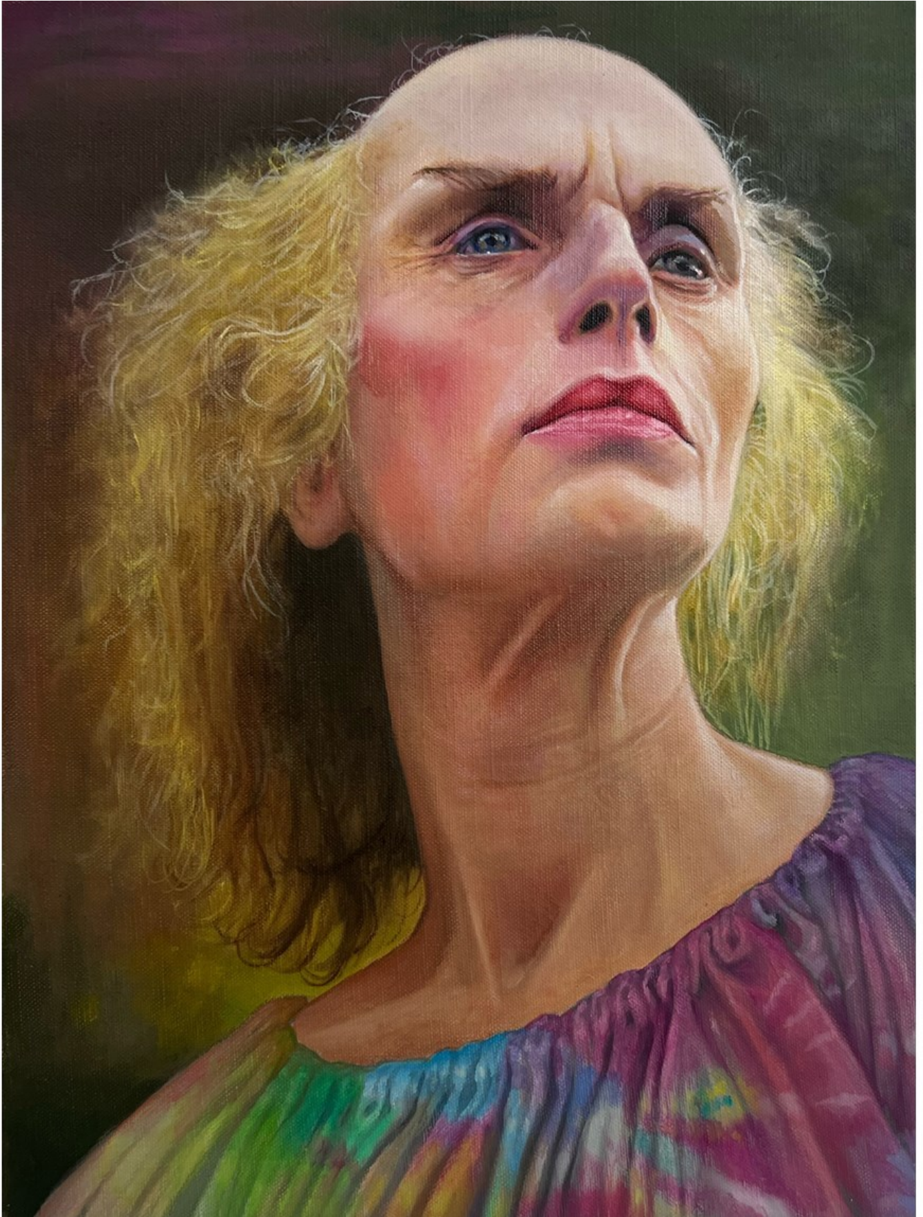
Barnaby Whitfield "What's coming is already on its way" 2024, Oil on canvas, 12 x 9 in, 30 x 23 cm

GALLERY POULSEN CONTEMPORARY FINE ARTS - COPENHAGEN