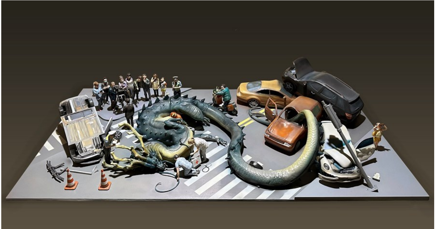
"The Death of Dragon" 2024, Acrylic on resin and metal, Edition of 3 + 1 AP, 20 x 99 x 56 cm, 8 x 39 x 22 in

GALLERY POULSEN CONTEMPORARY FINE ARTS - COPENHAGEN