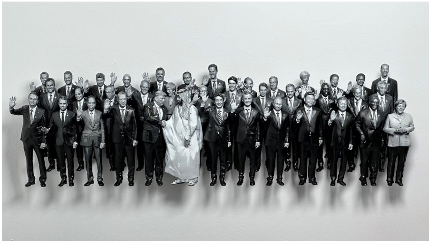
"Summit 2019" 2022, Acrylic on resin, metal, and wood, edition of 3 + 1 AP, 24 x 80 x 10 cm, 9,5 x 31,5 x 4 in

GALLERY POULSEN CONTEMPORARY FINE ARTS - COPENHAGEN