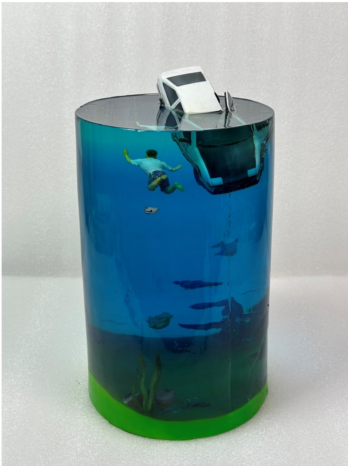
"Accident" 2024, Acrylic and resin, 33 x 19 x 19 cm, 13 x 7 x 7 in

GALLERY POULSEN CONTEMPORARY FINE ARTS - COPENHAGEN