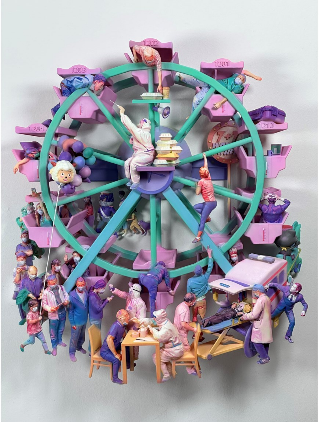
"Wonder Wheel" 2022, Acrylic on resin, metal, and wood, edition of 3 + 1 AP, 68 x 60 x 17 cm, 26,5 x 23,5 x 6,5 in

GALLERY POULSEN CONTEMPORARY FINE ARTS - COPENHAGEN