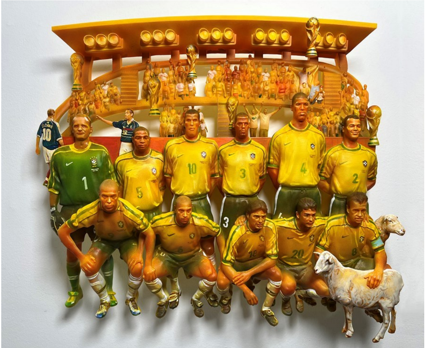
"Summer in France 1998" 2022, Acrylic on resin, wood and metal, edition of 3 + 1 AP, 60 x 51 x 14 cm, 23,5 x 20 x 5,5 in

GALLERY POULSEN CONTEMPORARY FINE ARTS - COPENHAGEN