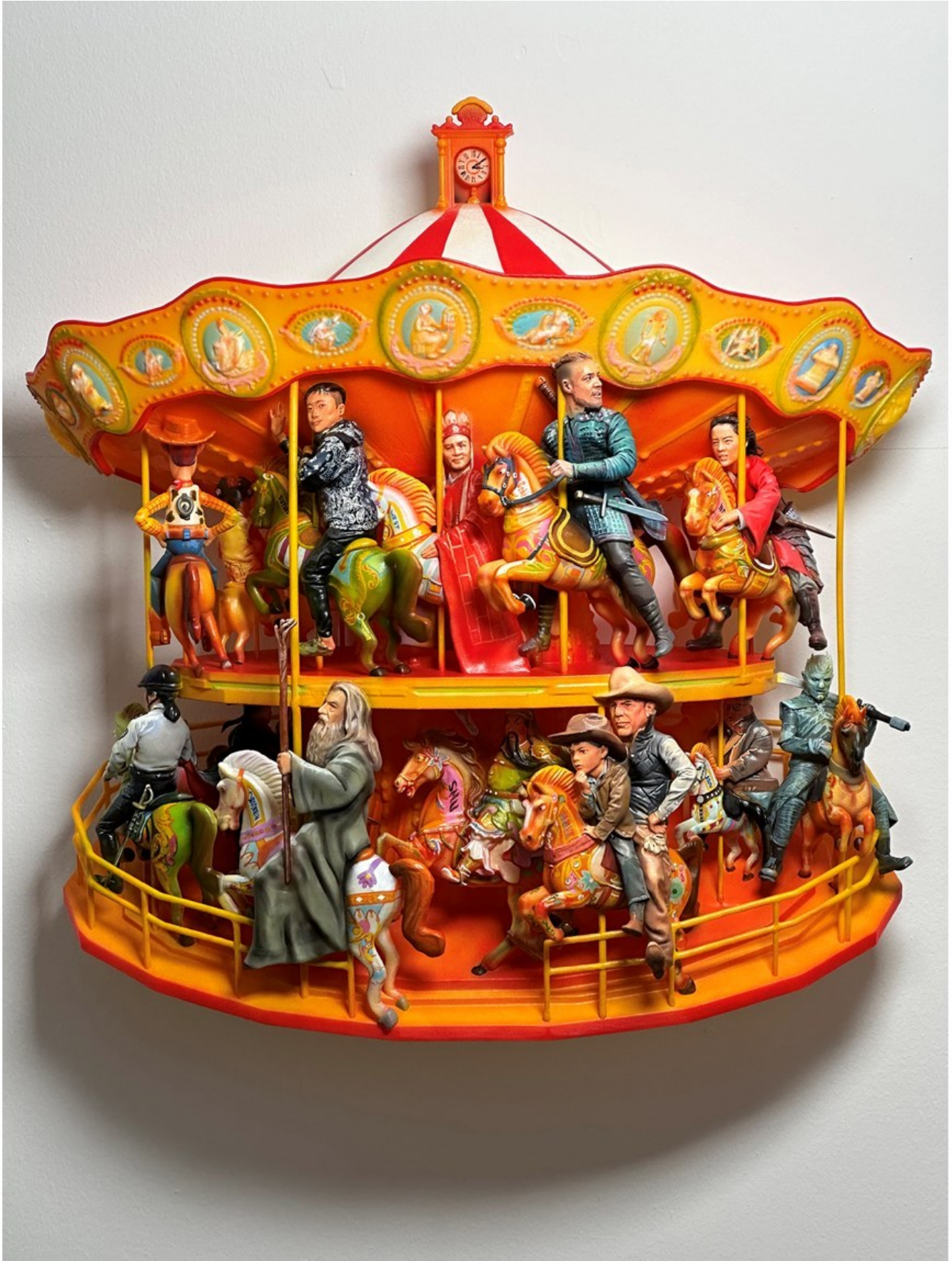
"Destiny is All" 2022, Acrylic on resin, metal, and wood, edition of 3 + 1 AP, 61 x 60 x 21 cm, 24 x 23,5 x 8 in

GALLERY POULSEN CONTEMPORARY FINE ARTS - COPENHAGEN