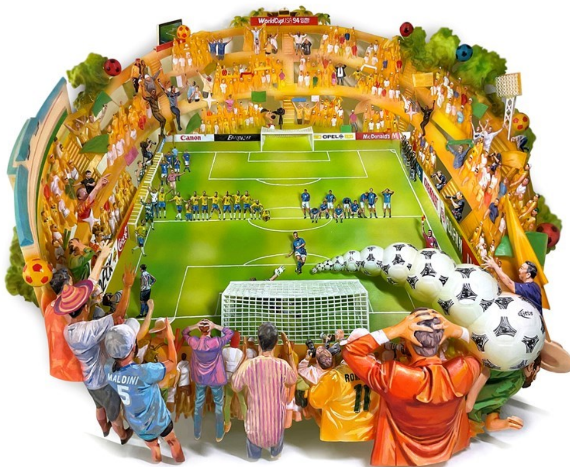
"Rose Bowl" 2022, Acrylic on resin, wood and metal, edition of 3 + 1 AP, 65 x 80 x 18 cm, 25,5 x 31,5 x 7 in

GALLERY POULSEN CONTEMPORARY FINE ARTS - COPENHAGEN