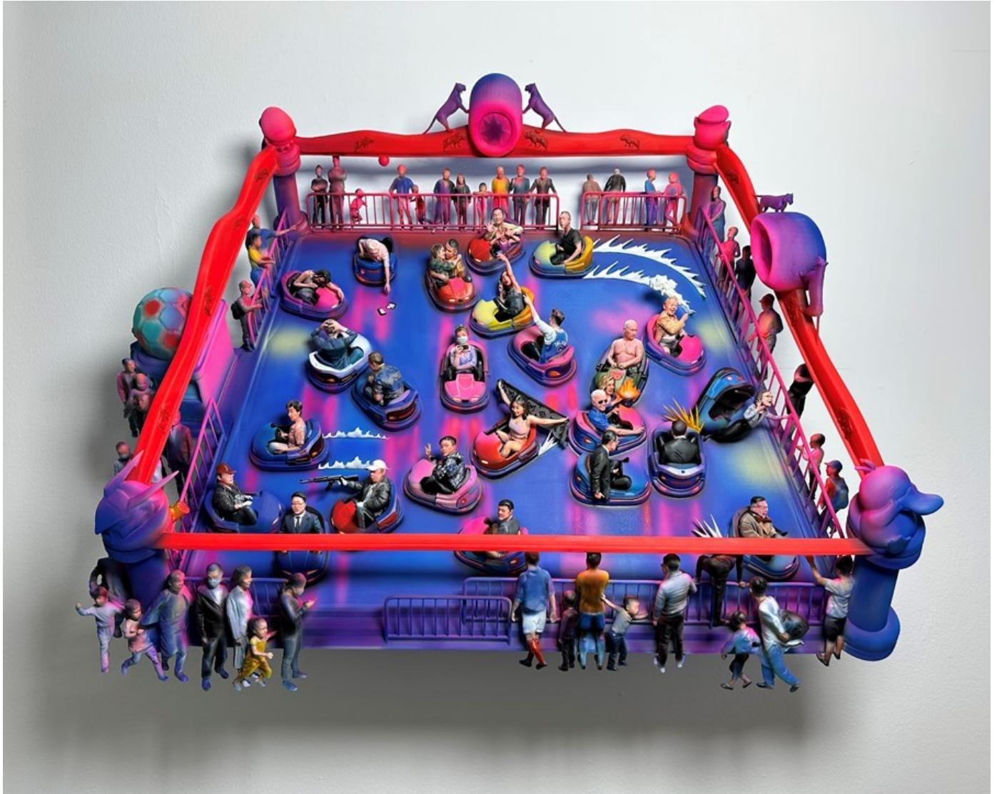
"Serial Game" 2022, Acrylic on resin, metal, and wood, edition of 3 + 1 AP, 63 x 80 x 25 cm, 25 x 31,5 x 10 in

GALLERY POULSEN CONTEMPORARY FINE ARTS - COPENHAGEN