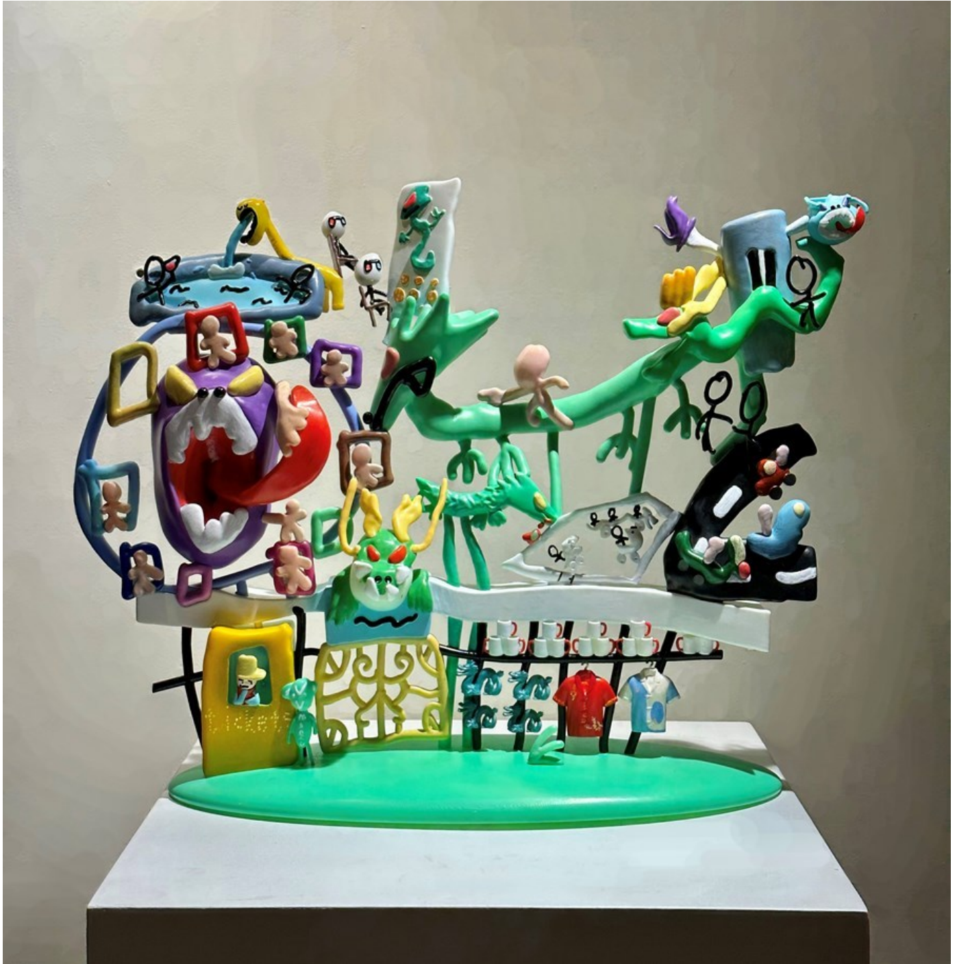
"Dragonland" 2024, Acrylic on resin, Edition of 3 + 1 AP, 41 x 51 x 18 cm, 16 x 20 x 7 in

GALLERY POULSEN CONTEMPORARY FINE ARTS - COPENHAGEN