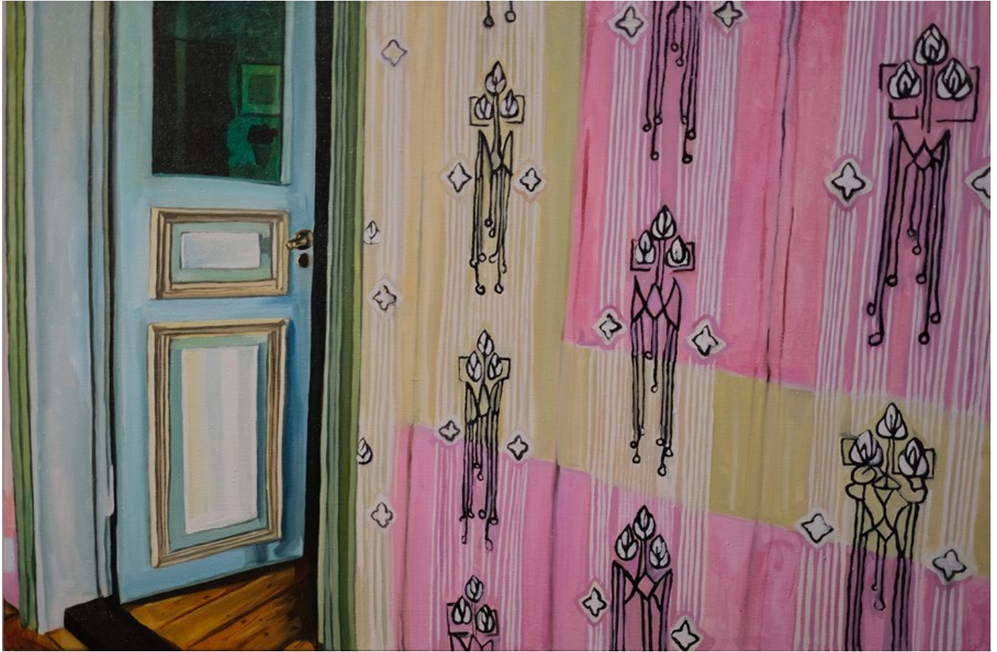
"The Past is Present" 2023, Oil on linen, 60 x 90 cm, 23,5 x 35,5 in

GALLERY POULSEN CONTEMPORARY FINE ARTS - COPENHAGEN