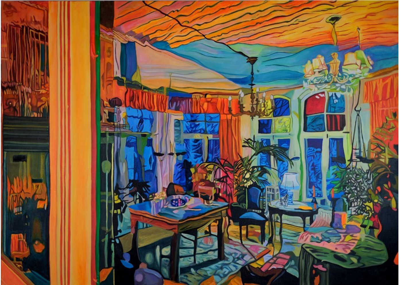
"House of Water" 2024, Oil on linen, 143 x 198 cm, 56,3 x 78 in

GALLERY POULSEN CONTEMPORARY FINE ARTS - COPENHAGEN