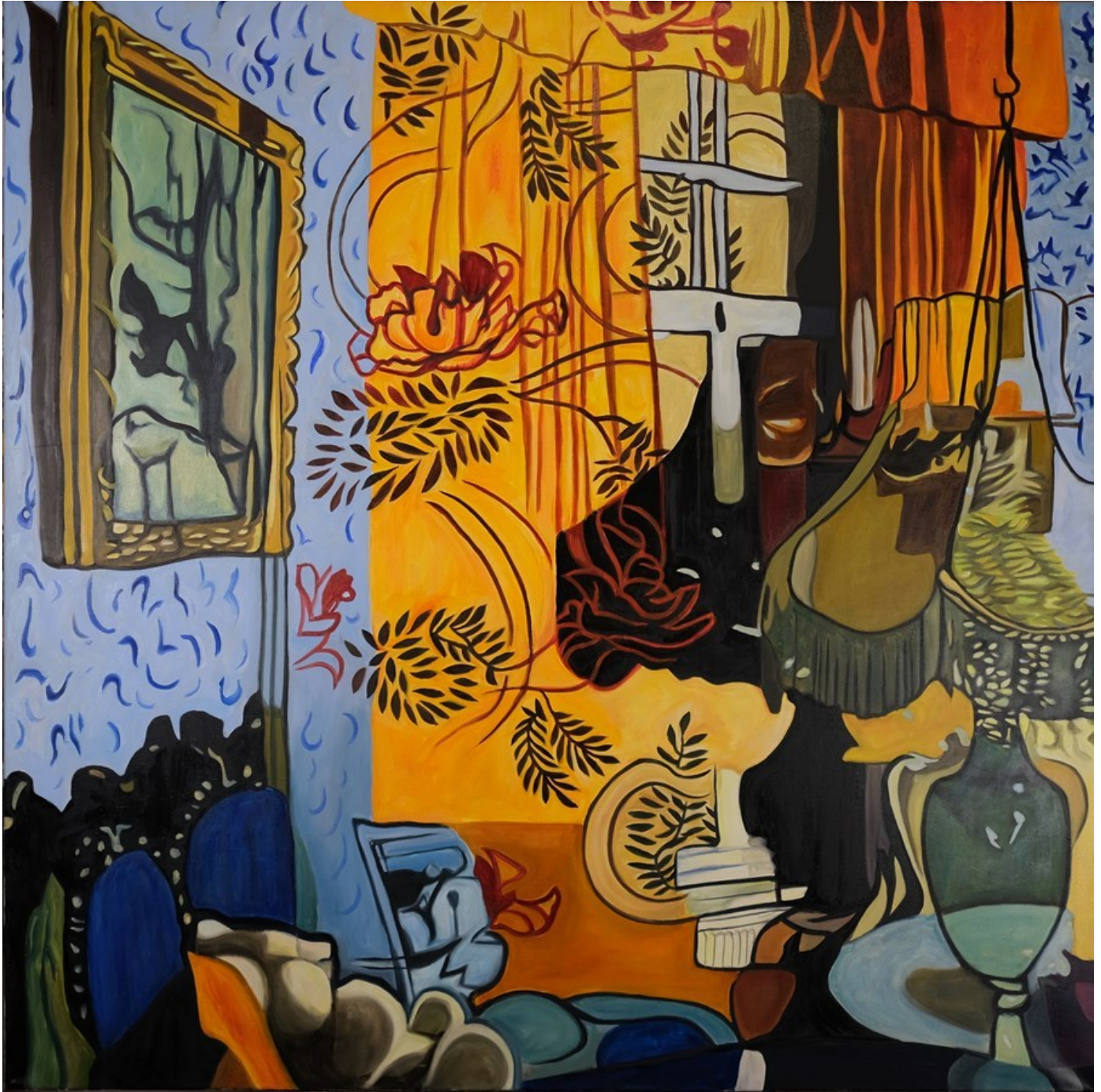
"House of Free" 2024, Oil on linen, 128 x 128 cm, 50,4 x 50,4 in

GALLERY POULSEN CONTEMPORARY FINE ARTS - COPENHAGEN