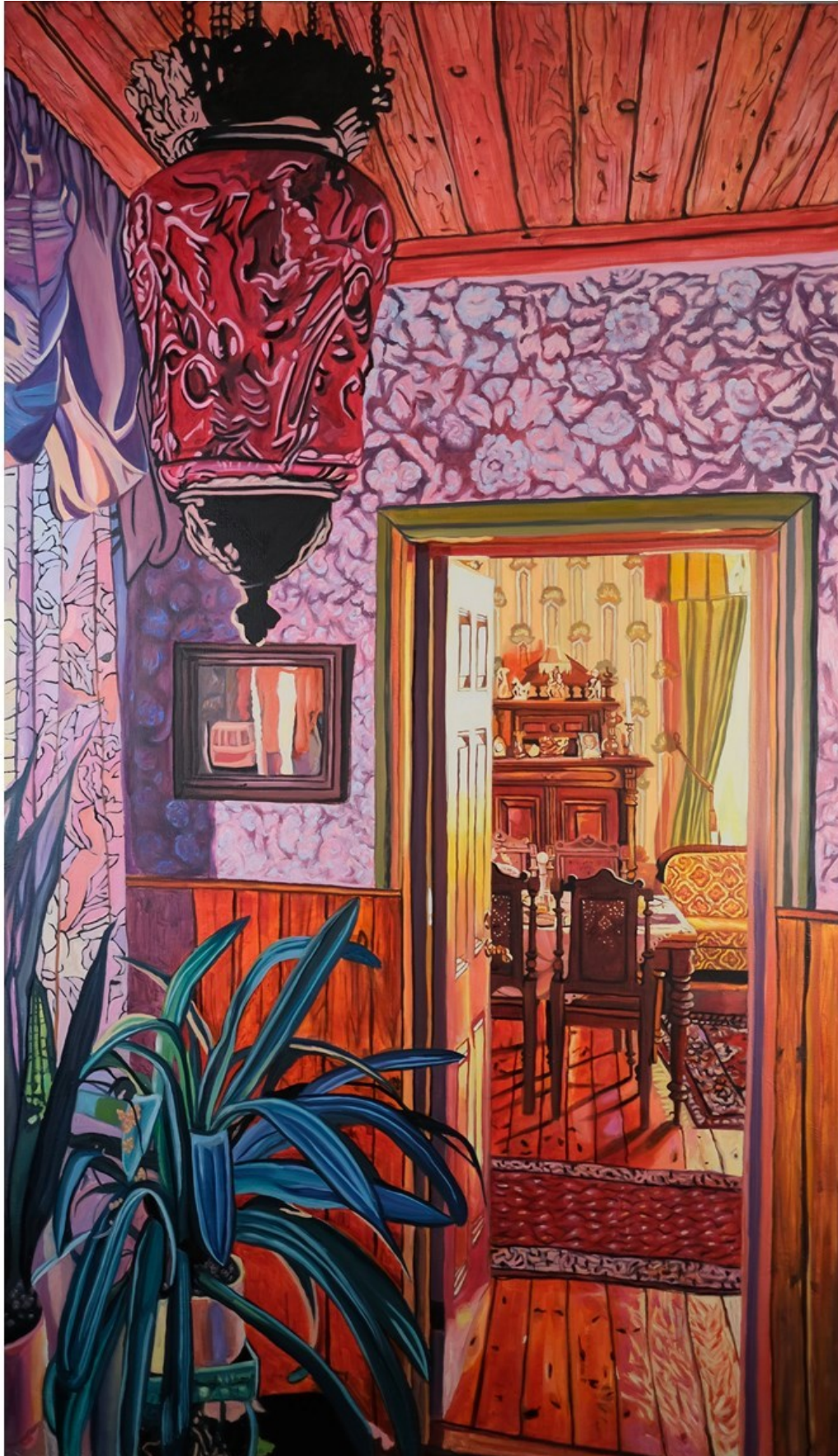
"House of Sun" 2024, Oil on linen, 136 x 80cm, 53,5 x 31,5 in

GALLERY POULSEN CONTEMPORARY FINE ARTS - COPENHAGEN