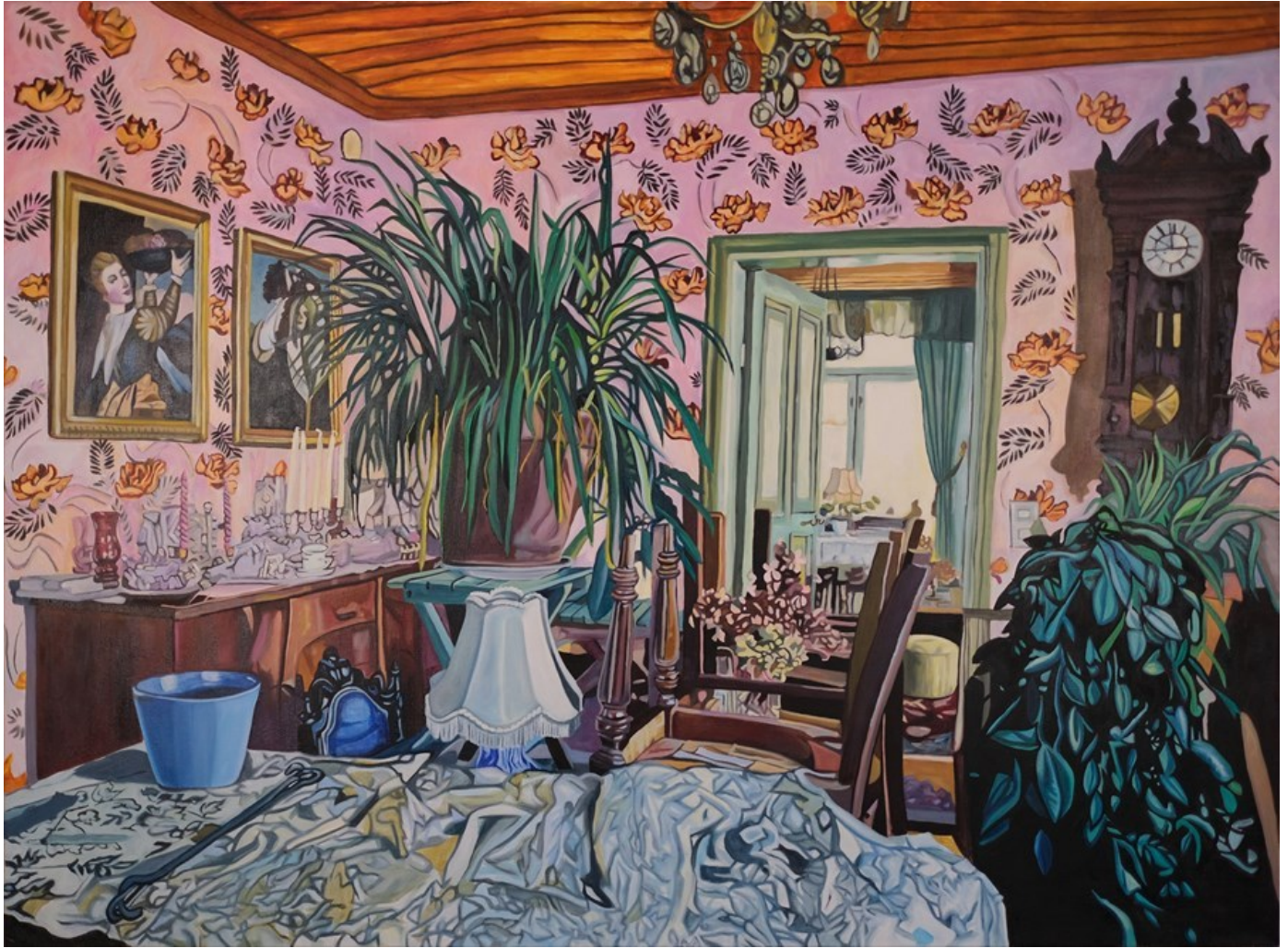
"House of Change" 2024, Oil on linen, 142 x 192 cm, 56 x 75,6 in

GALLERY POULSEN CONTEMPORARY FINE ARTS - COPENHAGEN