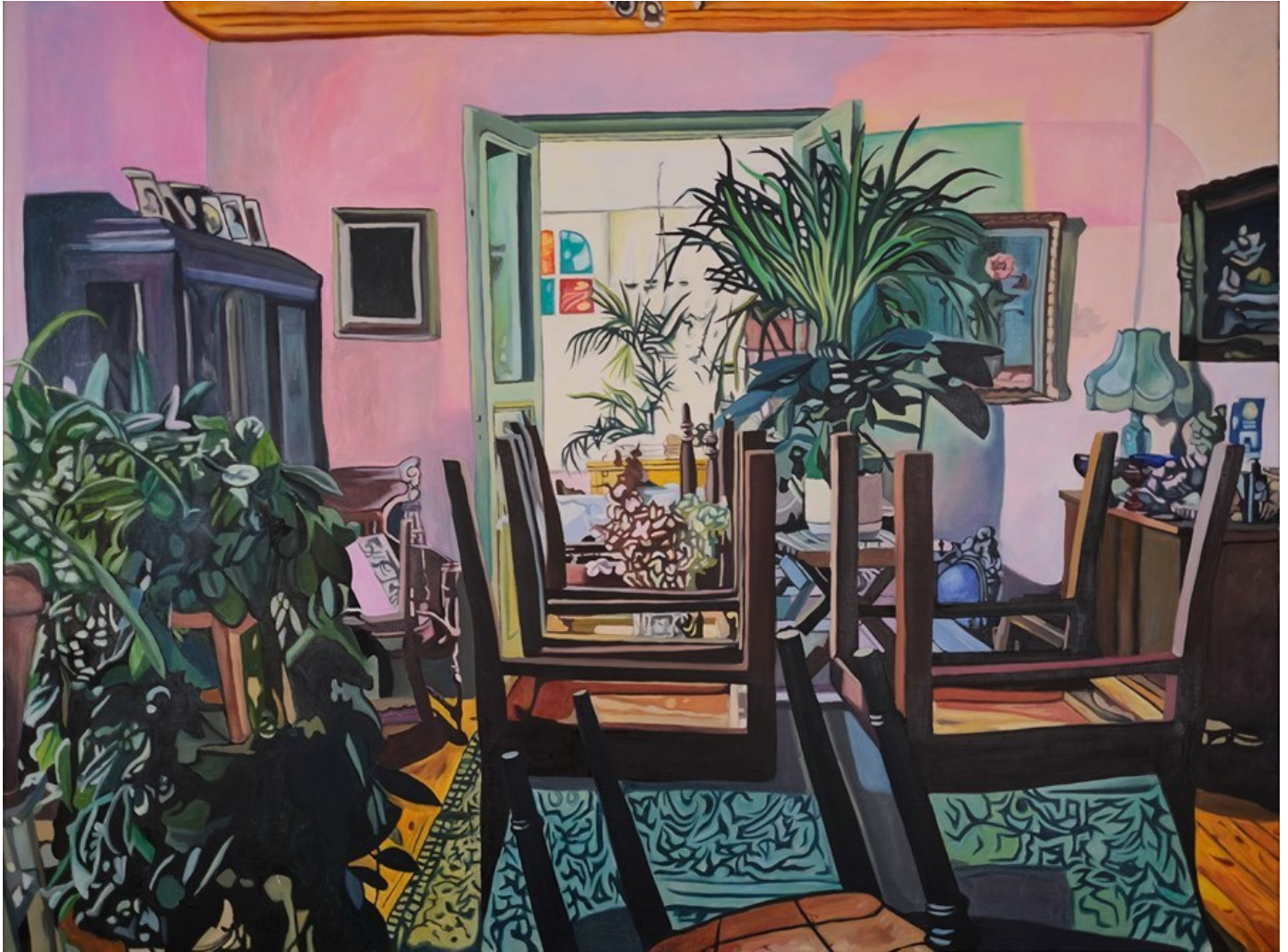
"House of Earth" 2024, Oil on linen, 105 x 140 cm, 41,3 x 55 in

GALLERY POULSEN CONTEMPORARY FINE ARTS - COPENHAGEN