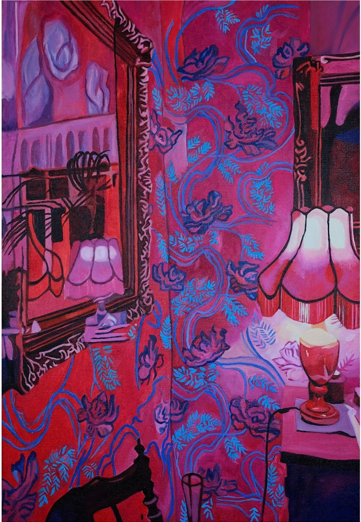
"Empty House" 2023, Oil on linen, 89 x 60 cm, 35 x 23,5 in

GALLERY POULSEN CONTEMPORARY FINE ARTS - COPENHAGEN