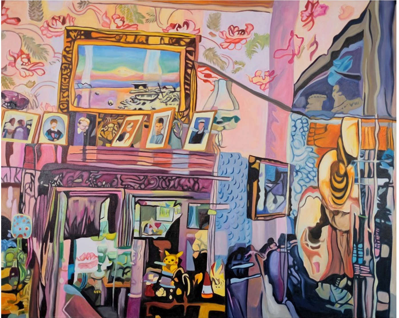
"House of Play" 2024, Oil on linen, 119 x 147 cm, 46,9 x 57,9 in

GALLERY POULSEN CONTEMPORARY FINE ARTS - COPENHAGEN