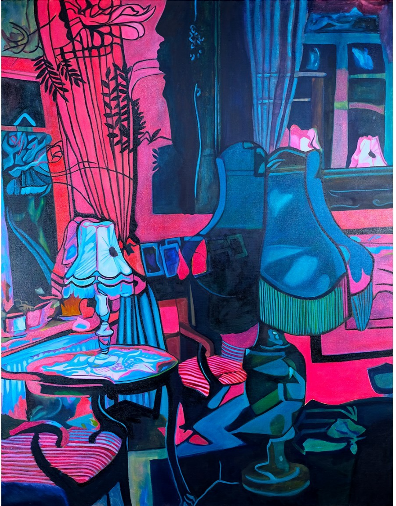
"Cosmic House" 2023, Oil on linen - 163 x 124 cm, 64 x 49 in, $7,500 (+ 5% Danish art tax)

GALLERY POULSEN CONTEMPORARY FINE ARTS - COPENHAGEN