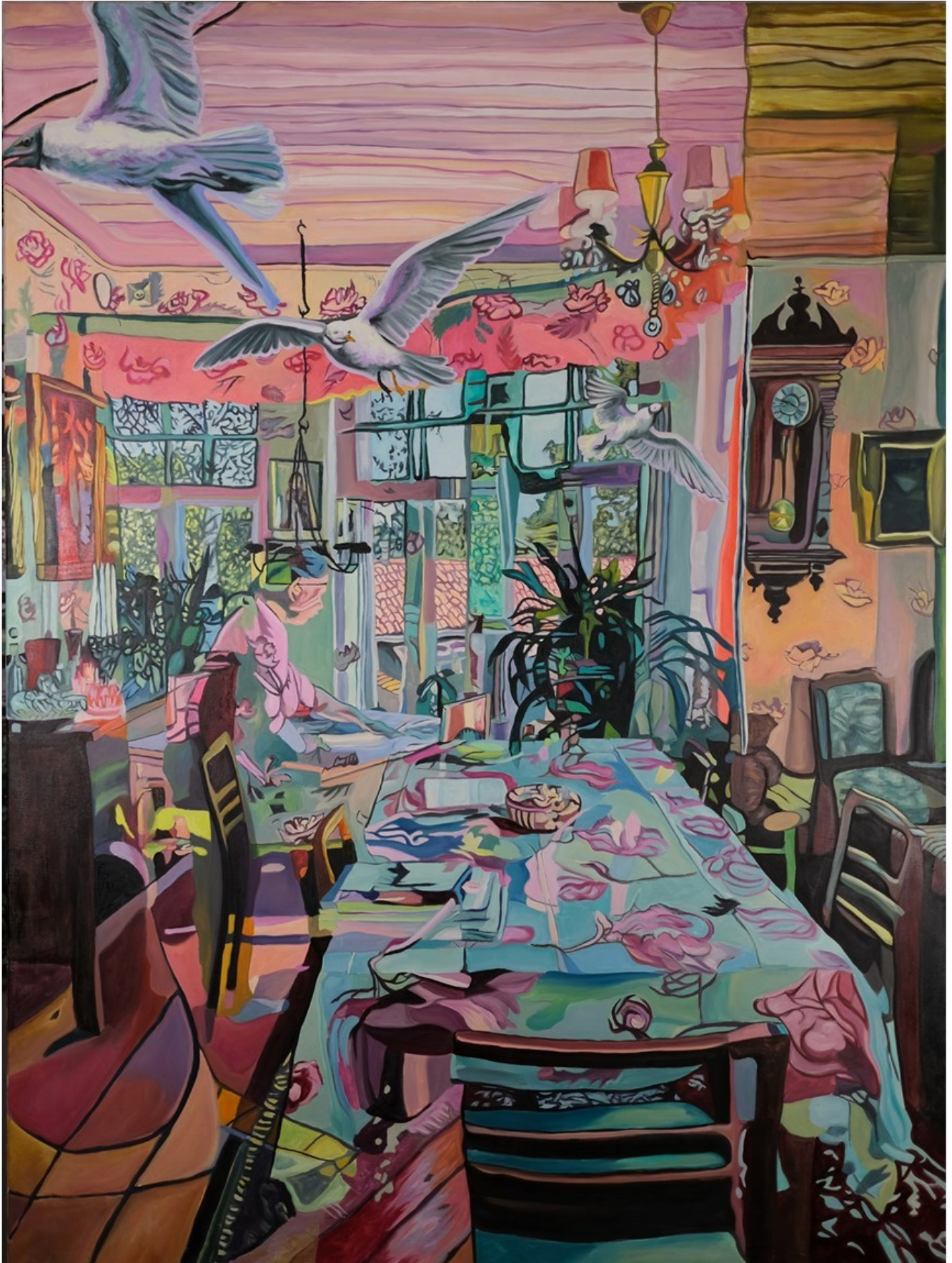
"House of Air" 2024, Oil on linen, 160 x 120 cm, 63 x 47,2 in

GALLERY POULSEN CONTEMPORARY FINE ARTS - COPENHAGEN