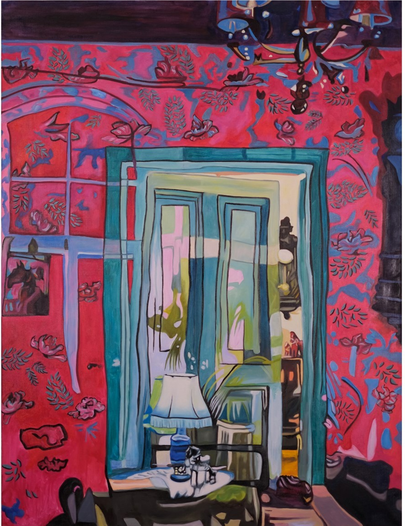
"House of Night" 2024, Oil on linen, 137 x 103 cm, 54 x 40,5 in

GALLERY POULSEN CONTEMPORARY FINE ARTS - COPENHAGEN