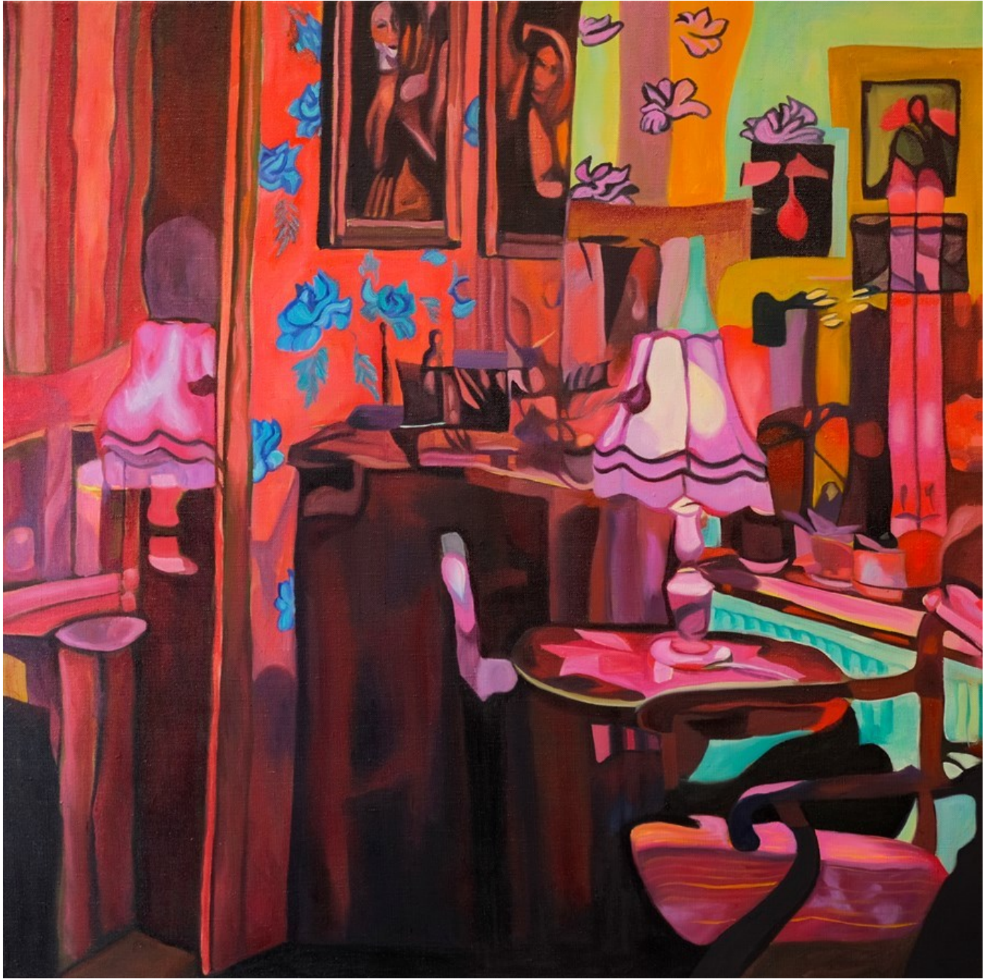
"Private Eye" 2023, Oil on linen, 90 x 90 cm, 35,5 x 35,5 in

GALLERY POULSEN CONTEMPORARY FINE ARTS - COPENHAGEN