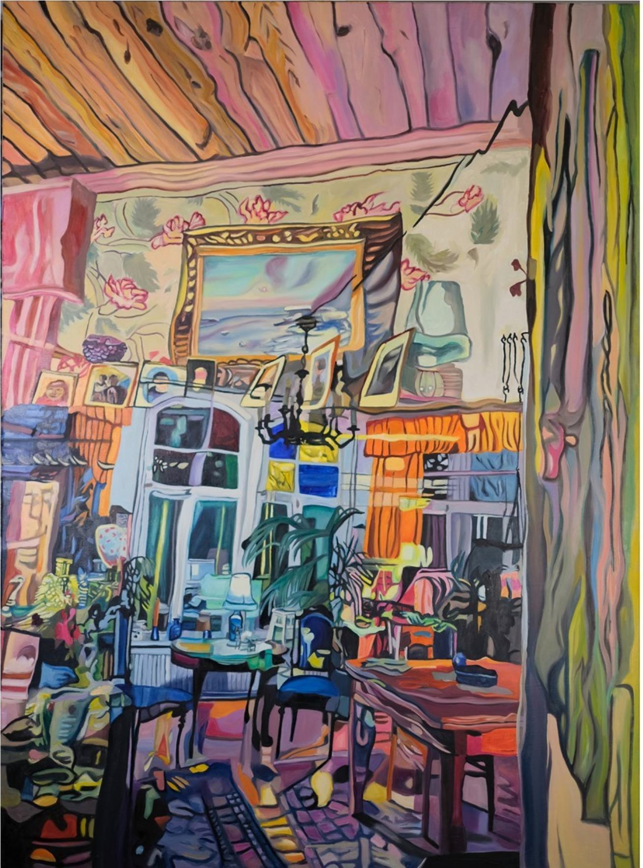
"House of Limitless" 2024, Oil on linen, 134 x 100 cm, 52,8 x 39,4 in

GALLERY POULSEN CONTEMPORARY FINE ARTS - COPENHAGEN