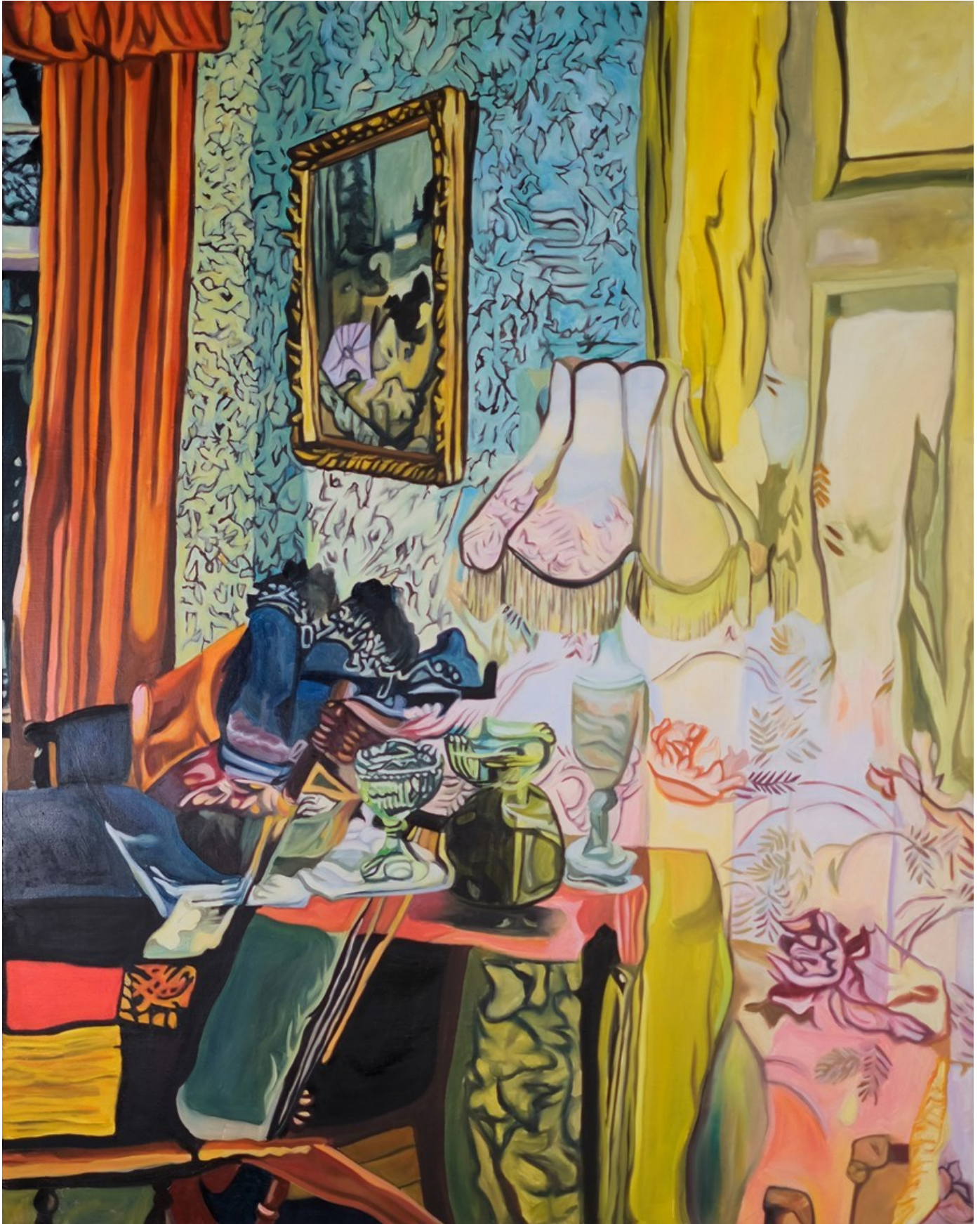
"House of Light" 2024, Oil on linen, 120 x 96 cm, 47,2 x 37,8 in

GALLERY POULSEN CONTEMPORARY FINE ARTS - COPENHAGEN