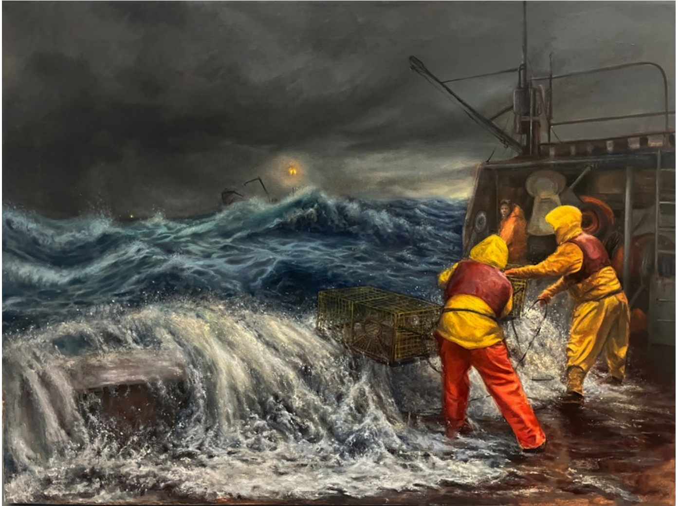
"Here Today, Gone Tomorrow" 2021, Oil on canvas, 91,5 x 122 cm, 36 x 48 in

GALLERY POULSEN CONTEMPORARY FINE ARTS - COPENHAGEN