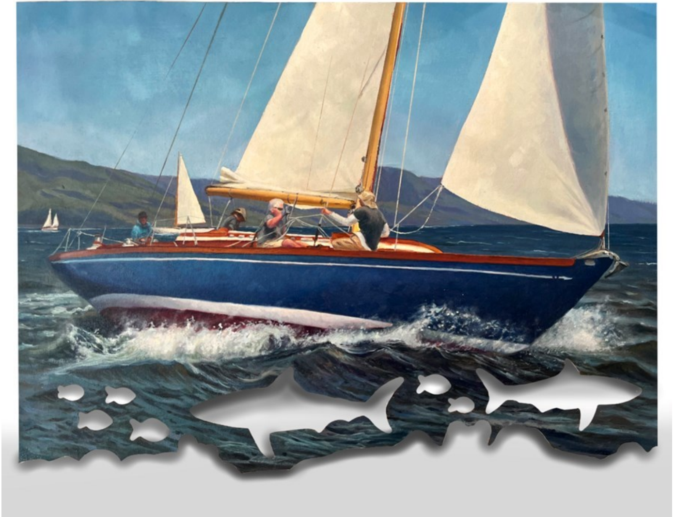
"The Calling of June" 2024, Oil on shaped canvas, mounted to panel, 52 x 76,2 cm, 20,5 x 30 in

GALLERY POULSEN CONTEMPORARY FINE ARTS - COPENHAGEN