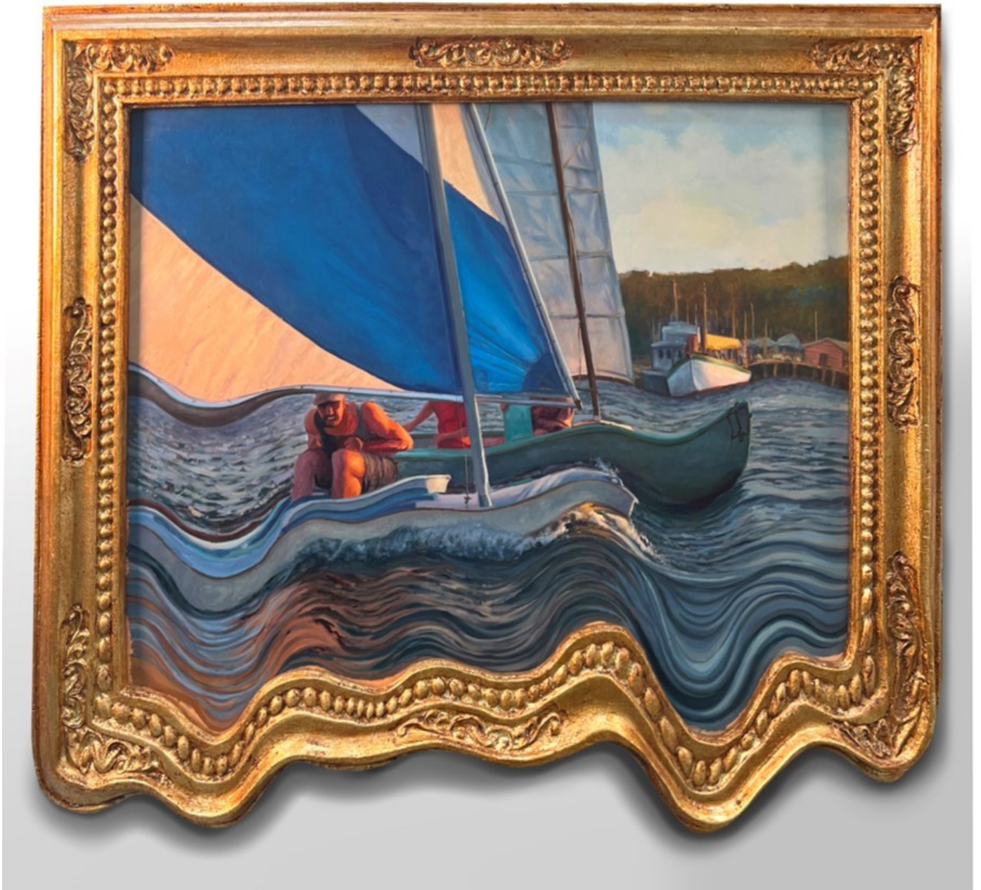
"Summer Sail" 2024, Oil on panel with custom-made frame, 69,2 x 74 cm, 27,3 x 29,1 in

GALLERY POULSEN CONTEMPORARY FINE ARTS - COPENHAGEN