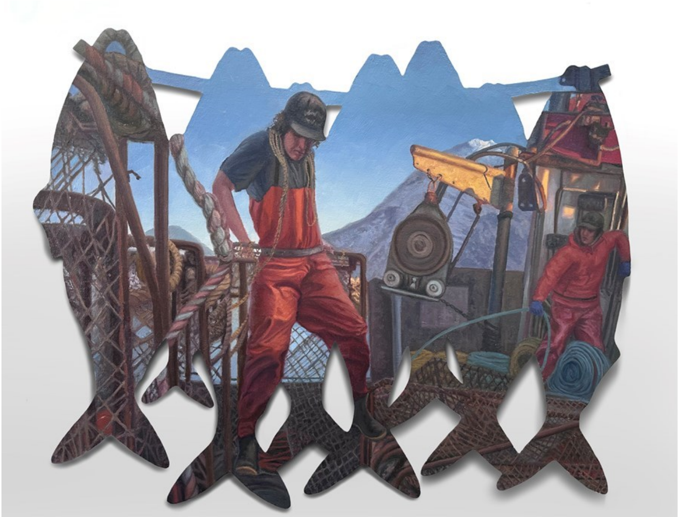
"Winter Coast" 2024, Oil on shaped canvas, mounted to panel, 54,6 x 70,5 cm, 21,5 x 27,8 in

GALLERY POULSEN CONTEMPORARY FINE ARTS - COPENHAGEN