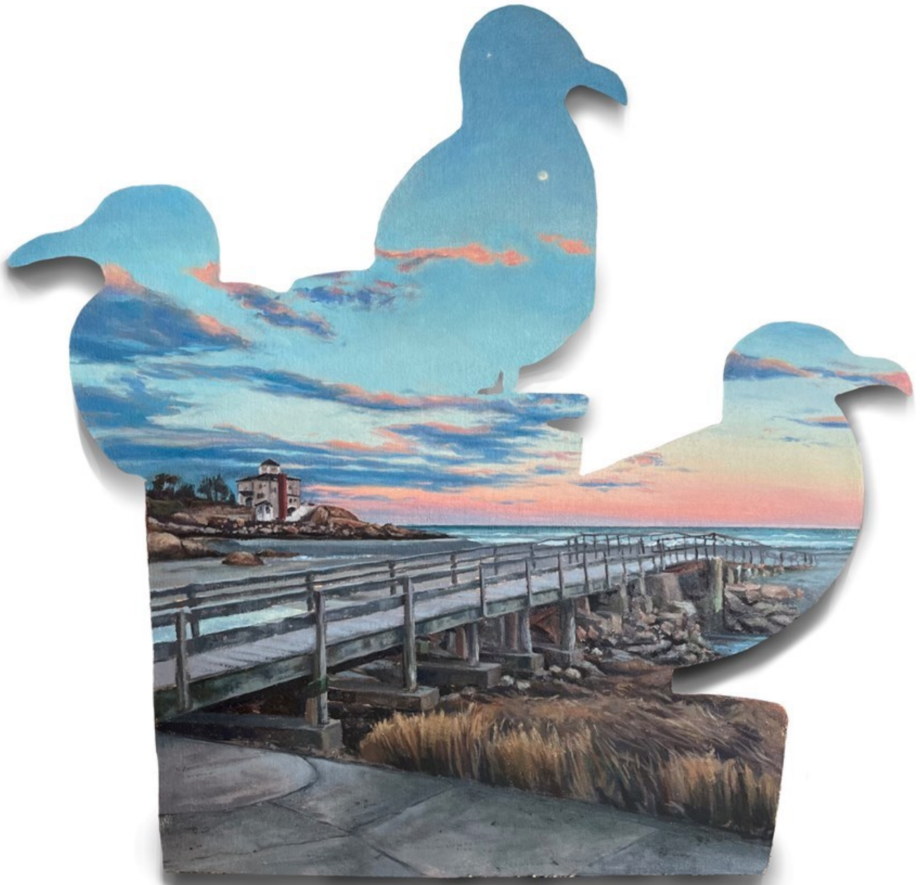
"Good Harbor Beach" 2023, Oil on shaped canvas, mounted to panel, 59,4 x 62,2 cm, 23,4 x 24,5 in

GALLERY POULSEN CONTEMPORARY FINE ARTS - COPENHAGEN