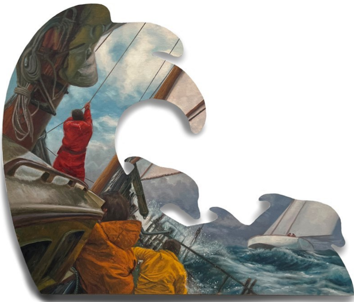
"Kicking up" 2024, Oil on shaped canvas, mounted to panel, 59,7 x 75,6 cm, 23,5 x 29,8 in

GALLERY POULSEN CONTEMPORARY FINE ARTS - COPENHAGEN