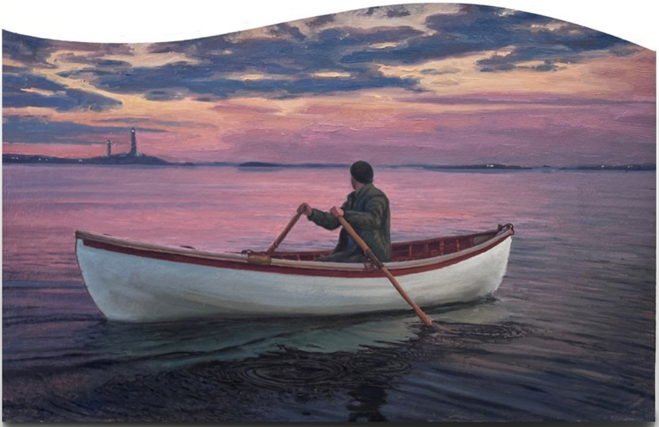
"The Oarsman" 2024, Oil on shaped canvas, mounted to panel, 48,3 x 76,5 cm, 19 x 30,1 in

GALLERY POULSEN CONTEMPORARY FINE ARTS - COPENHAGEN