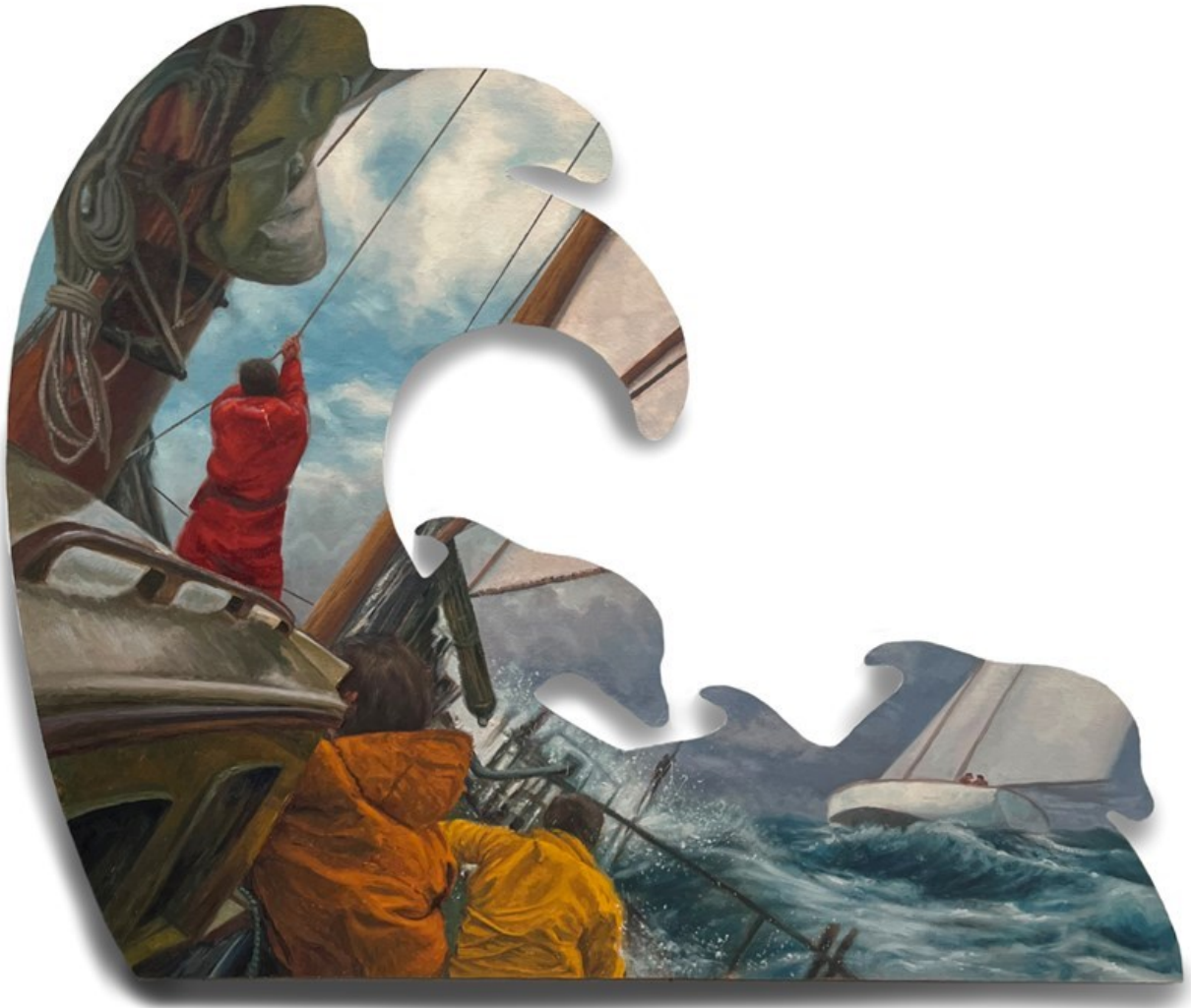
"Kicking up" 2024, Oil on shaped canvas, mounted to panel, 59,7 x 75,6 cm, 23,5 x 29,8 in

GALLERY POULSEN CONTEMPORARY FINE ARTS - COPENHAGEN