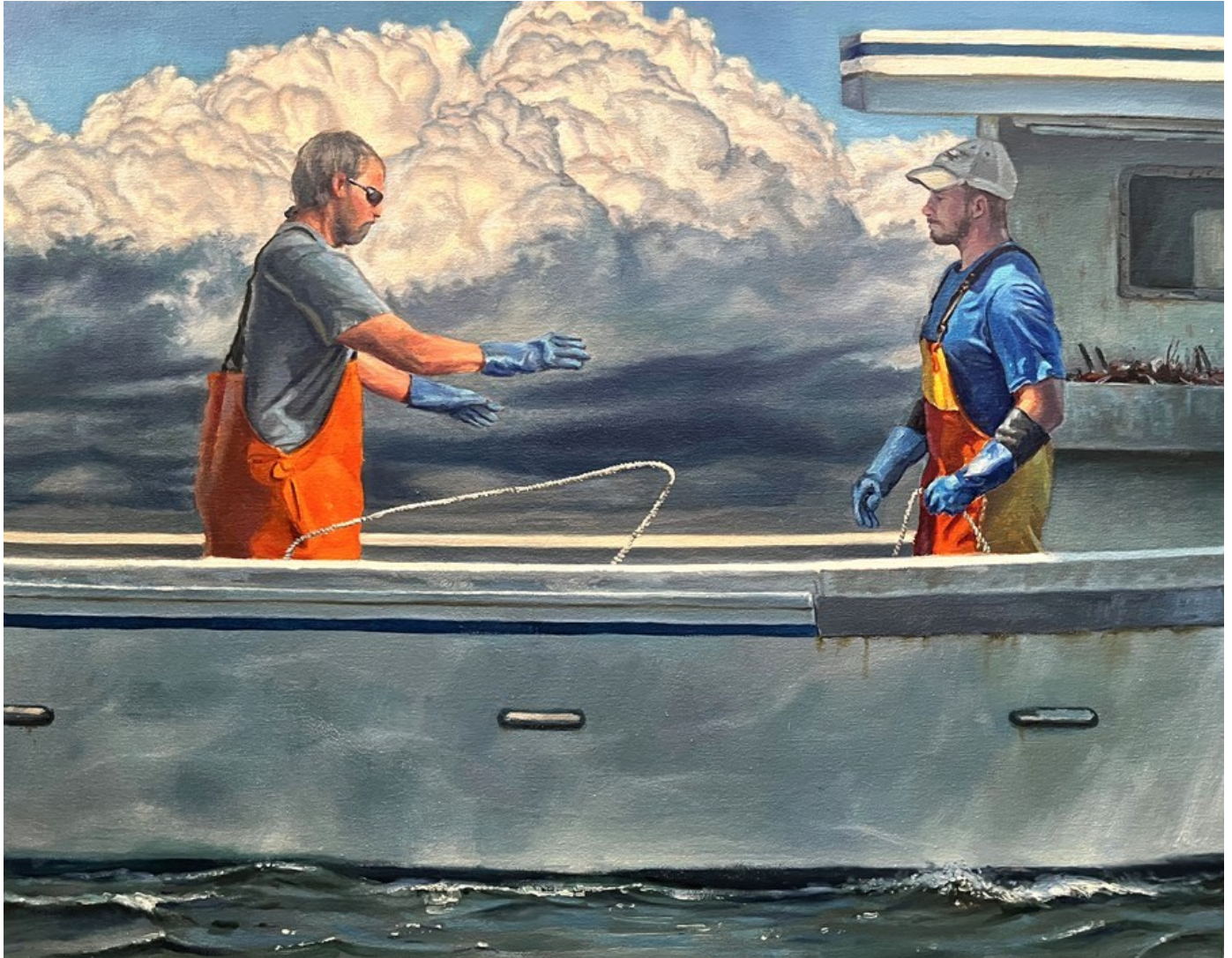
"The Last Trawl" 2022, Oil on canvas, 61 x 76 cm, 24 x 30 in

GALLERY POULSEN CONTEMPORARY FINE ARTS - COPENHAGEN