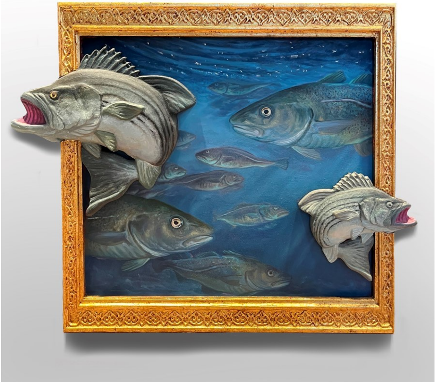
"Gone Fishing" 2024, Oil on shaped panel with custom-made frame, 58 x 70,2 cm, 22,9 x 27,6 in

GALLERY POULSEN CONTEMPORARY FINE ARTS - COPENHAGEN