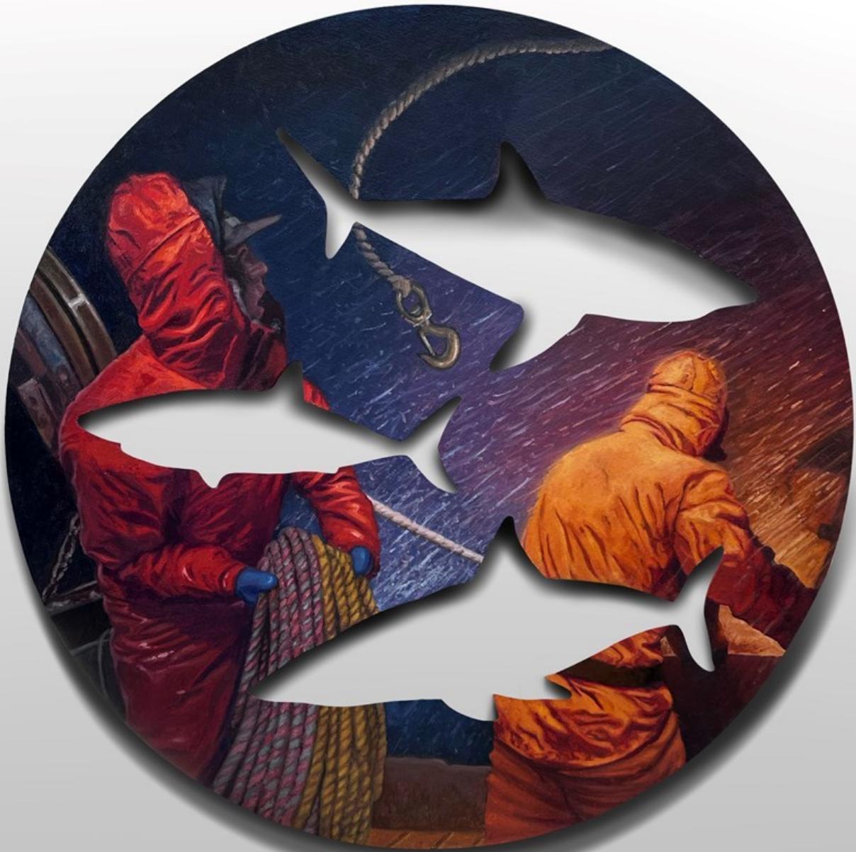
"Hook, Line and Sink" 2024, Oil on shaped canvas, mounted to panel, 73,7 cm, 29 in diameter

GALLERY POULSEN CONTEMPORARY FINE ARTS - COPENHAGEN