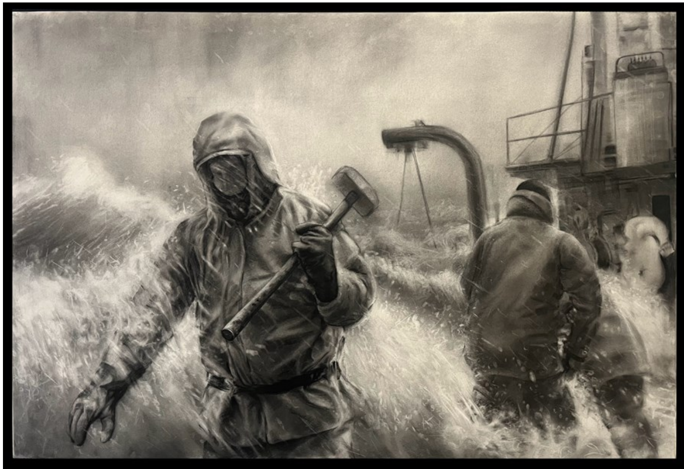
"Ice Breaker" 2022, Charcoal on paper, 91,5 x 139,5 cm, 36 x 55 in

GALLERY POULSEN CONTEMPORARY FINE ARTS - COPENHAGEN