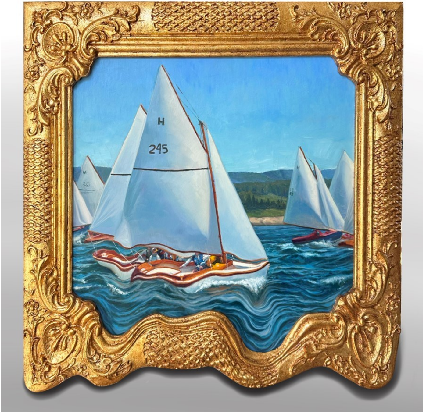
"The Headwind" 2024, Oil on panel with custom-made frame, 58,4 x 58,4 cm, 23 x 23 in

GALLERY POULSEN CONTEMPORARY FINE ARTS - COPENHAGEN