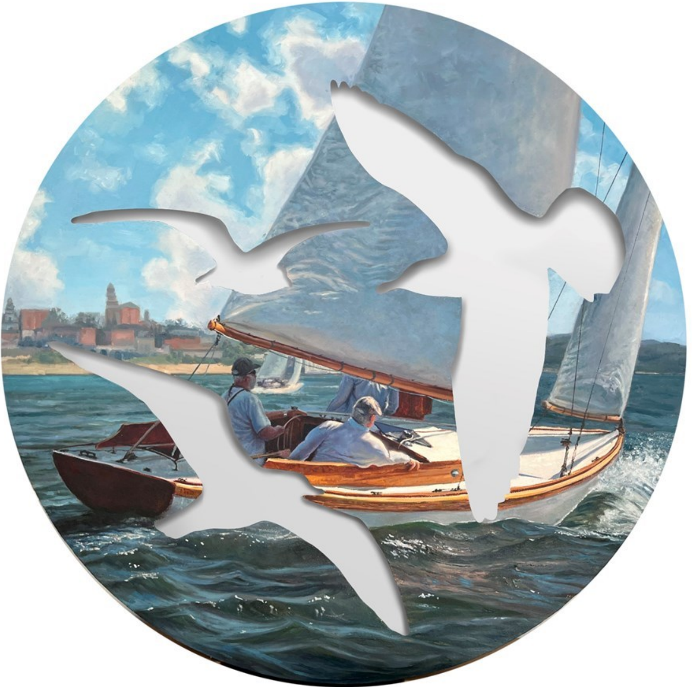
"Gloucester Harbor Sail" 2024, Oil on shaped canvas, mounted to panel, 73,7 cm, 29 in diameter

GALLERY POULSEN CONTEMPORARY FINE ARTS - COPENHAGEN