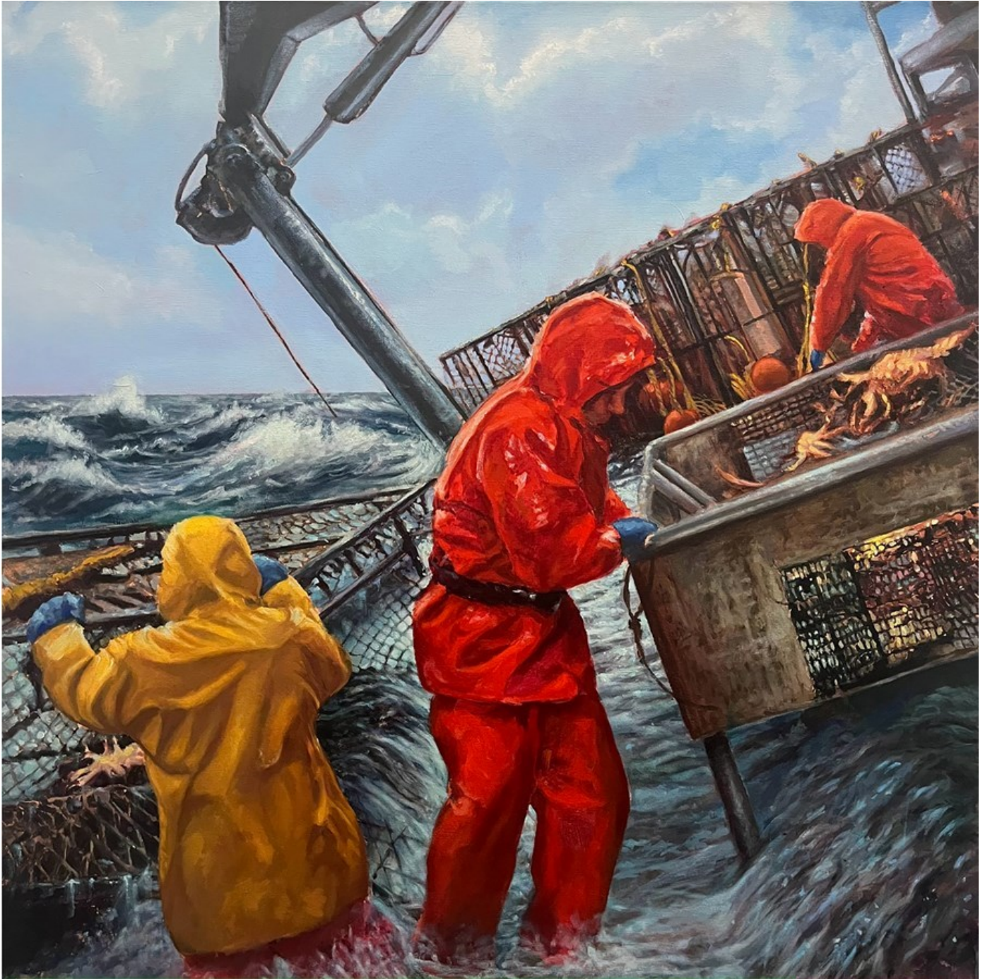
"Before the Storm" 2022, Oil and acrylic on canvas, 91,5 x 91,5 cm, 36 x 36 in

GALLERY POULSEN CONTEMPORARY FINE ARTS - COPENHAGEN