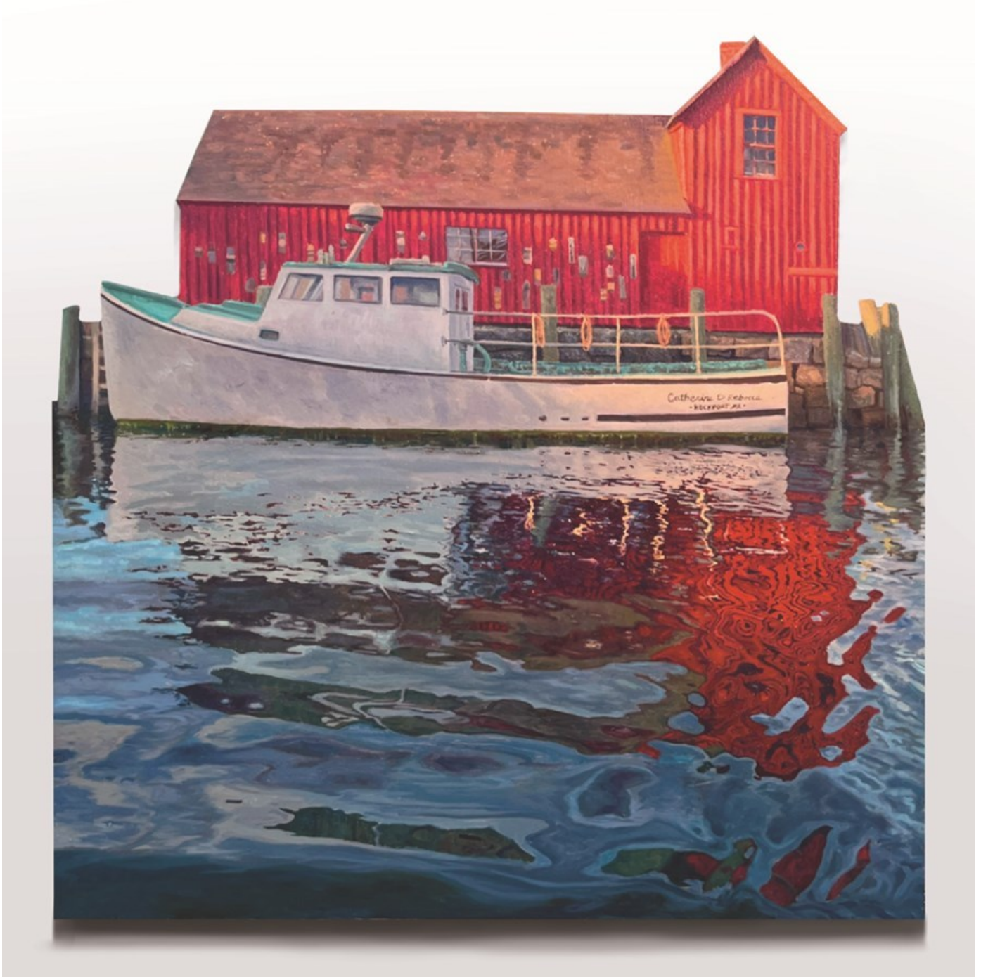
Ryan Davis "Motif #1" 2024, Oil on shaped canvas, mounted to panel, 73 x 69,9 cm, 28,8 x 27,5 in

GALLERY POULSEN CONTEMPORARY FINE ARTS - COPENHAGEN