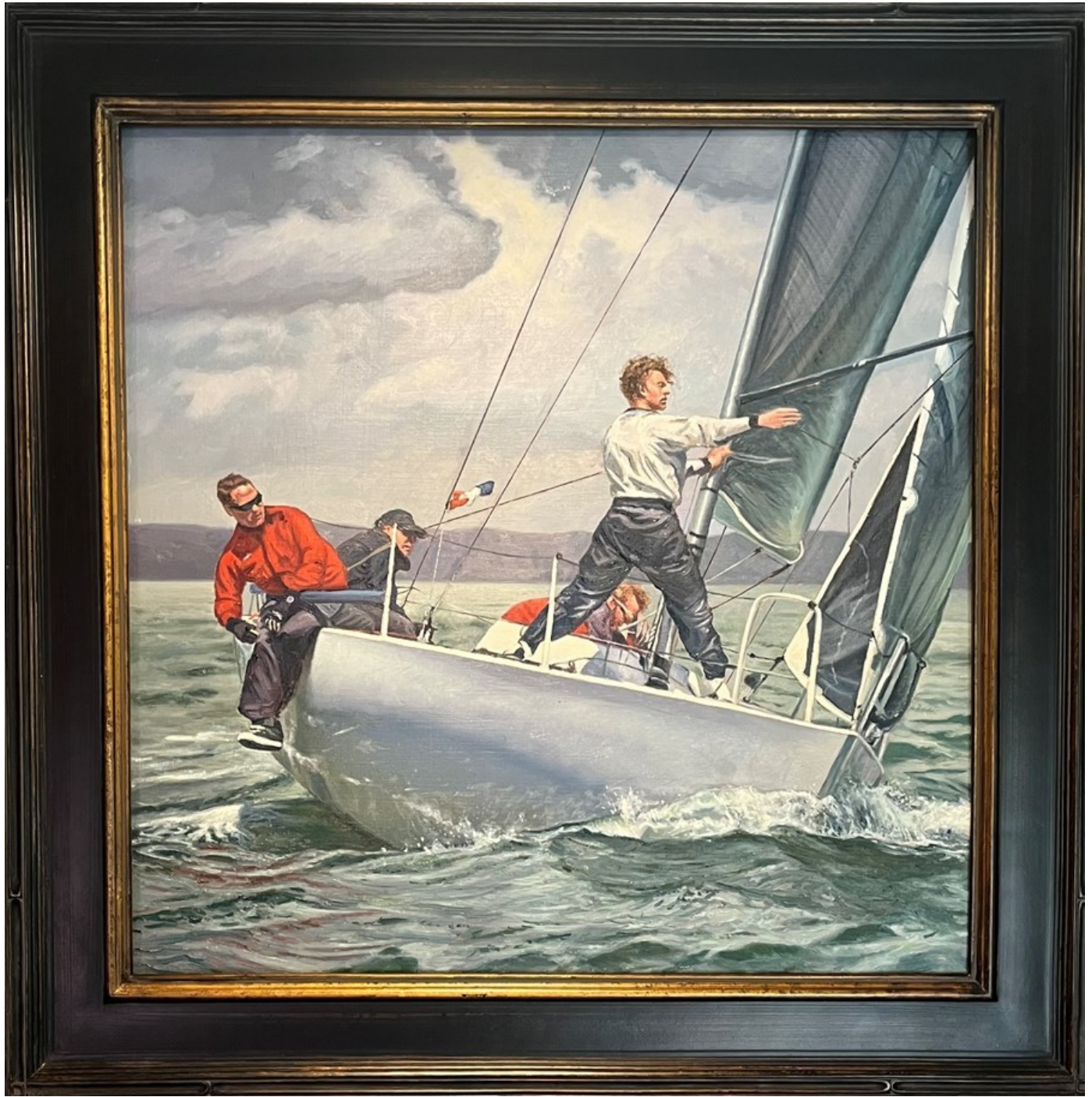
"The Storm of Ipswich Bay" 2024, Oil on panel with custom made frame, 81 x 81 cm, 32 x 32 in

GALLERY POULSEN CONTEMPORARY FINE ARTS - COPENHAGEN