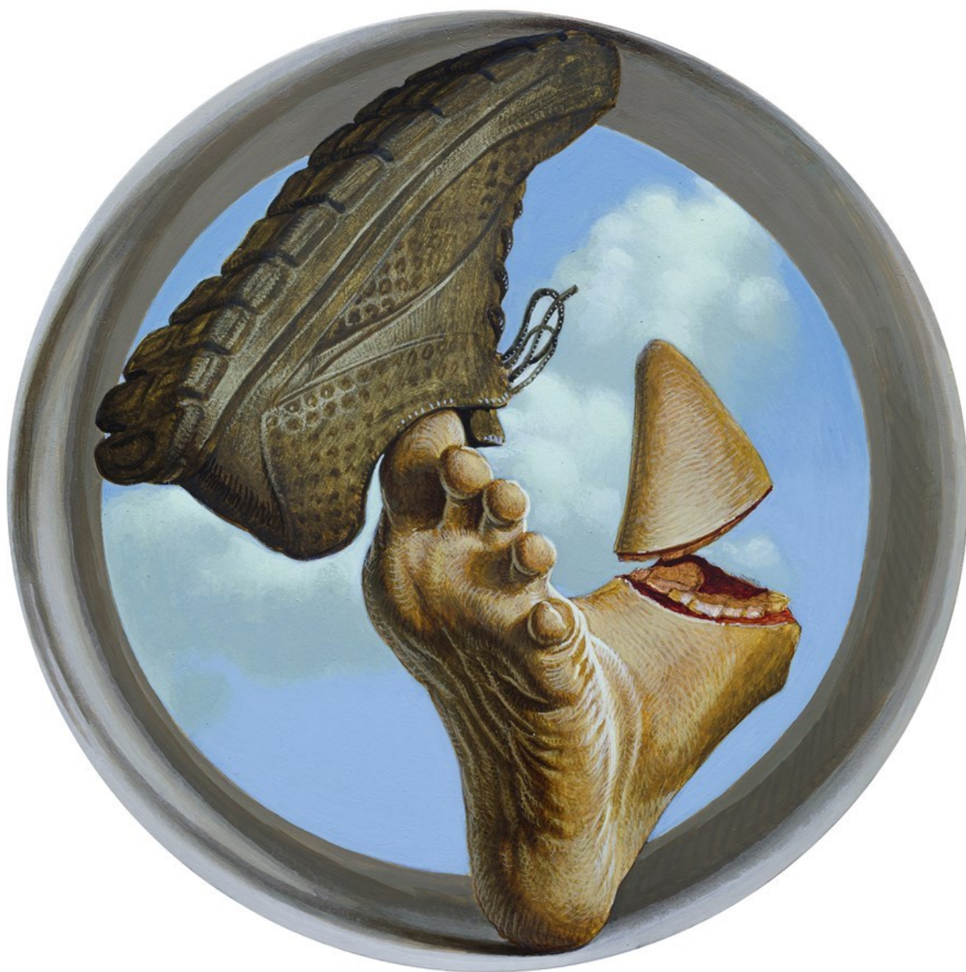
"Right Foot" 2024, Acrylic on wood, 25 cm diameter, 9,8 in diameter

GALLERY POULSEN CONTEMPORARY FINE ARTS - COPENHAGEN