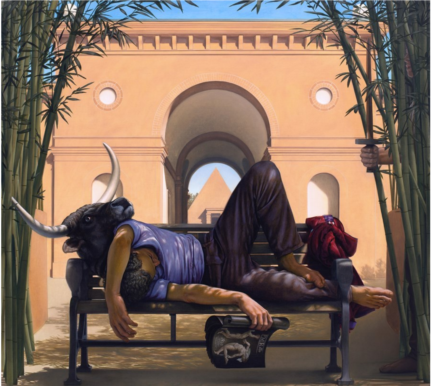
"La casa di Asterione" 2023, Oil on linen, 100 x 90 cm, 39,4 x 35,4 in

GALLERY POULSEN CONTEMPORARY FINE ARTS - COPENHAGEN