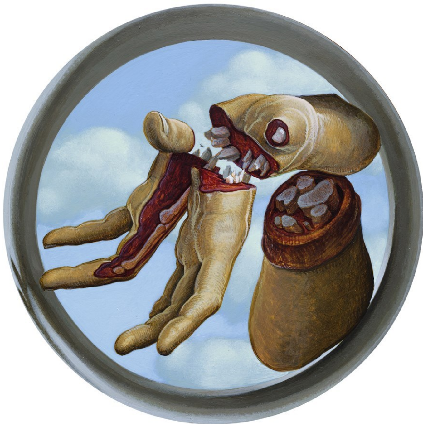
"Left Hand" 2024, Acrylic on wood, 25 cm diameter, 9,8 in diameter

GALLERY POULSEN CONTEMPORARY FINE ARTS - COPENHAGEN