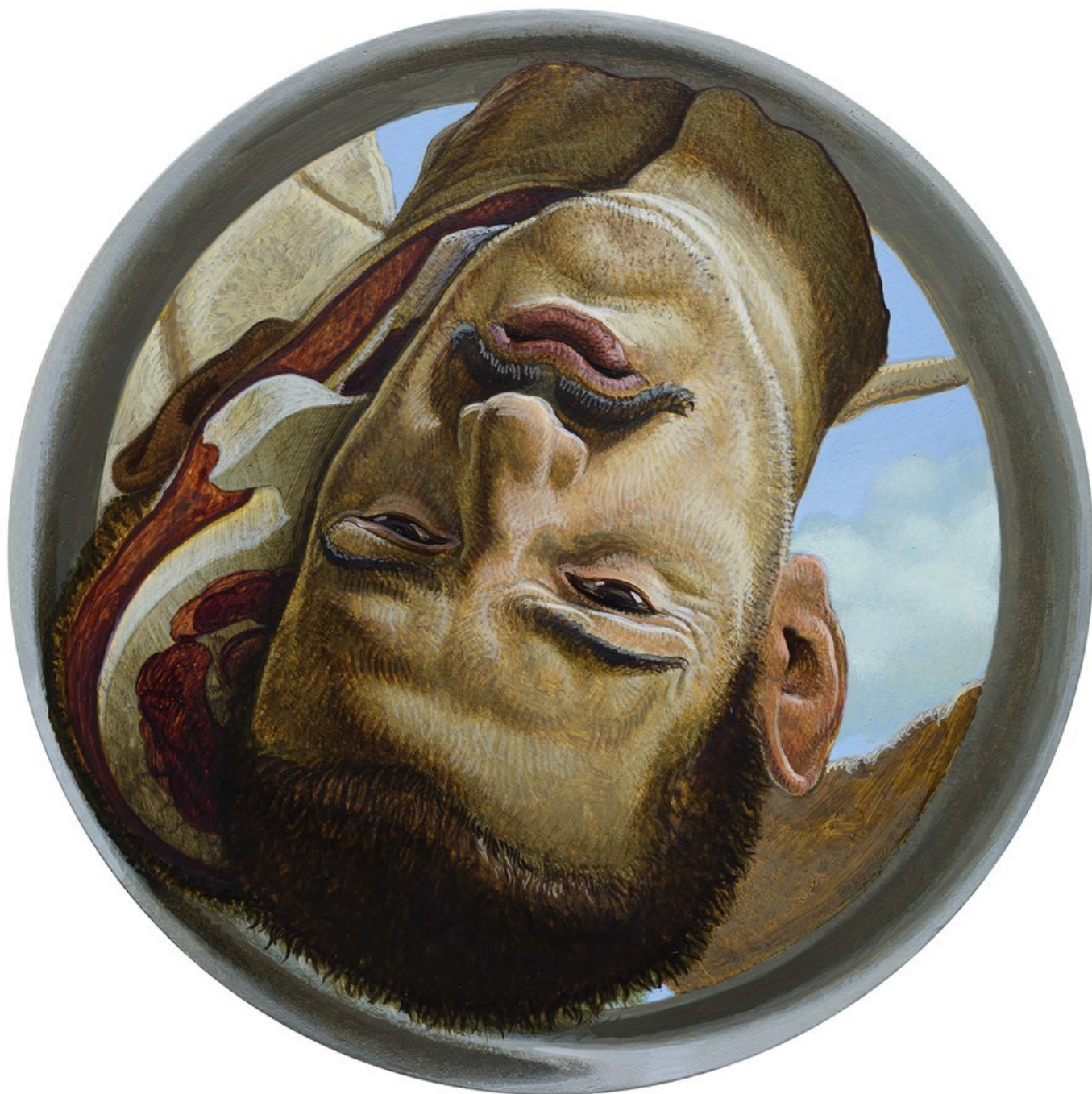
"Head" 2024, Acrylic on wood, 25 cm diameter, 9,8 in diameter

GALLERY POULSEN CONTEMPORARY FINE ARTS - COPENHAGEN