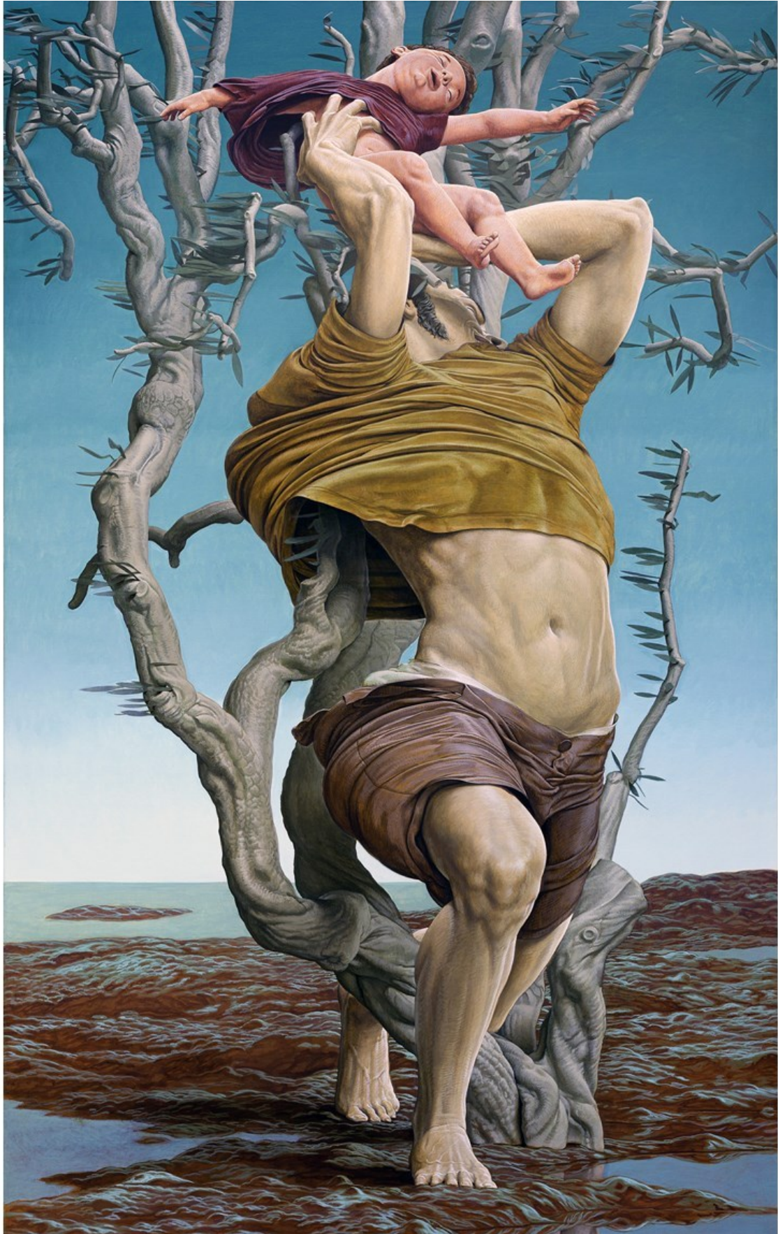
"Fatherhood" 2024, Acrylic on linen, 200 x 125 cm, 78,7 x 49,2 in

GALLERY POULSEN CONTEMPORARY FINE ARTS - COPENHAGEN