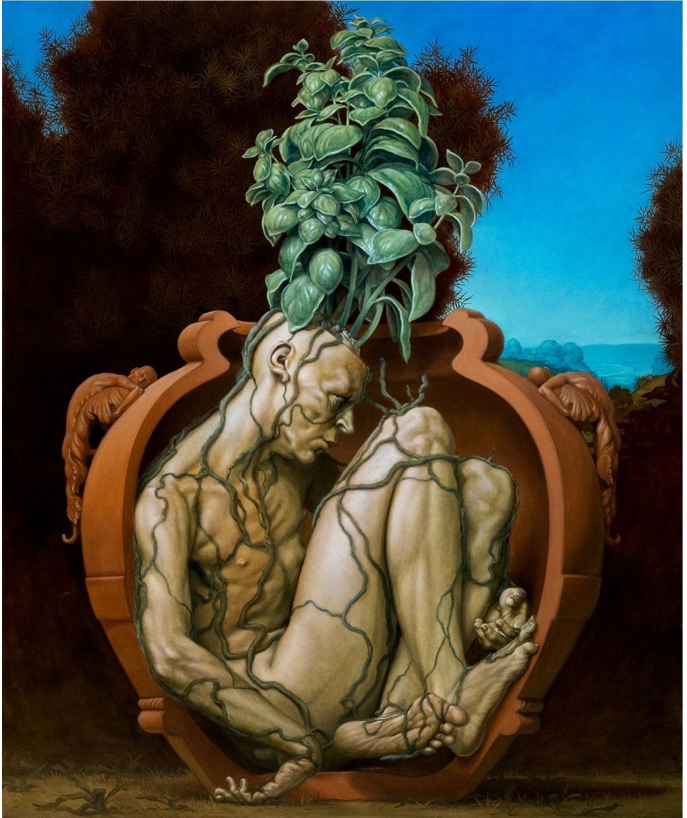
"The Greatest Ecologist" 2023, Oil on linen, 180 x 150 cm, 71 x 59 in

GALLERY POULSEN CONTEMPORARY FINE ARTS - COPENHAGEN