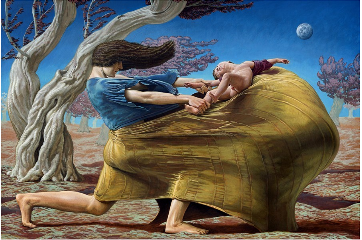
"Motherhood" 2024, Acrylic on linen, 80 x 120 cm, 70,8 x 51,2 in

GALLERY POULSEN CONTEMPORARY FINE ARTS - COPENHAGEN