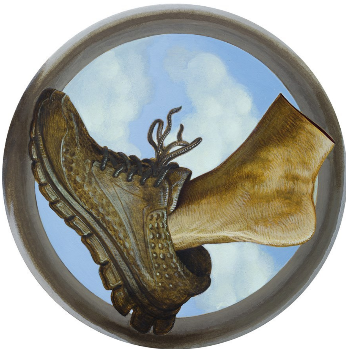
"Right Foot" 2024, Acrylic on wood, 25 cm diameter, 9,8 in diameter

GALLERY POULSEN CONTEMPORARY FINE ARTS - COPENHAGEN