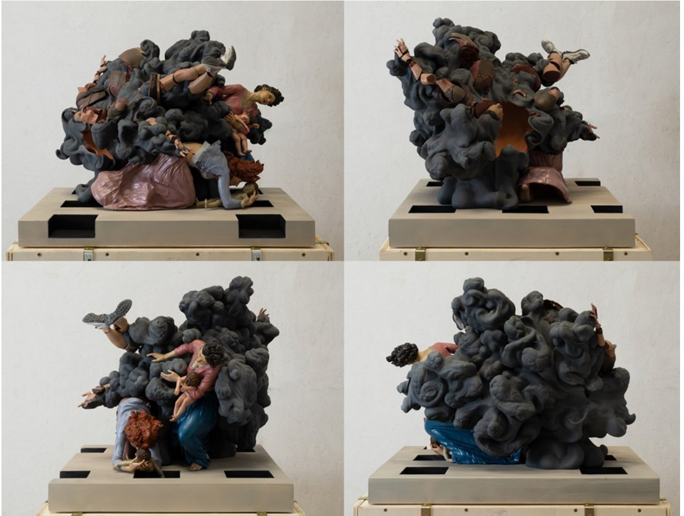
"Massacre of the Innocents, after Beato Angelico" 2024, Oil and acrylic on resin, 45 x 50 x 45 cm, 17,5 x 19,5 x 17,5 in

GALLERY POULSEN CONTEMPORARY FINE ARTS - COPENHAGEN