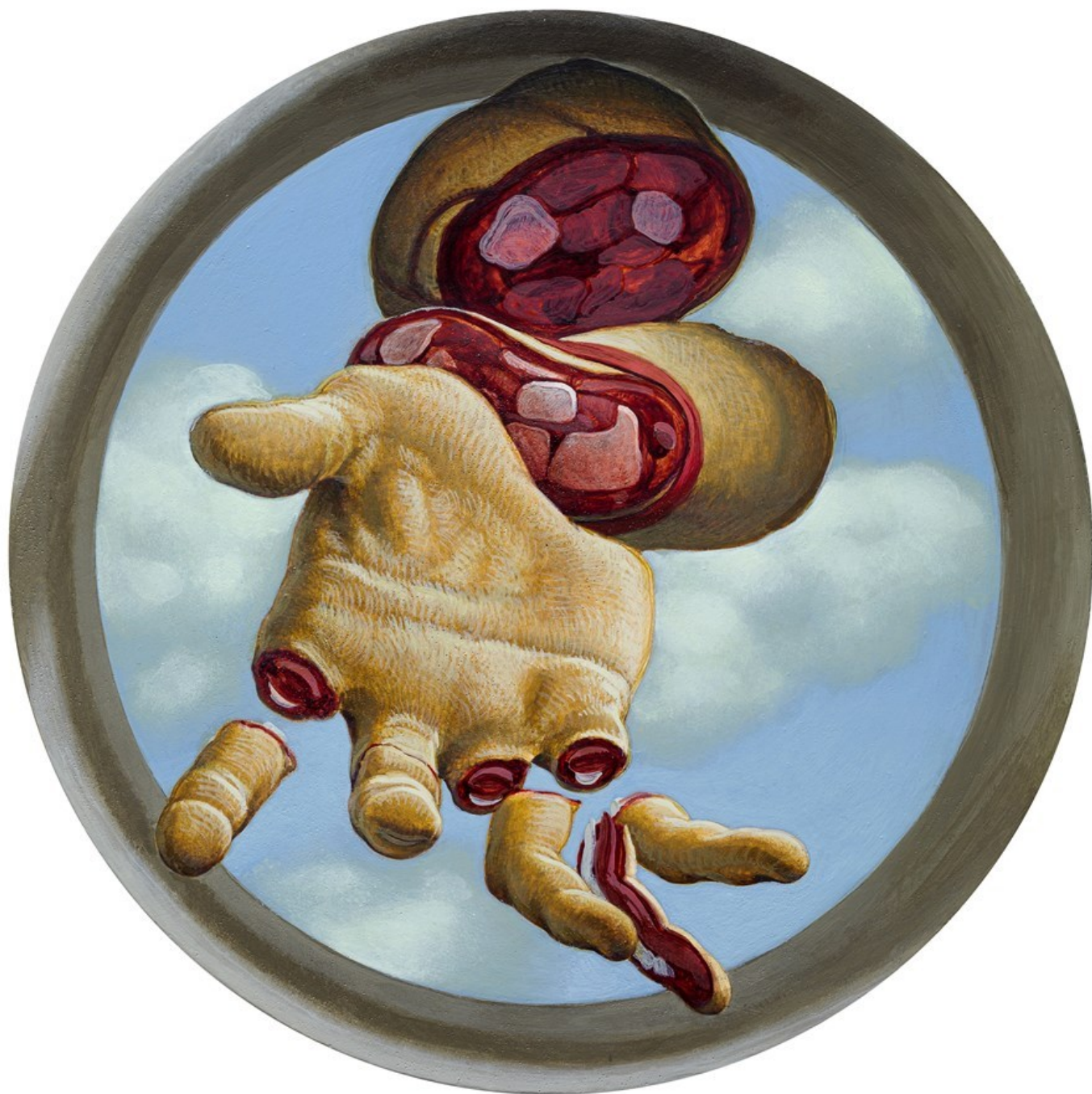
"Right Hand" 2024, Acrylic on wood, 25 cm diameter, 9,8 in diameter

GALLERY POULSEN CONTEMPORARY FINE ARTS - COPENHAGEN