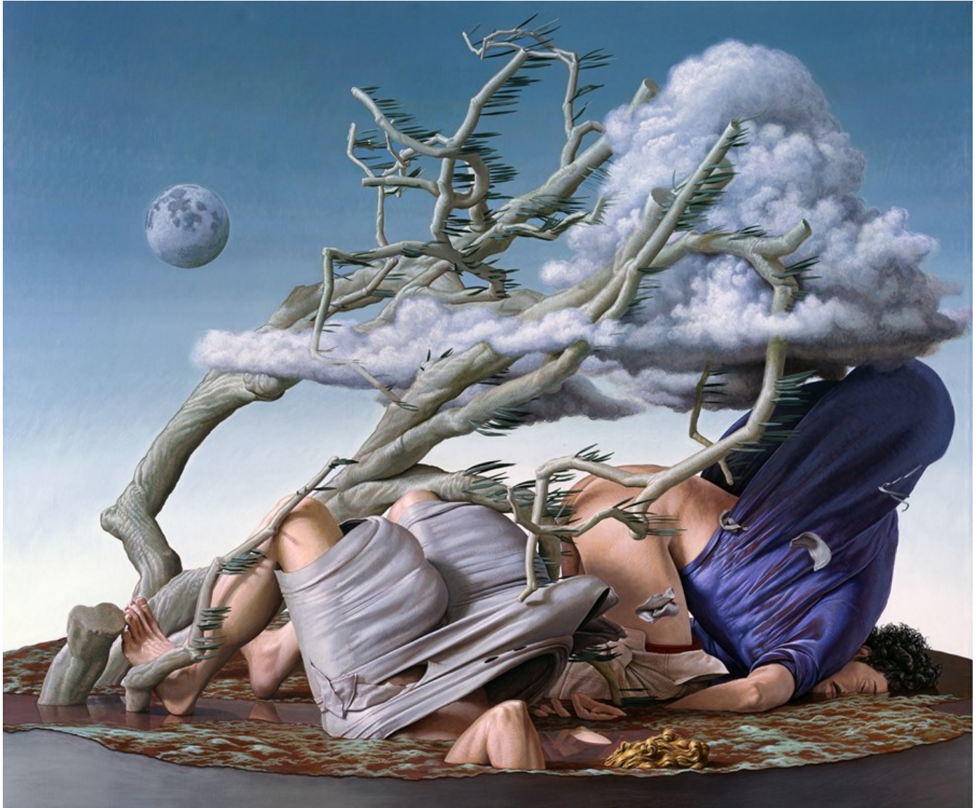
"Trespass in" 2024, Acrylic on linen, 151 x 181 cm, 59,5 x 71 in

GALLERY POULSEN CONTEMPORARY FINE ARTS - COPENHAGEN