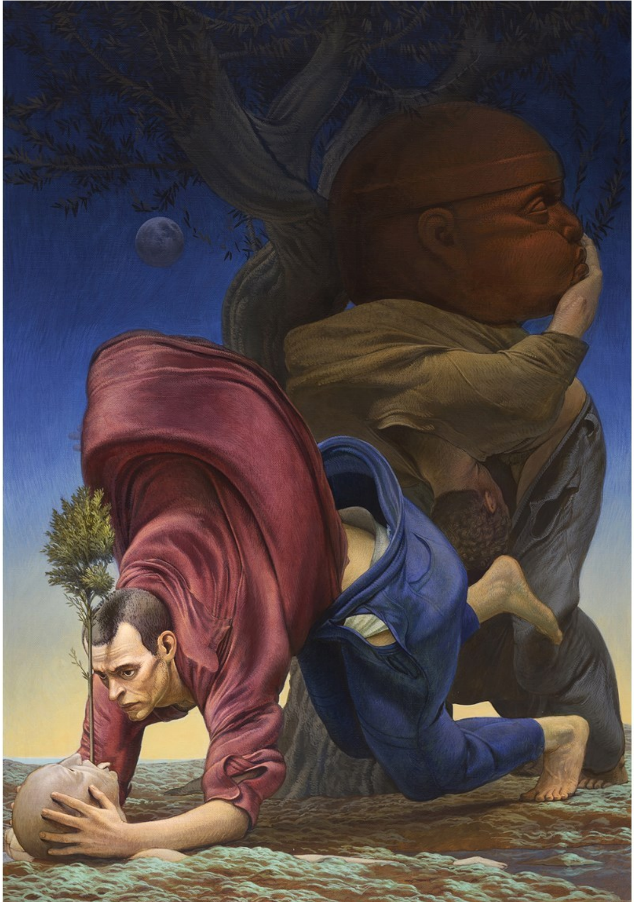
Lorenzo Tonda "Make way for the head" 2024, Acrylic on linen, 79 x 55 cm, 31,1 x 21,7 in

GALLERY POULSEN CONTEMPORARY FINE ARTS - COPENHAGEN