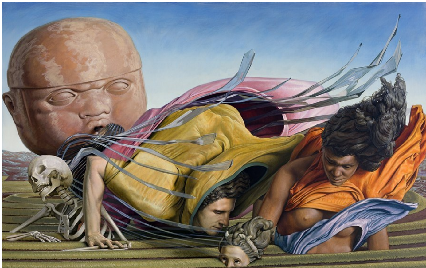
"Trespass out" 2024, Acrylic on linen, 125 x 200 cm, 49 x 78,7 in

GALLERY POULSEN CONTEMPORARY FINE ARTS - COPENHAGEN